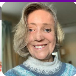
Claire Hall East Anglia