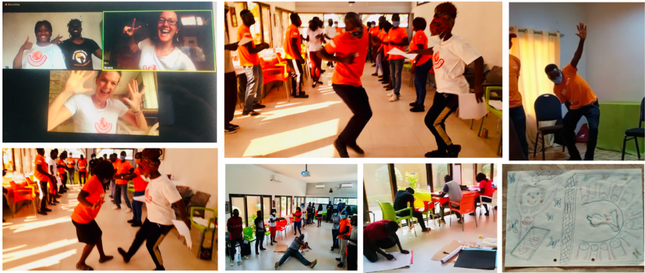
Images of CWB's training

"It was a joyful moment to realise I can talk about a serious subject and make children happy!"