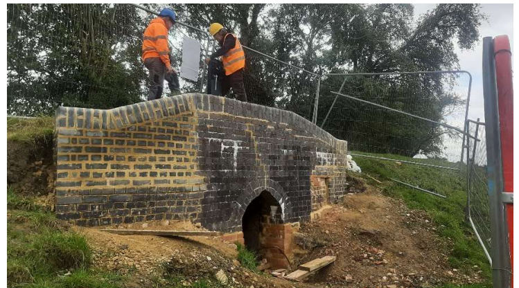
Above left rewatering section 2 towards the oil pipeline crossing Above right rebuild flood sluice near bridge two