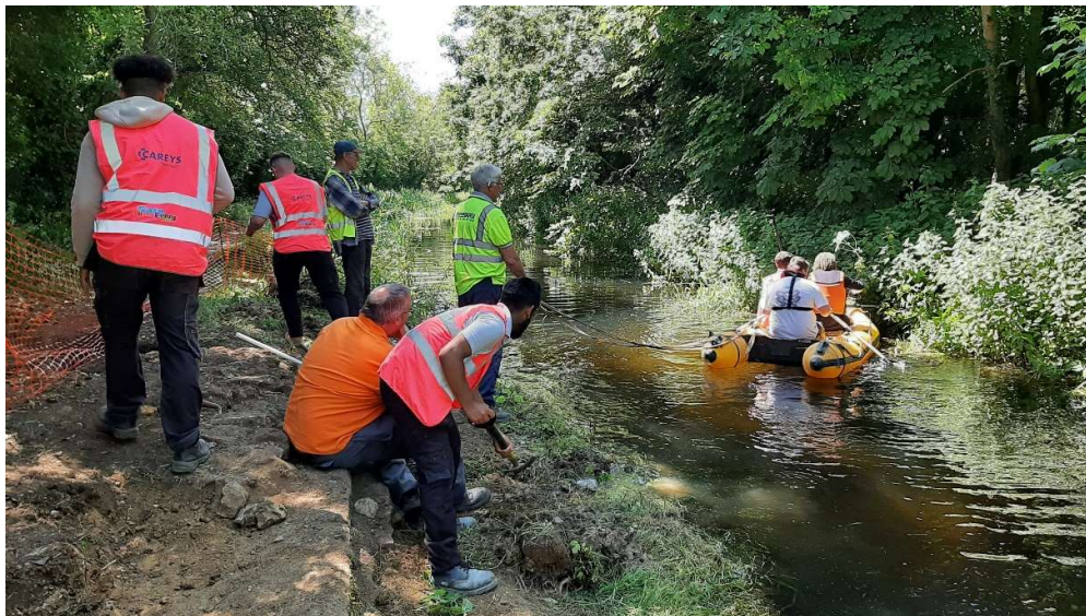
Uncovering the landing stage remains at Cosgrove