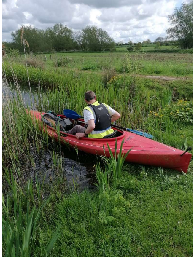
Above Bourton Meadow volunteers clearing the waterway to keep it an open space

We also have a camera at Bourton Meadow which is linked to Youtube. Take a look and see at https://www.youtube.com/watch?v=UfbomsVilyQ or search Youtube for Buckingham canal cameras