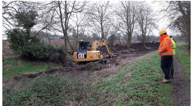
Above: left Hallam Land Management staff are one of the corporate groups to have helped seen at Bourton Meadow.