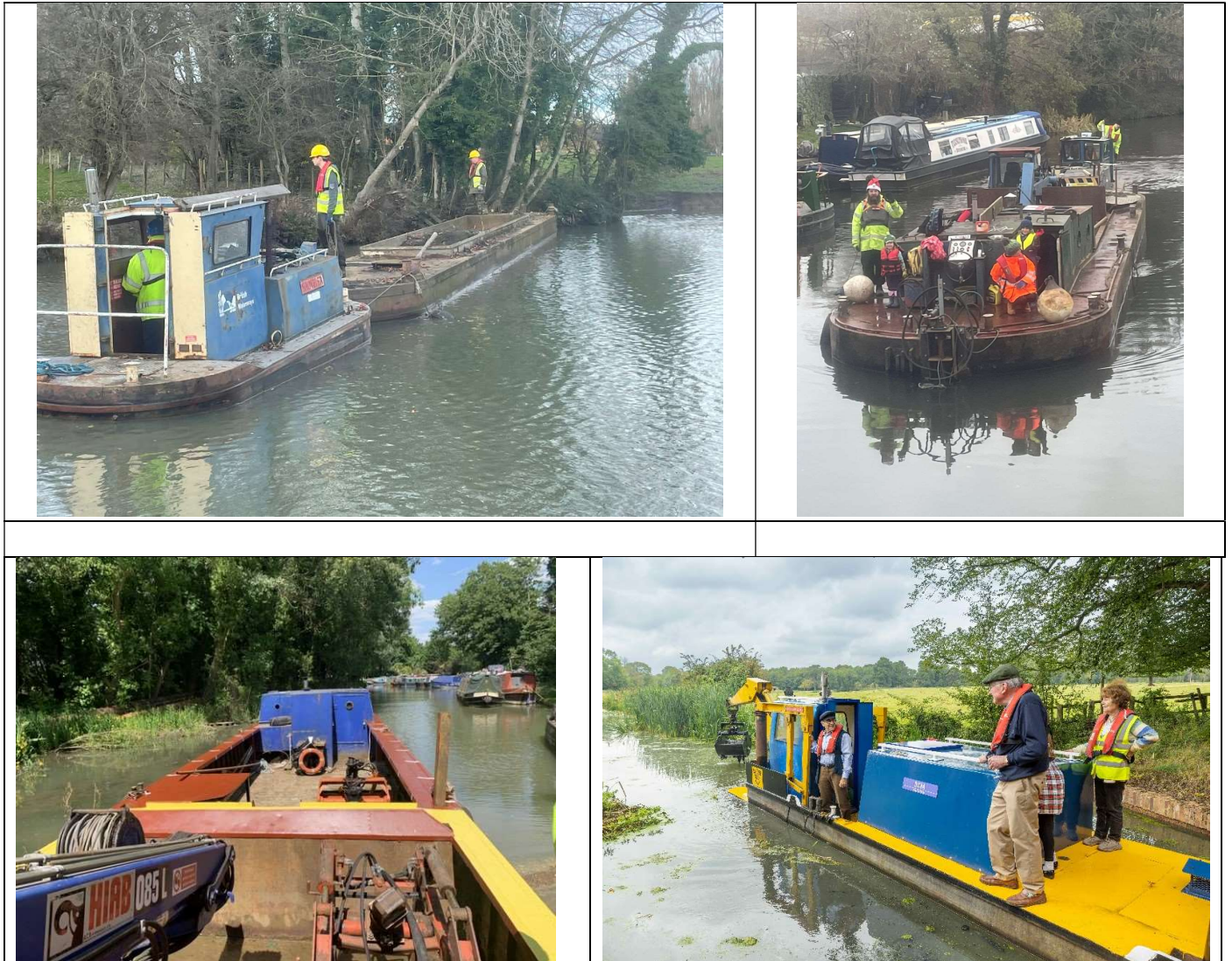
Above Left: CRT Tug SHOVELER moored at Cosgrove with "Harvey" the Hopper waiting to start unloading more dredgings. Above Right: Tug SHOVELER bringing PERSERVERANCE II north to Cosgrove where she will help us with dredging works whilst being restored and painted. Bottom left LOUISE and bottom Right: DIANA at the opening of Section One at Cosgrove

Our thanks to the CRT East Midlands Operations Team who have kindly arranged for the licence fees on both workboats to be discounted by 100% in recognition of the work we are able to do in assisting the Ops team and other voluntary groups in the Southern Area of the East Midlands Region. Additional thanks for the ongoing loan of Shoveler the tug to help us with dredging and other movements of vessels.