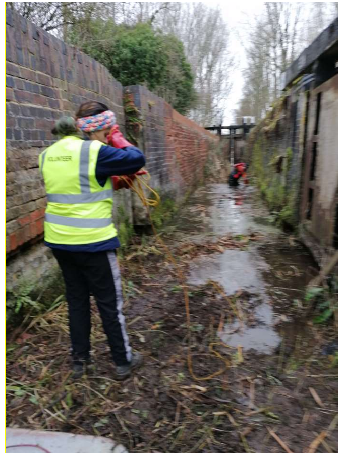
Clearing the lock at Hyde Lane