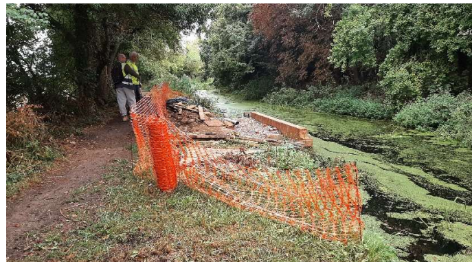
Top left: Volunteers from Arriva. Top right: Wildlife in the rewatered section at Cosgrove. Middle left: Wildlife in the rewatered section at Cosgrove. Middle right: work at the landing stage,