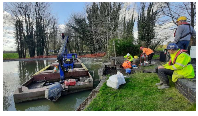
Above: left Kingfisher mosaic at Bridge One (AB).