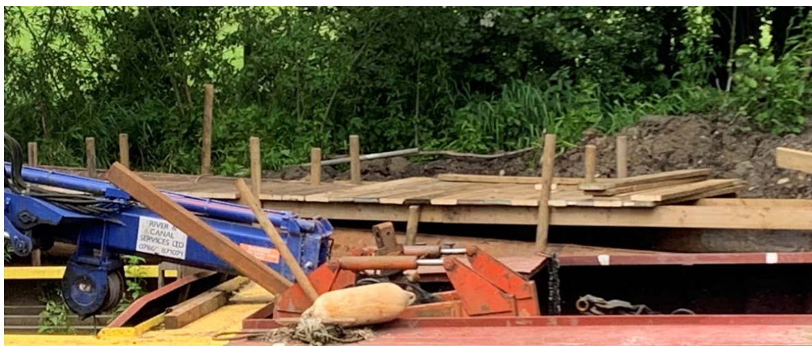
Above top left bridge one stop planks in place. Above top right is bridge deck after completion Above left dredging with crane boat LOUISE. Above right: the new 5-star bug hotel. Bottom: the new mooring created by BCS at Cosgrove