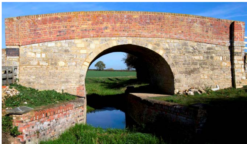
Above: the farm bridge restored by BCS at Little Hill Farm

A mile of the canal has previously been cleared and the bridge restored. No work has been undertaken this past year at Little Hill Farm although we hope to return there soon to clear vegetation.