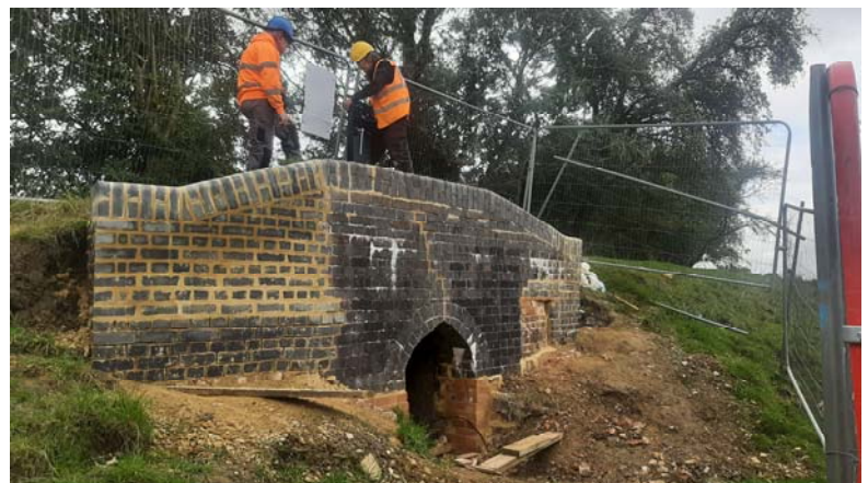
Above left rewatering section 2 towards the oil pipeline crossing Above right rebuild flood sluice near bridge two