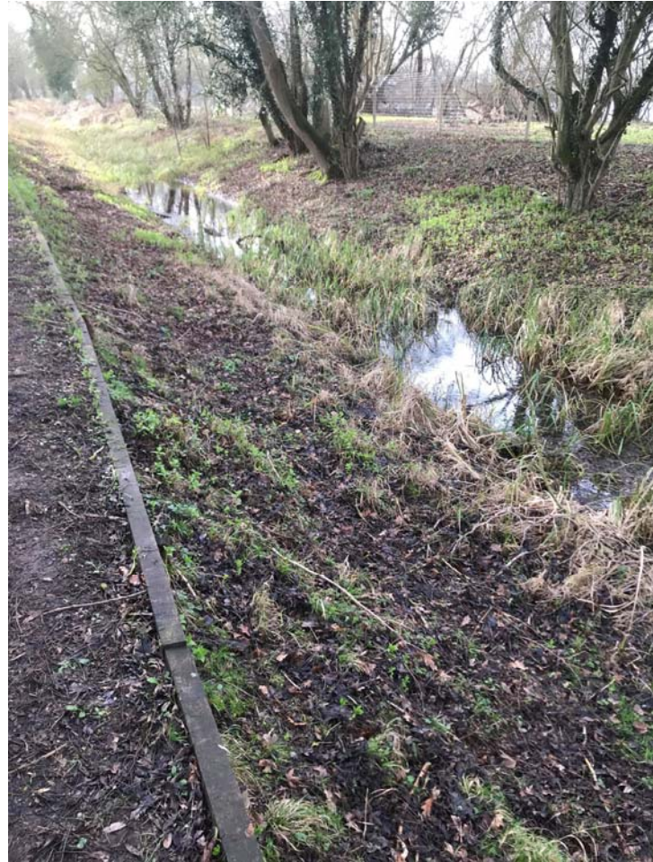
Hyde lane corporate group and slow rewatering