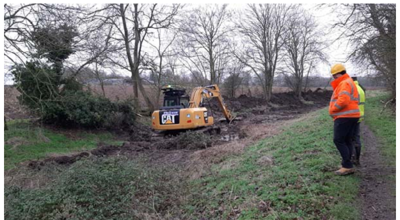
Above left Hallam Land Management staff are one of the corporate groups to have helped seen at Bourton Meadow (AB). Right starting the work scraping the bed at section three near Bridge Two