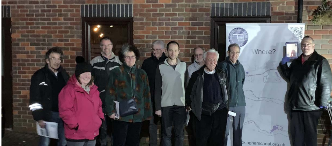
Above the 2019 AGM held March 2020 outside the hall due to COVID. The 2021 AGM was held online as per government guidelines.