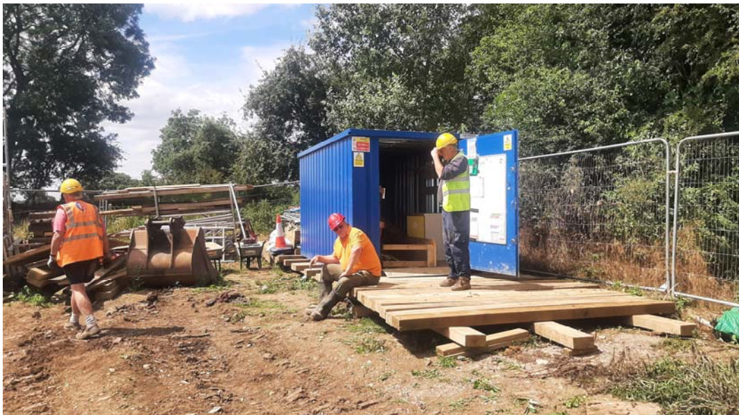
Above top Wildlife in the rewatered section at Cosgrove. Middle left slit trench work: Middle right, Bridge 2 bed exploration of the approach from the A5 side with our 1t excavator Bottom team setting up bridge two compound