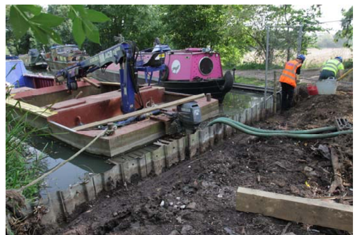
Above left one of the amazing rebuilt stone walls on the bridge approach ramps. Above right the piling being told its days are numbered and prepared for extraction.