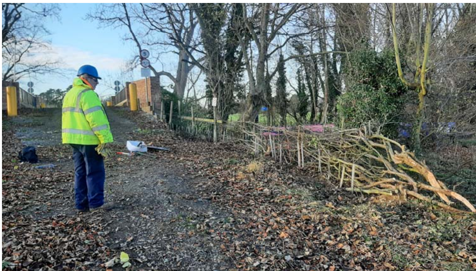
Above – Hedge laying along the Bridge One ramps (AM) Front cover – Top - Bridge two preparing for temporary fencing to allow excavations (TC) Bottom left – Dredgings ready to be offloaded at Cosgrove (TC) Bottom right – Bug Hotel (TC)

All photographic copyright is acknowledged