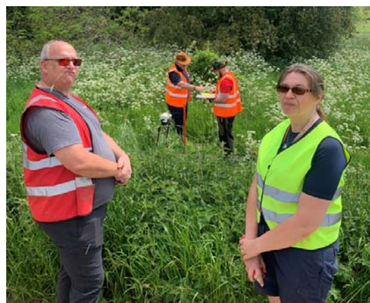
Above top excavations of the Burrows site near the brook. Bottom left field walking and bottom right geophysics on the meadow land at Cosgrove