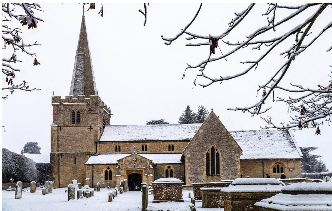
All Saints' Church, Down Ampney (the new RVW window is on the right)