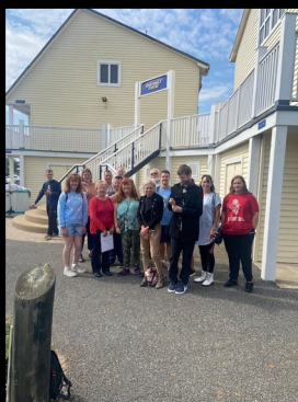
Our new mini bus and Butlin's 2022

travelled in our new ShoutOut minibus... we now have ShoutOut money boxes for our 'penny for petrol' funds. Members, trustees and volunteers are collecting lose change to fuel for trips.