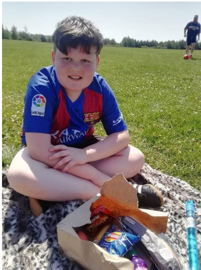
Packed lunches go down a treat!