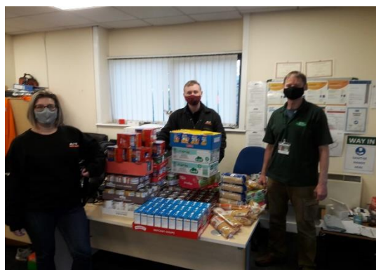
Collecting donations from AFI Uplift