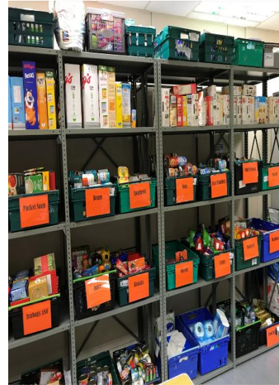
Stock organised for parcel packing

All of our plans soon came to a halt as a result of the Covid Pandemic.