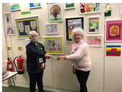
Washington Rotary Club give £200 to help us buy Xmas gifts for teenagers

The generosity of the local community was not restricted to Christmas. This unprecedented situation has led to an exceptional response in donations, both of food and financial support. People have reacted with such kindness and thought so compassionately about those less fortunate. It has been both heart-warming and humbling to witness. Unfortunately, the full economic impact of the pandemic is yet to peak and regrettably, will be felt for many years. The financial donations we have received this year, will cover