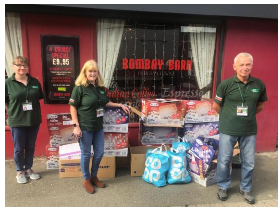
Collecting donations from Bombay Barn

It has been far from a normal introduction to a volunteer role with WCFP but I have been struck by how totally committed to offering the best possible service to our clients the whole team have been. Some have continued 'on the front line' as it were, while others have been forced to take a more 'hands off' role due to their own health circumstances, and have been beavering away in the background. My own role was initially 'front of house' but I now do some collecting and sorting of donations (drivers are really useful!) and preparing food parcels. The generosity of our local community has been staggering throughout. There is a real recognition of need and a desire to help in any way possible. It is humbling to see.