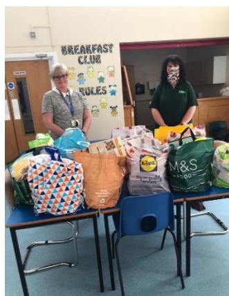
Blackfell Primary School's Harvest Festival donation

In early October WCFP were informed of a positive Covid contact who had entered Unit O, all known people who may have been in contact were informed, the Galleries management was also informed and the unit was deep cleaned that afternoon. Consequently, there was no disruption in service. The Trustees decided to offer packed lunches during school holidays for younger children. The first of which took place in the summer from Unit O with support given to Oxclose Church, St George's Church and Washington MIND, as other outlets. This