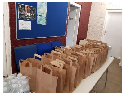
Packed lunches available throughout the holidays to all school children

Social media and the online space have been both lively and a valuable tool for WCFP in the past 12 months. Online channels, mainly Facebook, have allowed us to keep our clients and donors informed of the changes going on both organisationally and in response to the pandemic. This includes the usual information such as the stock that we require, but this year also news of opening times, closures across any of the sites, updated safety protocols to be aware of, and also of the various different support schemes we have had running throughout the year such as the packed lunch scheme.