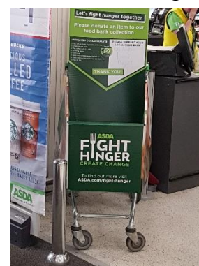
Our collection point at ASDA, Washington

In September three trustees were independently advised, by a member of the Washington Store, that Asda was no longer supporting independent food banks and that the end of aisle donation box was being removed. WCFP contacted IFAN, as this would have a country wide effect on all independent foodbanks. IFAN contacted Trussell Trust and Asda for confirmation. WCFP were informed that this was a local decision by the Washington store and was not a head office decision.