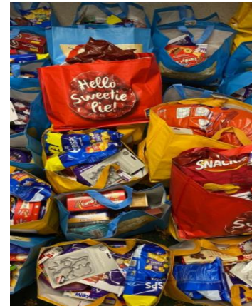
Non-perishable packs for the Christmas Give Away

appointment, during the second week of December, to collect the Christmas foods such as advent calendars, selection boxes, biscuits as well as soft toys. Meanwhile the Galleries management had been approached for use of another unit for the week and they offered us Unit J, which the volunteers were able to make feel more Christmassy. When people called, they were asked if they would like fresh food to be delivered on Christmas Eve. This enabled WCFP driver volunteer rotas to be compiled and on Christmas Eve fresh produce was collected from the local supermarkets and taken to Oxclose Church where the WCFP volunteers made up individual parcels for each family size and these were then delivered to the home addresses. This was a tremendous success and it was done with high COVID protection for everyone.