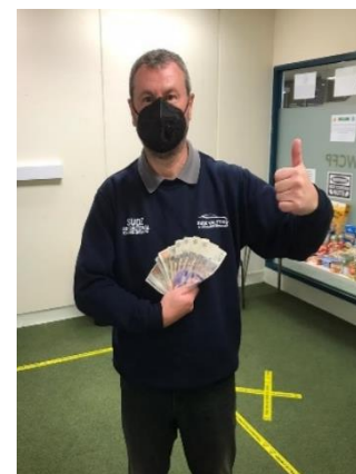
£200 from Sudz Valeting Services

People of Washington and various companies, have been so kind and completely overwhelmed us with their generosity, making this our most successful year.