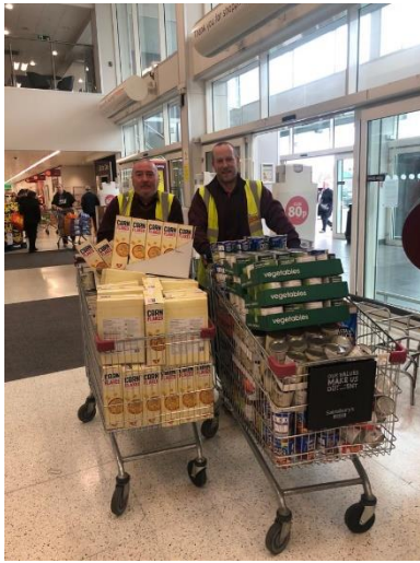
Sainsbury's keeping supplies flowing to the WCFP during the first lockdown

It became apparent that Unit O could not function safely according to the information being given out by Governmental Health agencies. However, the WCFP lead volunteer at St Michael's Church indicated that that outlet would continue to remain open as long as possible