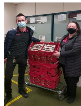
Christmas goodies from our friends at Iceland