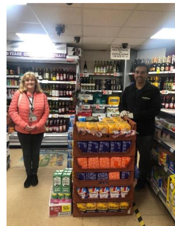
Premier Singh convenience store, Oxclose

During April the trustees were approached by the lead volunteer at St. Michael's for financial assistance as Church income was falling. The WCFP trustees agreed to double the amount of rent being paid each month to St. Michael's Church for allowing the Church be an outlet for WCFP.