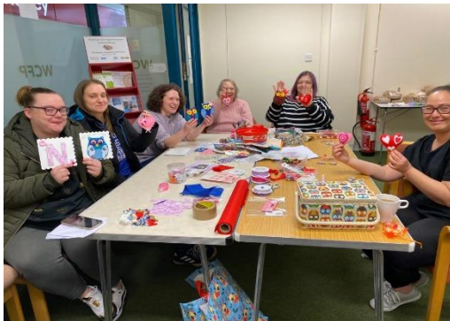
Our fantastic Friday Craft Club, pre-COVID

I joined WCFP at an exciting time in their history, having just moved into a unit at The Galleries with the intention of not simply being a food bank, but also offering community resources and space. Plans were made to offer refreshments and space and time for social interaction, a craft group began to meet, and other activities were in the pipeline to compliment the work already being carried out.