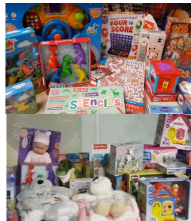
Toys and games collected via our Reverse Advent Calendar

The generosity of our local community was phenomenal. The donations from individuals, families, neighbours, resident's group, schools and local businesses, guaranteed lots of Christmas happiness for over 80 families, and really it did spread Christmas joy. One client, whose husband had lost his job due to the COVID situation, commented that they were only just managing, and the prospect of Christmas was filling her with dread. She cried with relief when she saw the toys and gifts and said it would totally change Christmas for their family. Our clients were overwhelmed and wanted me to pass on their thanks, to those who donated. Well done Washington!