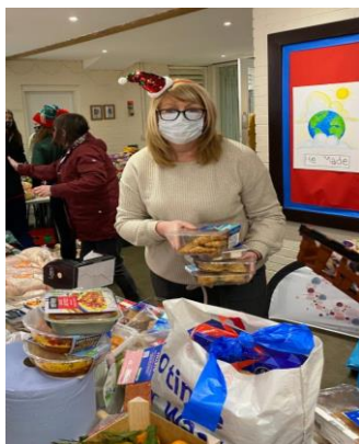
Preparing fresh food hampers for families on Xmas Eve

I would like to thank everyone for their commitment to provide support, advice, and food parcels to those who have needed us throughout the year.