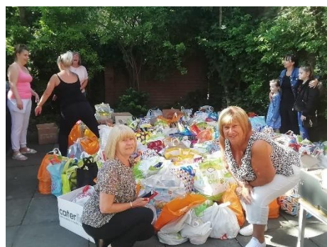
One of several 'Leave-a-tin' collections organised by Washington residents

I am proud to be part of, not only the front of house team in WCFP, but the whole of WCFP who have worked together to provide an exemplary service in this most difficult year.