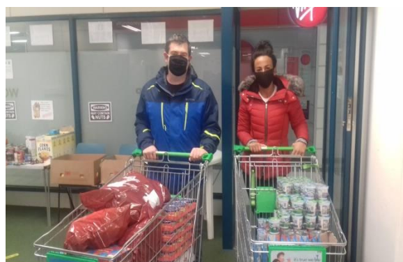
Bede Gaming- one of our biggest supporters in 2020

There were fewer Harvest Festivals this year but we thank those schools which did contribute to our stock levels. This year the community and local stores have really upped their contributions. We have had so many donations of goods and cash that we are in a very good position both financially and stock-wise to meet any reasonable increase which may arise.