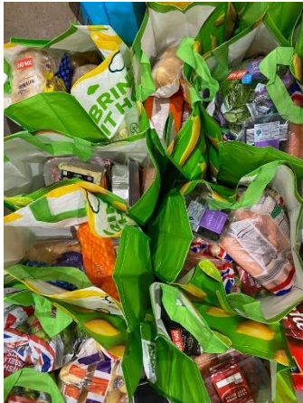
Xmas Eve parcels of fresh meat, fruit, veg and baked goods.

Before Christmas we contacted all local schools, churches and Gentoo, asking if they knew of anyone who would benefit from a one-off Christmas Surprise Parcel. We gave out over two hundred parcels, included in each was a leaflet asking people to come into the Galleries on