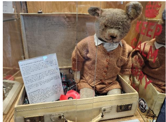
VE Day 80 th Anniversary Exhibition