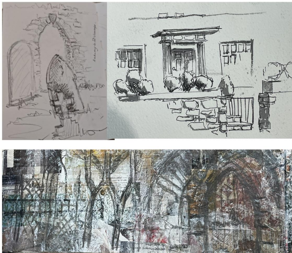
Heritage Open Days Sketching Trail Artwork