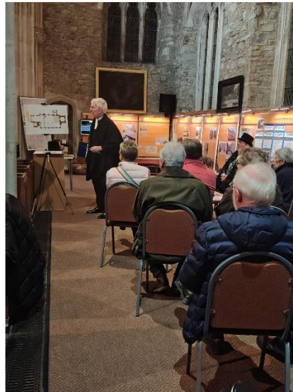
Talk on the architecture of the church by two time-travelling gents.