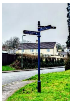
New Fingerposts in Bampton.