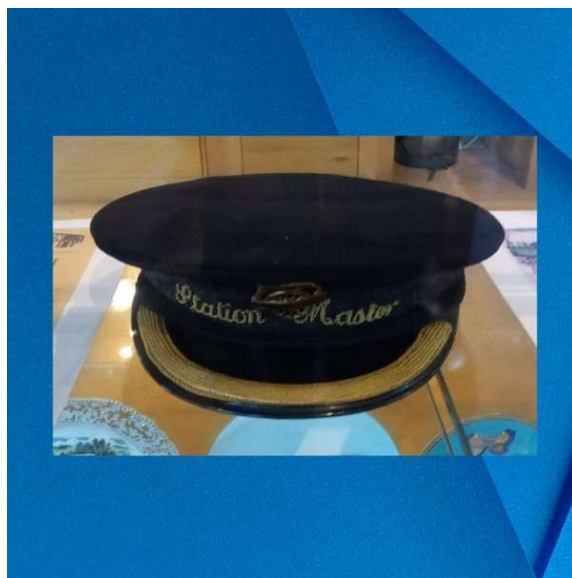
Figure 3 - The Station Master's hat from 1960 - just one of the many artefacts we have

Much work has been done following the acquisition of a computer and much paper material from the relatives of the deceased historian Tom McManamon. The contents of his broken computer have been rescued and transferred to the Curator's computer, where they can be searched - over 110,000 files in over 11,000 folders! The slide collection has been rationalized and stored. Work has started on cataloguing some of the boxes of papers, thanks to Elise Collins, who has archiving qualifications. To date about three-quarters of a box have been catalogued – 549 separate entries to date. Work continues. Boxes of maps (all copies), archaeological specimens and a collection of 44 computer discs and two USB storage devices have been catalogued.