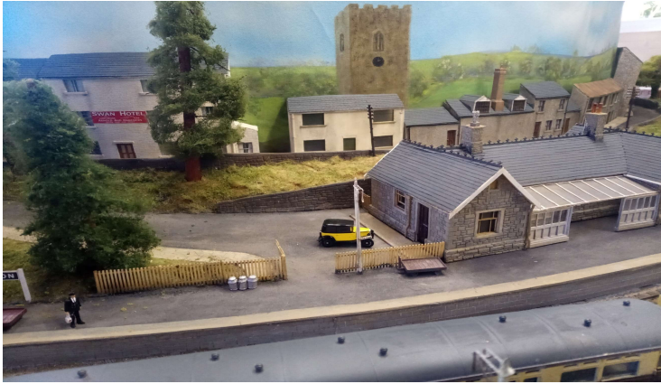
Figure 7 - Bampton Station Model and Model Railway