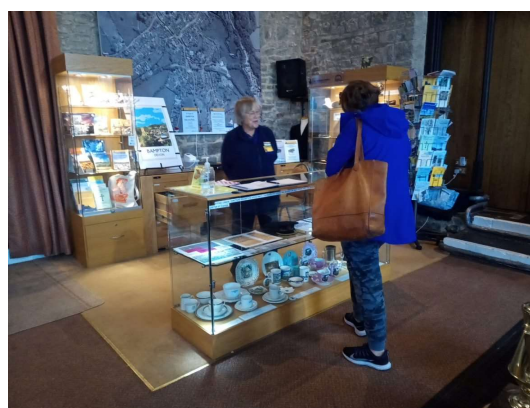
Figure 2 - The Visitor Centre

It was decided that footfall on a Friday afternoon session was too low to keep the centre open and so we changed our schedule and opened on a Thursday morning, Friday morning and all-day Saturday. This has worked well but some volunteers reported that they don't like the morning slots on a Thursday and Friday because it involves both opening and closing the centre which means their slot is closer to 2.5 hours than 2. It also means that for volunteers going out in the afternoon, it can be a rush if you only finish at one and then have to close up. It was suggested that we split these morning-only sessions into two 1-hour sessions but realistically it is very unlikely to get 4 people to cover these shifts. We are looking at ways we can make this work for our volunteers.