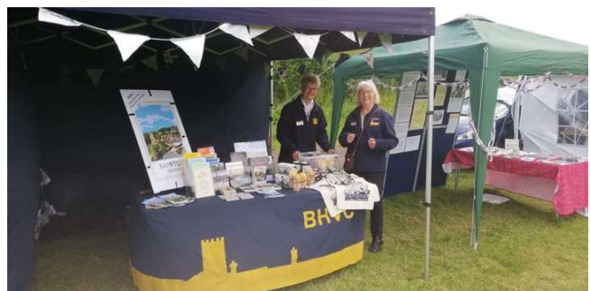
Figure 1 - BHVC Out and about

We could not have achieved all of these things without the continuing support of all our volunteers. All our volunteers are unpaid, and you each bring your own skill, experience, and enthusiasm to your role. Whatever your role, I want to thank you for your invaluable contribution. My particular thanks go to my fellow Trustees who work tirelessly and have made my job as Chair an enjoyable experience.