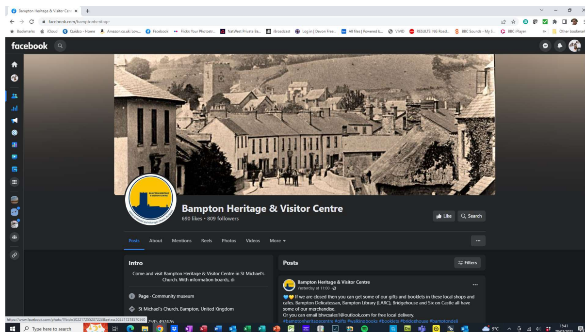
Figure 4 - The BHVC Facebook Page

Instagram: @bamptonheritagecentre https://www.instagram.com/bamptonheritagecentre/