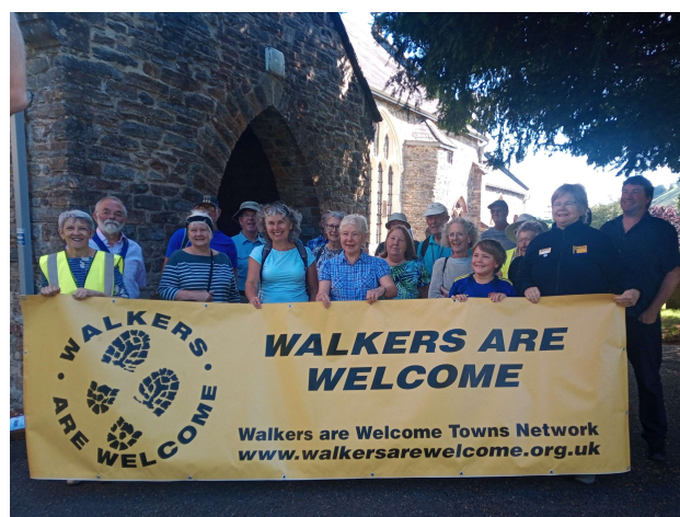
Figure 6 - Our first Walkers are Welcome event

Following the success of the original steering group in achieving the WaW status for the town, BHVC took over management of the scheme. We had our inaugural walk in August with an enthusiastic group of walkers taking routes around our great countryside. WaW status is important for Bampton, being a key part of our attraction as a visitor destination. We have so many great local walks and walkers can spend a weekend or longer exploring the routes and footpaths on offer. This boosts the economy for the whole town – accommodation providers, eateries, and shops.