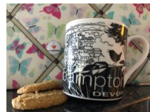
New mug design