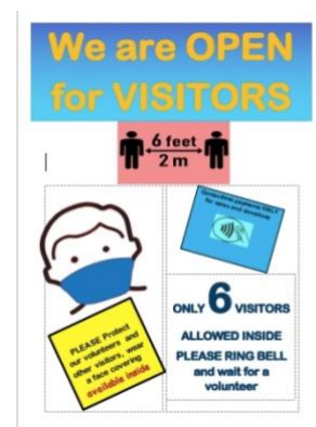
New entry sign

The Centre did re-open on 18 August on Saturday mornings only. These shortened opening hours ensured we were able to regularly open with our Covid19 trained volunteers working in pairs on each shift. This continued with a good number of visitors until we were forced to close again at the end of October for the remainder of 2020.