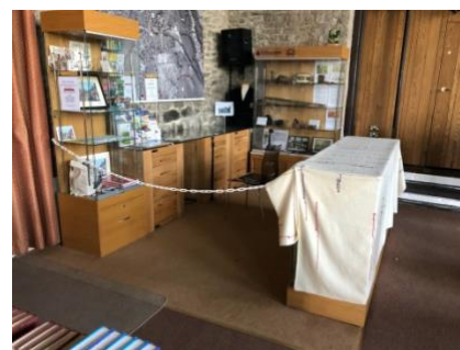
Closed and covered up