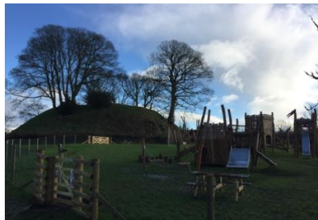
New playground with Motte in the background

In the end the information boards were not included in the first phase of this project, but the play equipment was always designed to educate children as to the history of the site. The play equipment is arranged around a mock wooden castle. It was officially opened in September.