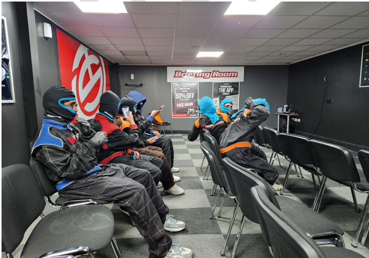
4. Tried and Tested activity(Go-karting) The boys having their safety briefing. End of the programme Dec 2024