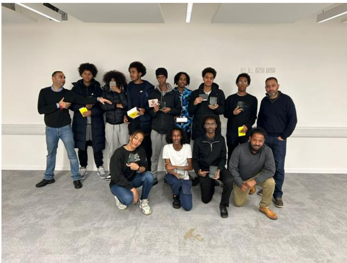
3. Staff, Trustees and Young People at the End of Programme Presentation Dec 2023