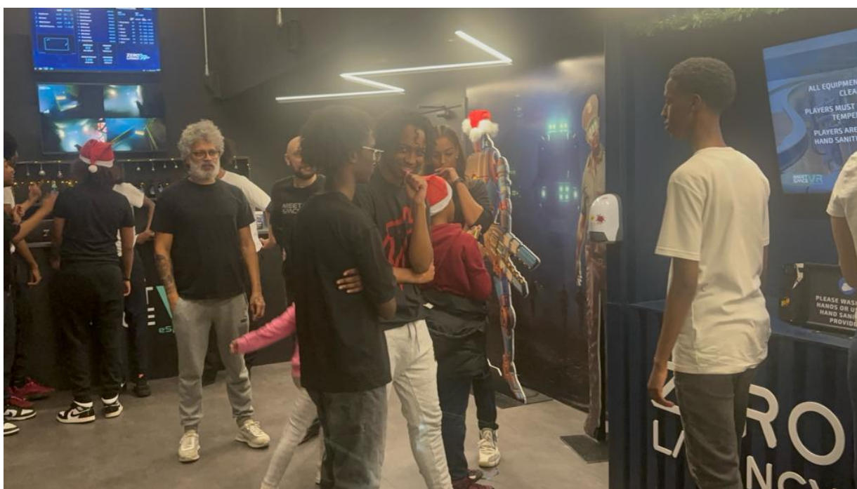
4. VR Activity following the end of the programme Dec 2024