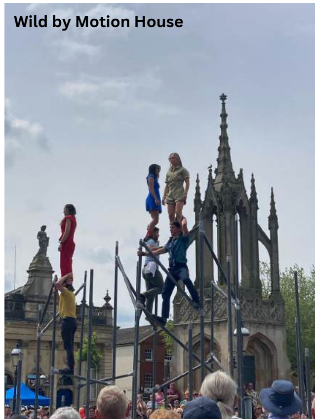
Wild by Motion House

The 'Makery' appeared both days, hosting 50 local makers who offered beautiful hand made goodies for sale, supporting local artists and businesses.