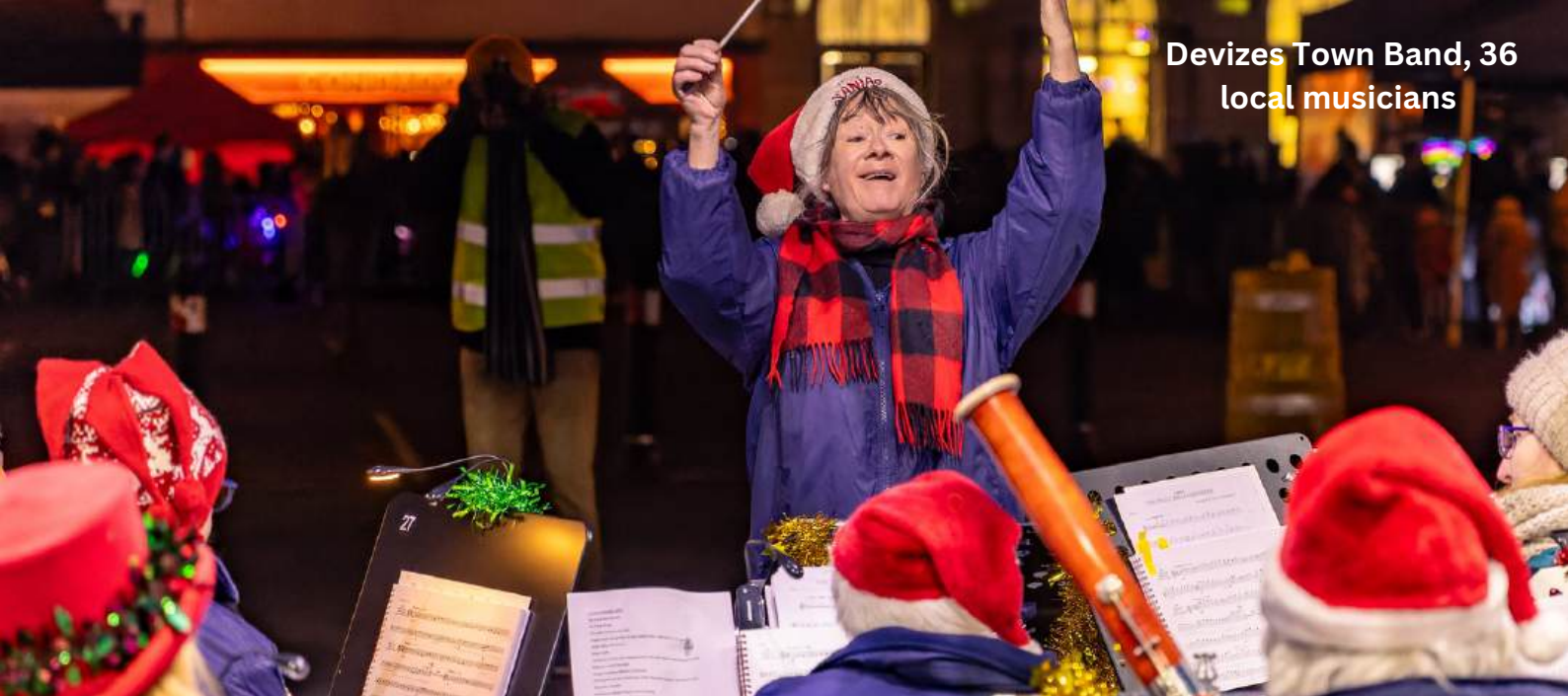
Devizes Town Band, 36 local musicians