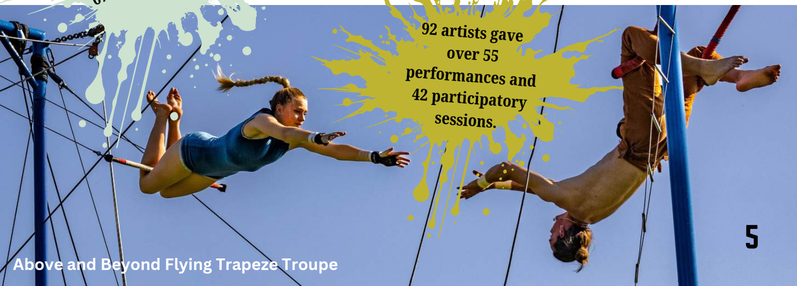
Above and Beyond Flying Trapeze Troupe

92 artists gave over 55 performances and 42 participatory sessions.