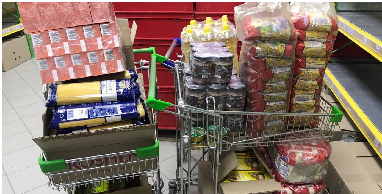
Figure 9: Supplies for Ukrainian orphanages

It will come to no-one as a surprise that the lives of the orphans supported by PaR were turned upside down. Children were required to practice emergency evacuation drills in response to fire warnings and bomb sirens after moving essential items to their newly furnished bomb shelters. Bedrooms looking out over fields and gardens were swapped for underground bunkers, dimly lit and smelling of damp. Happy, loud laughter and conversation was replaced by subdued voices, children having been warned that noises might draw attention to their location. Children watched as adults going about their normal business gathered to make camouflage nets for the army. Overnight, life changed dramatically.