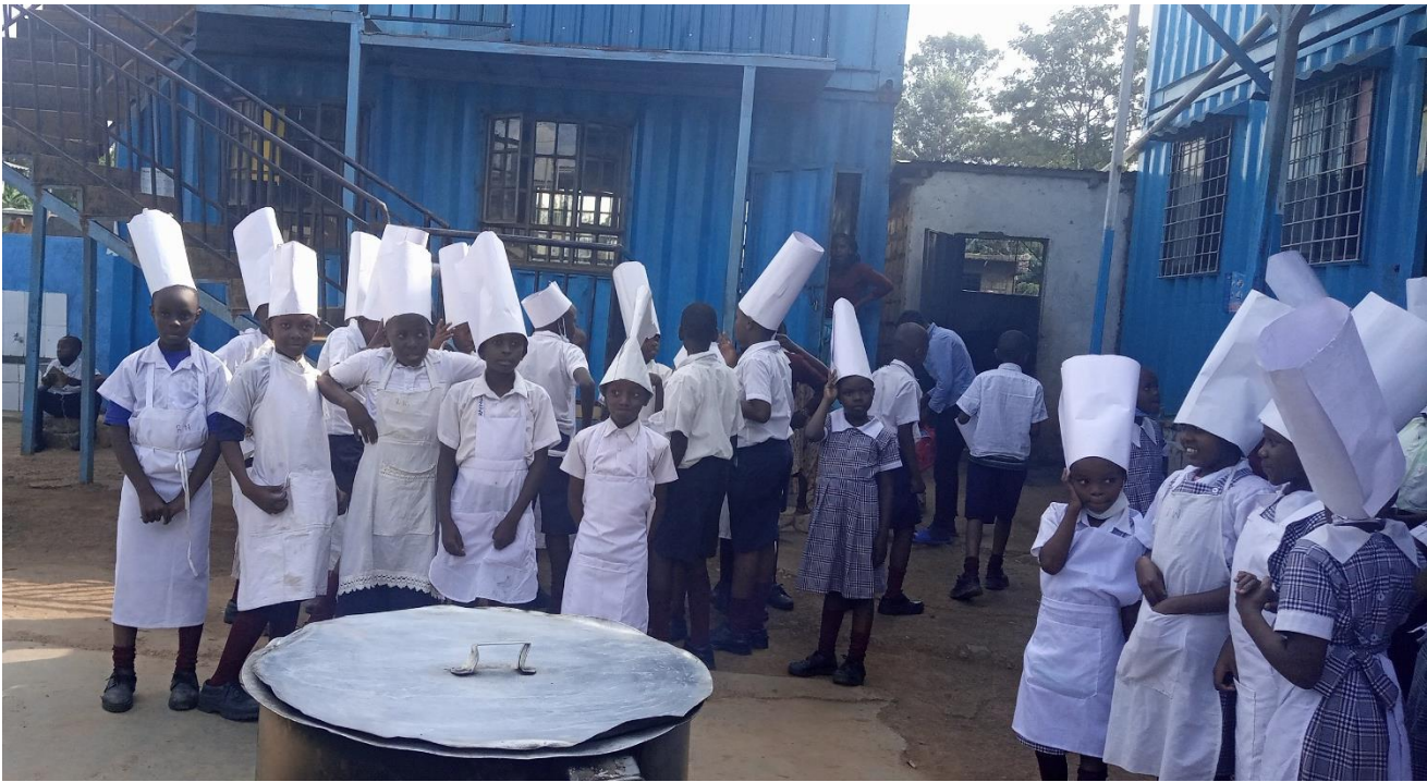
Figure 1: Pupils at Heri Junior participate in serving breakfast