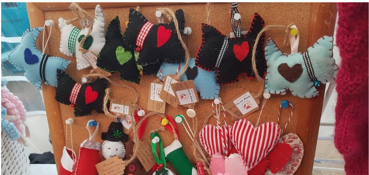
Figure 5: Handmade Christmas decorations for sale at Church Street Fair

As 2021 came to a close, fairs started up again which given how important these events were to the income of the charity, was a real relief. The charity chose only to attend the Church Street Christmas Fair on 21 November. As soon the charity signed up, volunteers quickly engaged producing craft items to sell. The charity had a good range on offer on the day and raised just over £800. Attendance was lower than before the pandemic, and people more hesitant about buying. It was good to be back selling at a fair, even though takings were lower than before the pandemic.