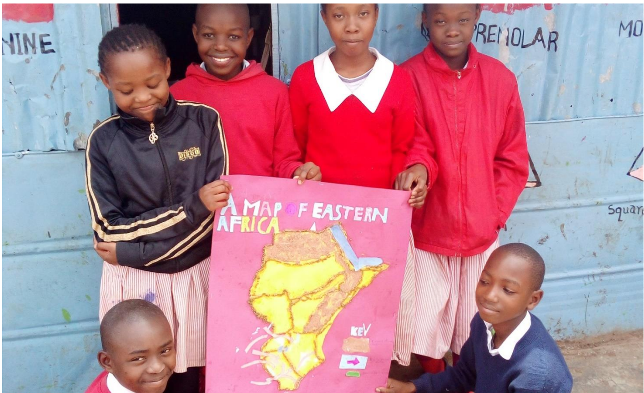
Figure 13: Excel pupils present their map of East Africa