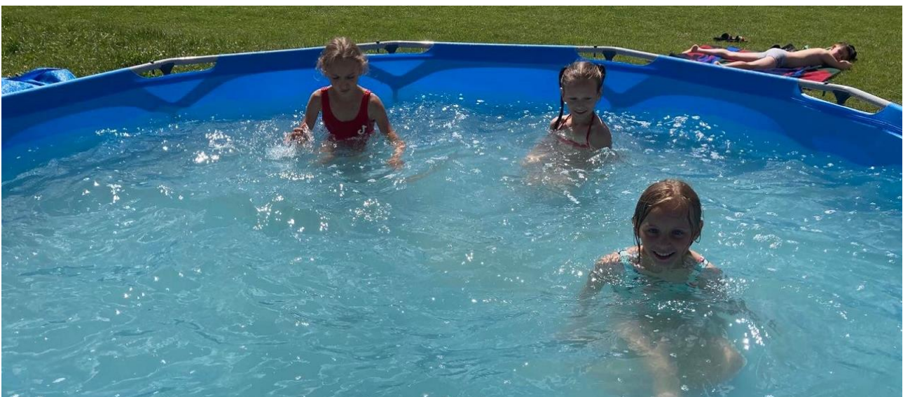
Figure 3: Swimming pool for orphans in Ukraine

Plans to visit Ukraine and consolidate work and plans were first impeded by COVID19 and then by the war that broke out in February 2022 when Russia invaded. The tragic situation in the country is incredibly distressing and the charity has worked hard to support orphans in meaningful ways, but living under such awful conditions, it has not been easy. For example, when children were unable to go away for their school holidays, the charity bought them a swimming pool. The charity has assisted on other ways such as medical supplies. The charity intends to continue its work in Ukraine and hopes the conflict will soon end with a free and democratic Ukraine. In the meantime, it will continue to look for ways to support the orphans it can.