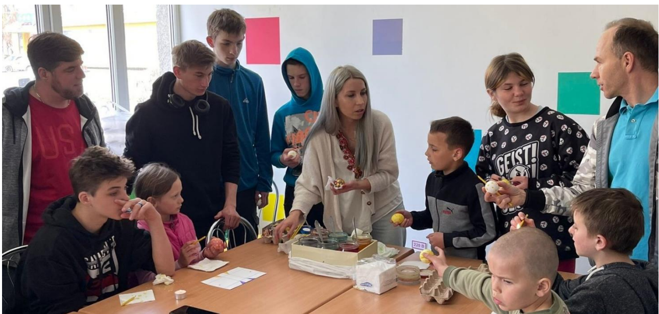
Figure 10: Egg painting with Ukrainian orphans

PaR remains committed to supporting the orphans of Ukraine in the long term through its partner Orphans Future Ukraine. Sadly, long-term plans are on hold for now, but the charity will continue to support in constructive ways until Ukraine is again at peace.