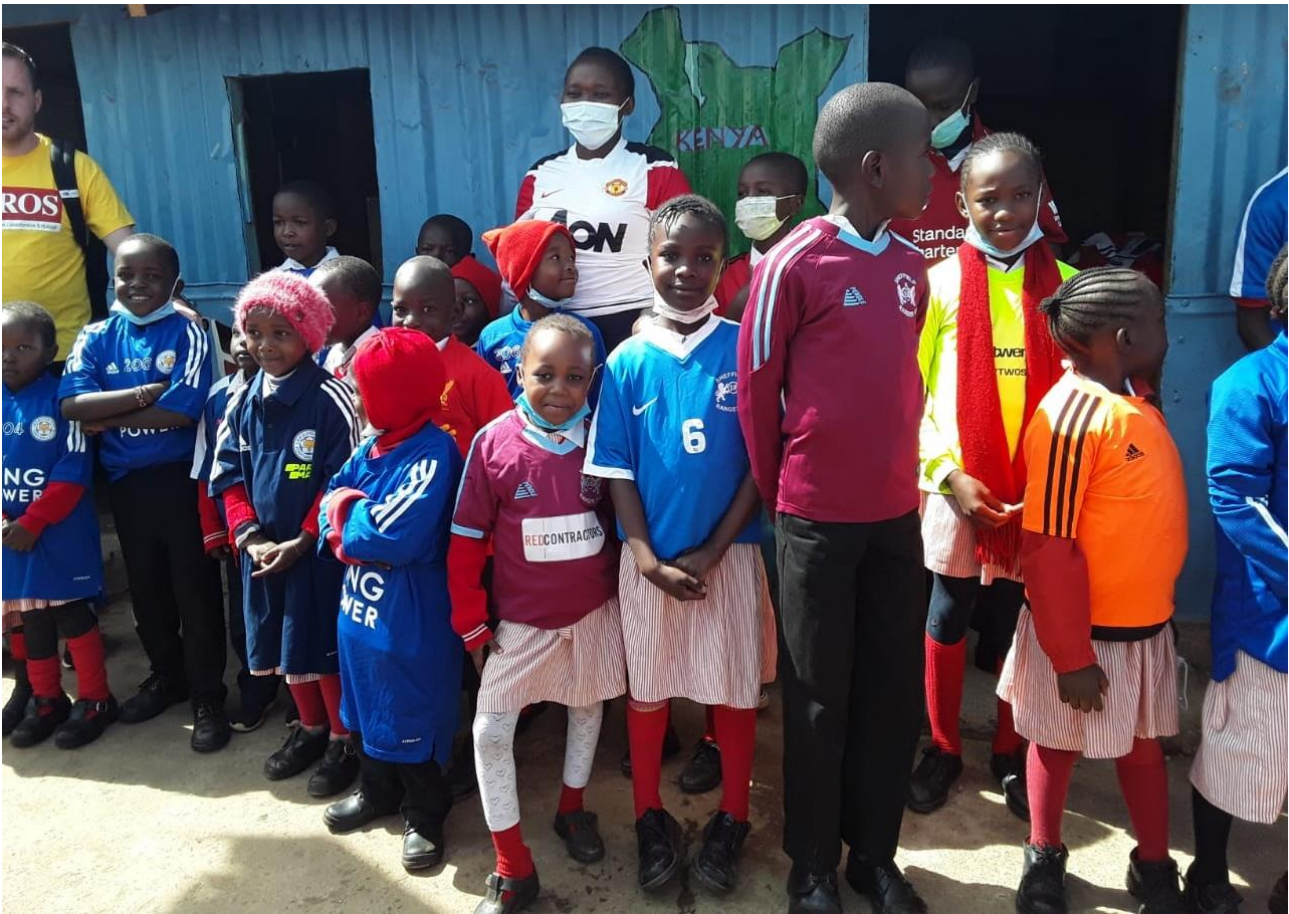
Figure 20: Pupils from Excel school wearing kit donated by Taking Football to Africa