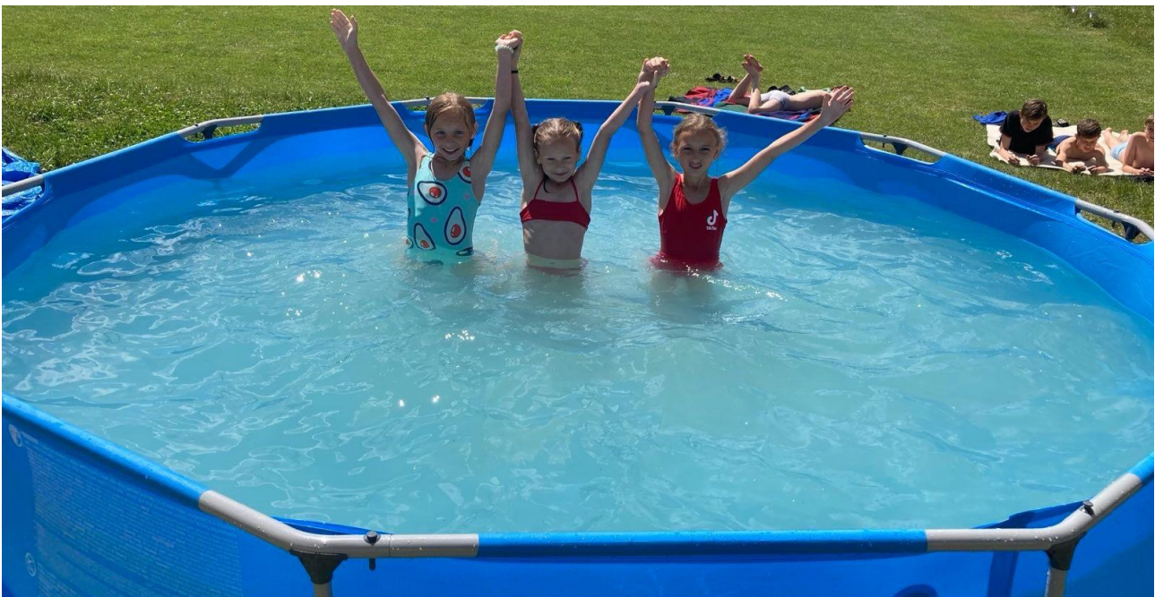
Figure 11: Swimming pool funded by PaR for Ternopil orphans

Porridge and Rice has a UK bank account with Barclays Bank and a Kenyan Bank account with Standard Chartered. The UK Barclays account number is 23708926, sort code 20-42-73, IBAN GB09 BARC 2042 7323 7089 26, SWIFTBIC BARCGB22, and address Barclays Bank Plc 210 High Street Hounslow Middlesex TW3 1DL. The Kenyan bank account is number 01-003340546-00 at Standard Chartered Bank Building, Kenyatta Avenue, Nairobi, Kenya, and swift code SCBLKENXXXX.