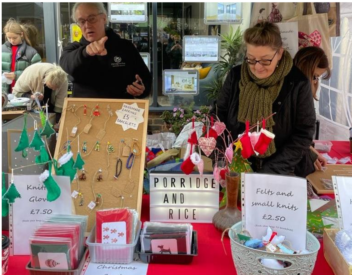
Figure 18: The PaR stand at Church Street Christmas Fair

Keeping administrative costs in the UK to a minimum remains a priority for Porridge and Rice. Costs in Kenya are incurred in Kenyan Shillings and currency conversion fluctuates. Trustees and members do not receive a salary from the charity, and cover their own expenses.