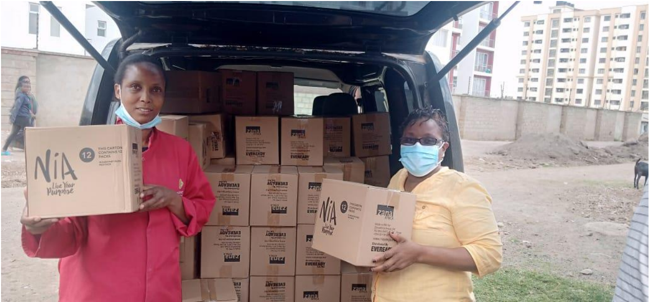
Figure 19: Sanitary Pads delivered to Lizpal school