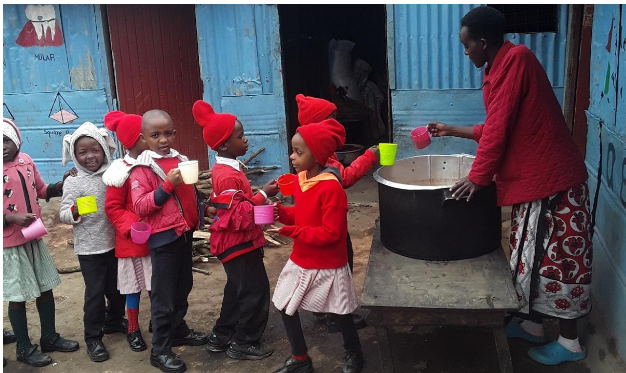
Figure 7: Breakfast Uji being served at Excel

The charity has consistently followed the scientific consensus and so it promoted vaccination to all school staff. There were individuals with medical conditions that made them concerned about whether it would affect them adversely, and the charity engaged Karen Surgery, a small local general practice, to see staff with concerns and queries. Most staff simply got vaccinated but a small number booked appointments at Karen Surgery with PaR paying the costs. One such person actually discovered that she had a condition of which she was unaware, and the charity paid for her treatment and medication. The goal of the charity was to remain sensitive and respectful of the concerns of school staff while upholding best practice as established by expert scientific consensus.