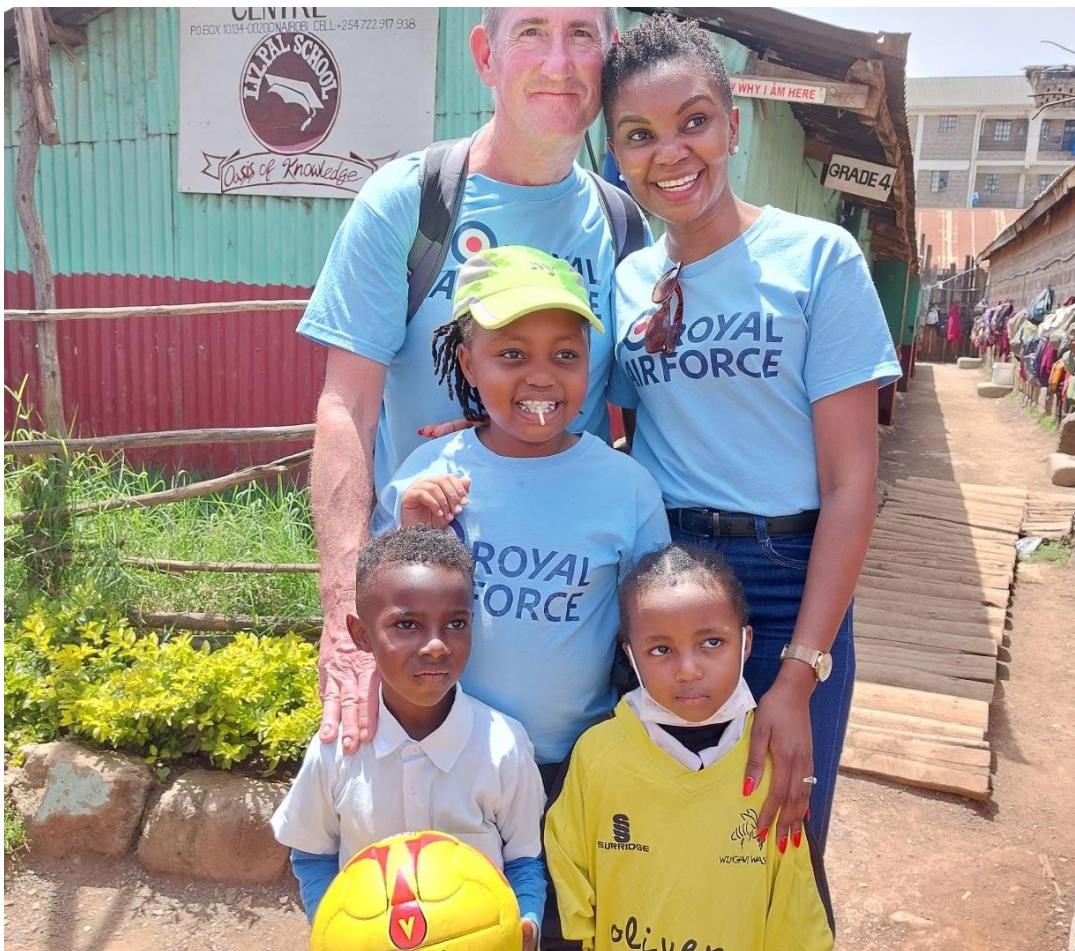
Figure 8: Football to Africa visit Lizpal School

Even when salary and rent support ends, the charity will not be able to return to pre-COVID19 levels of activity because it is still rebuilding its income. The return to pre-pandemic activity will be driven by charity income. While the charity will work as hard as possible to rebuild its income, it is not known how long this will take, so it is expected that programmes will be implemented cautiously in increments as sustainable income is rebuilt. This will take time and patience. For the time being, the charity will continue to support breakfast in all schools and sanitary pads for girls.