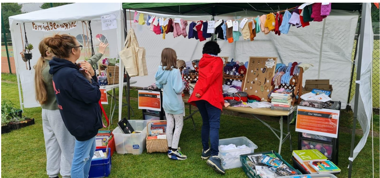
Figure 6: Thistleworth Tennis Club Fair

The charity will watch what fairs will be open around Christmas. Based on prior success, it is likely that the charity will attend the Church Street Christmas Fairs - usually there are at least two – and no others. Hopefully footfall will be better than last year, and consumer confidence will return. It is not easy to predict what will happen but current events suggest that this may not be the case. The charity will still attend if this becomes clear because it needs the income and the events have proven to be excellent events for growing awareness of the charity and the work it does.