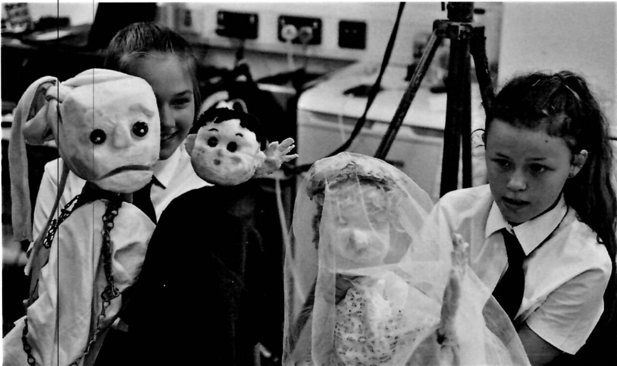
Children at the Baird summer holiday scheme with their puppets from Great Expectations and A Christmas Carol. Characters : Jacob Marley, Young Pip and Miss Havisham left to right.