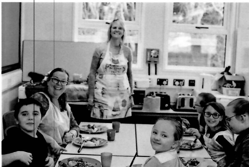
Digging deep at lunchtime during Easter holiday scheme "THE DEEP"

Generally we continue to aspire to provide a service for people of all ages and ability using puppetry as a tool for expression and healing. The ethos is to disseminate enjoyment for the wider general public through artistic practice in tune with contemporary thinking. The Covid crisis dictated new ways of working which we were able to conform to with ME AND MY SHADOW and RED CARPET IN LOCKDOWN.