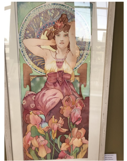
art class painting