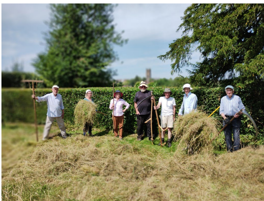
A group of scything and raking volunteers at St Giles, Ludford 2024

We have more swift boxes going up in our churches (thanks to the Opening the Ark project), more dormouse boxes have gone up in Bromfield where signs of dormice have been found by the Dormouse Group including particularly large animals and litters of young. This indicates that the Hazel Dormouse cannot just survive but thrive in a churchyard which has a river on two sides and busy road on the other. We have a new volunteer making habitat boxes for us, he has made around 25 tit and open fronted bird boxes to be put up in our sites.