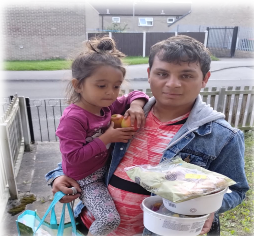
Food distribution to local beneficiaries.