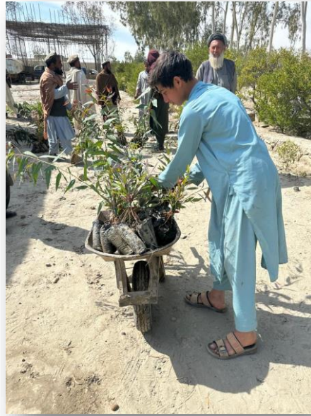
Village member takes home trees in a wheelbarrow