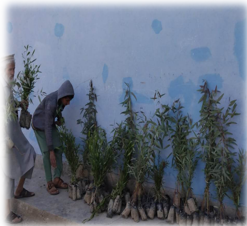
Plants distribution to villages.