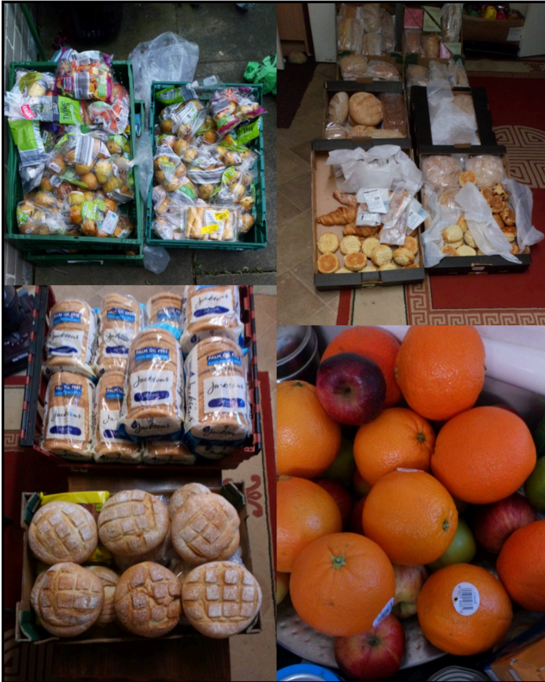
A variety selection of breads received from local shops, fresh fruits and vegetables to be distributed among the qualified beneficiaries in Leeds city.