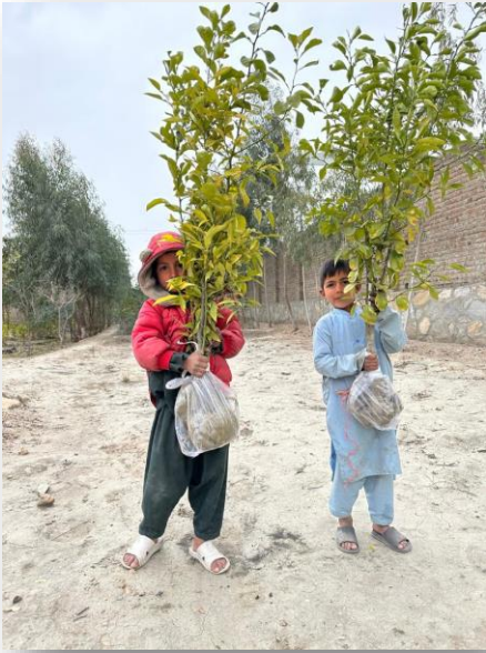
Distribution of trees for villages to plant at home