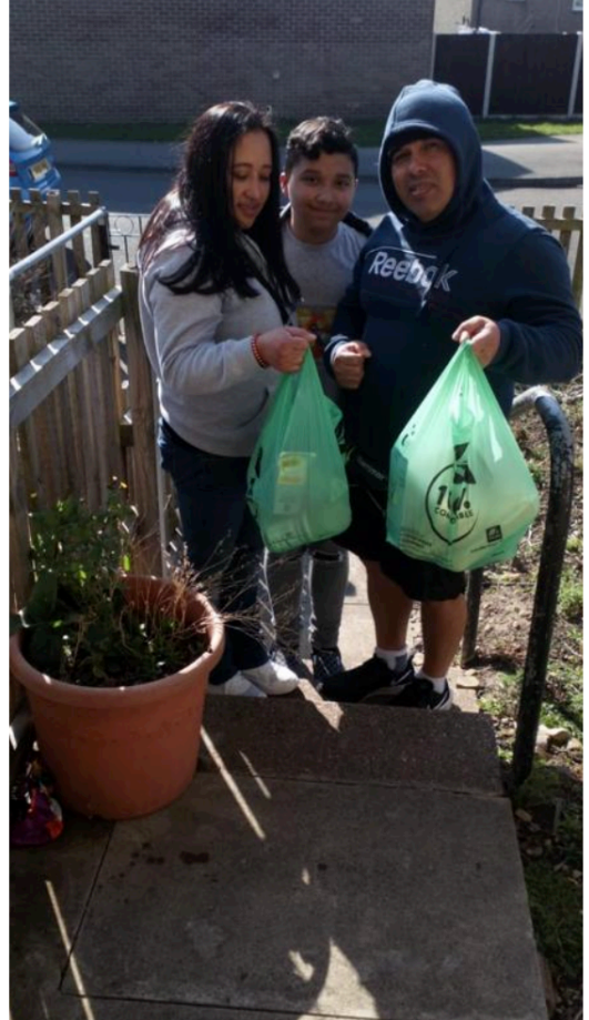
Local beneficiaries receiving a variety of food items on a weekly basis.