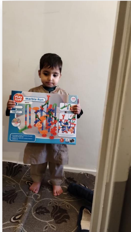
Child holding gift toy during holiday season