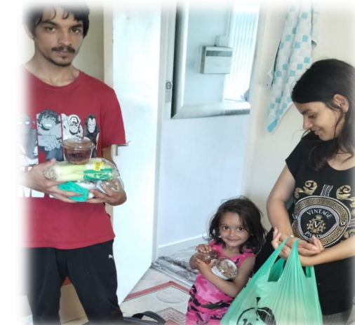
Food distribution to families.