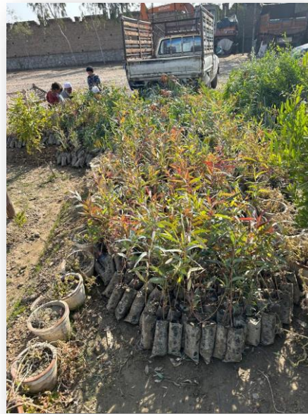
Nursery plants ready to be distributed