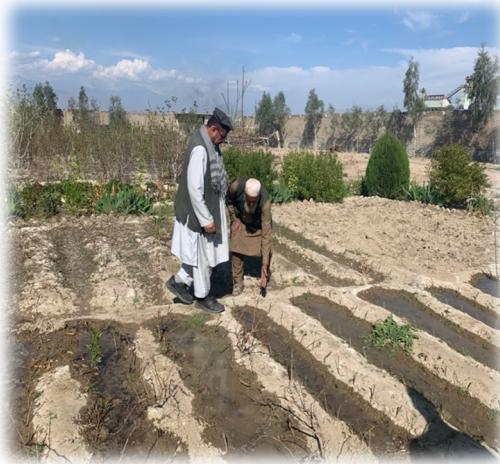
Seed plantation and watering.