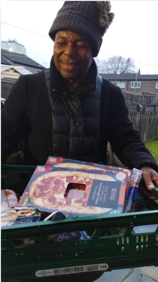
Food distribution in Leeds