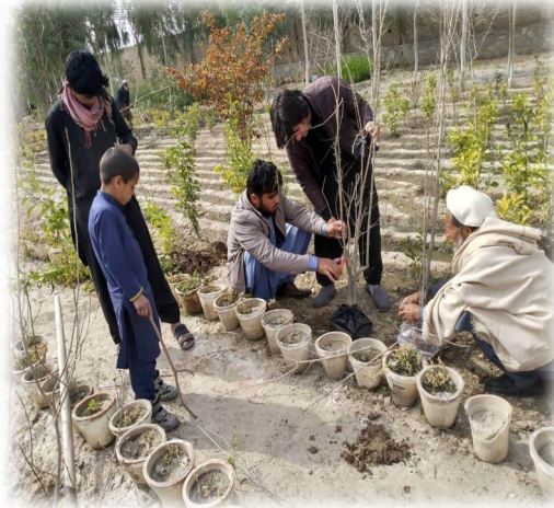
Fruit trees plantation and maintenance.