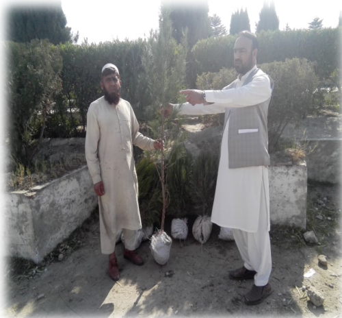
Plants distribution to local communities.