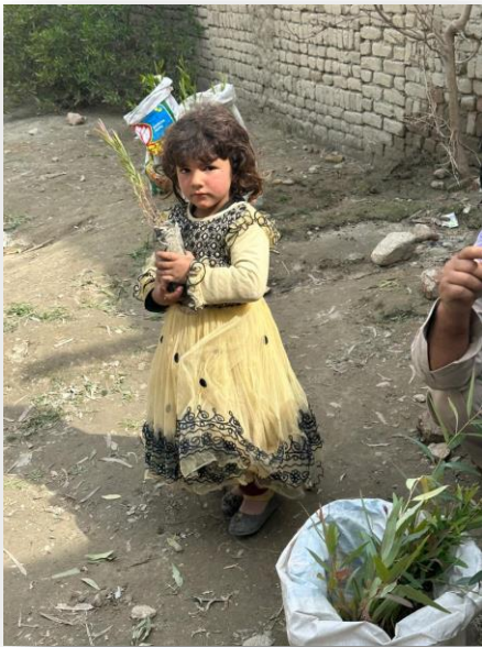
Beneficiary child holding plant