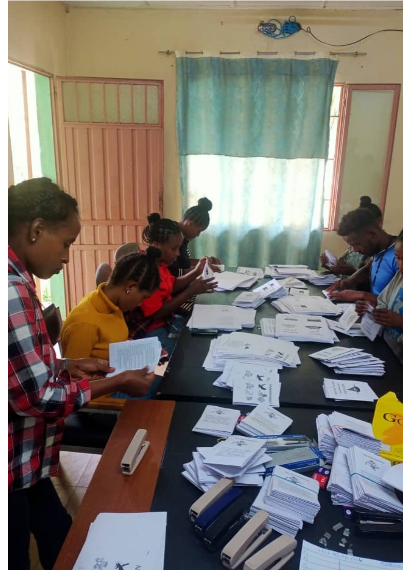
Deaf Students Making Books