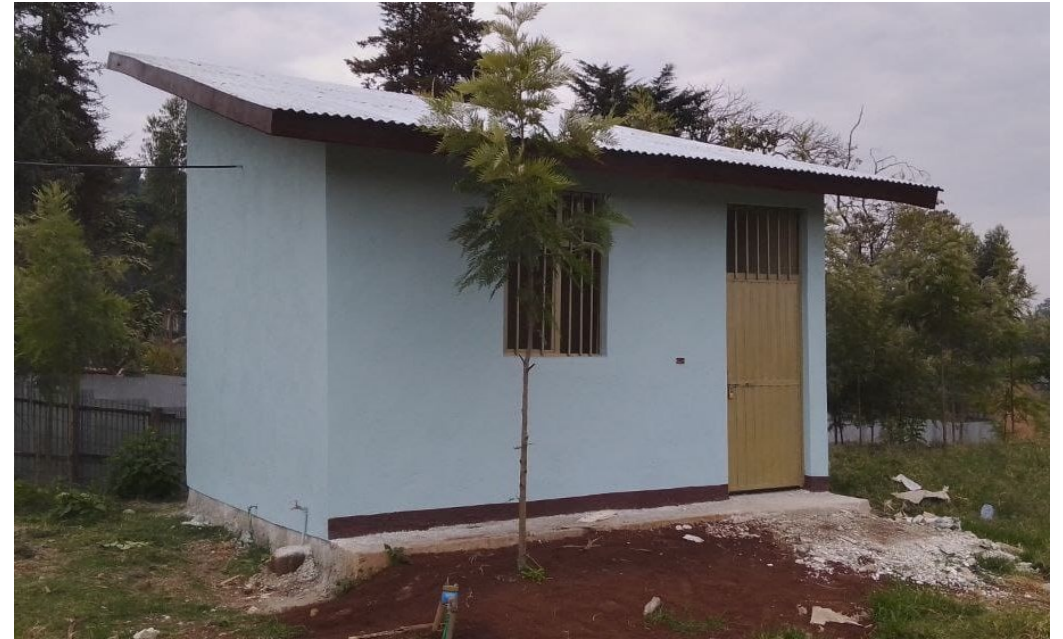
Lela Nekemte Sanitary Facilities