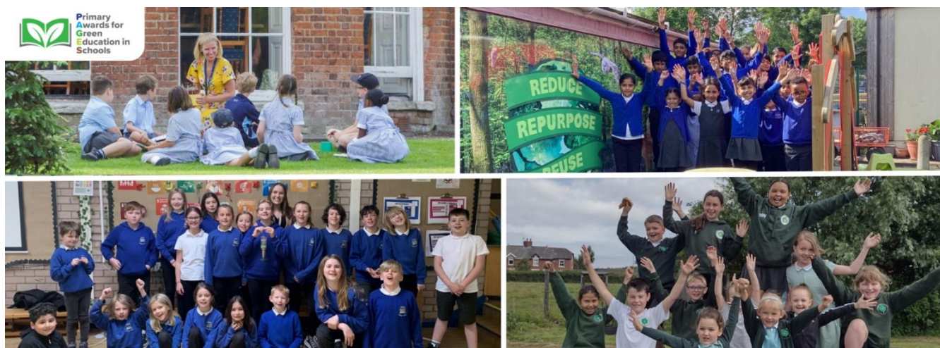
Above: the Champions of the Primary Awards for Green Education in Schools 2024. Clockwise from top left, The King's School, Gloucester; Tudor Primary School, Southall; Pilling St John's CE Primary School, Lancs; Dairsie Primary School, Fife.

TRUSTEES' REPORT FOR THE PERIOD ENDED 31 MARCH 2025