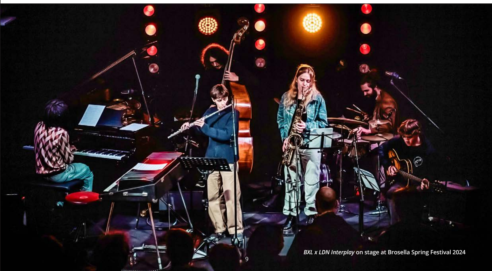
BXL x LDN Interplay on stage at Brosella Spring Festival 2024