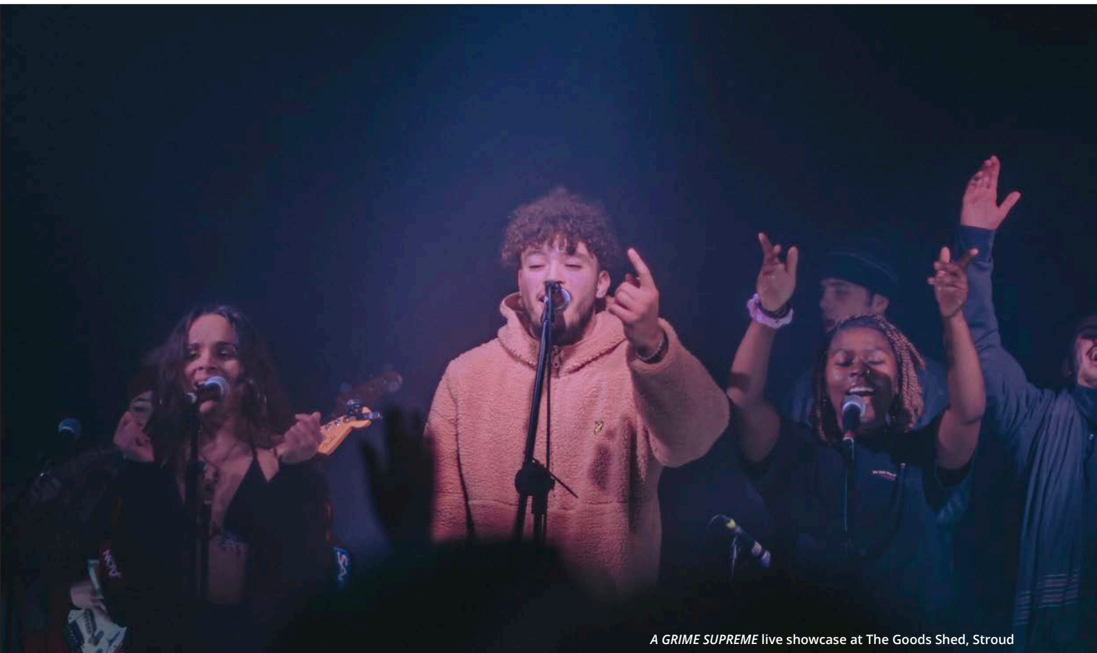
A GRIME SUPREME live showcase at The Goods Shed, Stroud