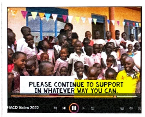
July 2022 awareness campaign included a video and children's activity sheets, as well as trustee talks, display board, fliers, follow-up emails, Facebook activity.

In the second half of 2023, following the trustee's visit to Uganda, FIACD plans to launch another campaign to continue building awareness, attract new supporters, and also fundraise to help maintain and grow the projects. The charity will also re-focus on building relationships with local (UK) schools.