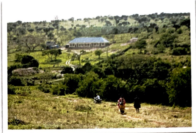
Isaiah Nursery & Primary School.

school kitchen and a water tank. Phase 2 added a caretaker's hut, school gates, and solar panels for the school and teachers' accommodation. Phase 3 was completed in April 2021, and included an additional classroom block with three new classrooms (to enable growth up to Primary 7), additional nursery and school toilets, and four teachers' accommodation rooms.