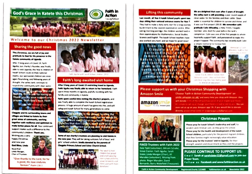
Christmas 2022 supporters' newsletter