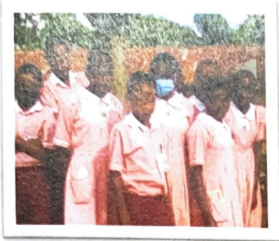
Primary 6 pupils before their National examinations. Observe from their sizes how long they have had to wait to receive an education.

Due to nearly two years of missed learning (through the national Covid-19 lockdowns, and then the subsequent Ebola-related restrictions during the fourth quarter of 2022), and following pupil performance reports, the majority of pupils are repeating their educational year. In December 2022, all Primary 6 Isaiah School pupils sat their national entrance examinations for Primary 7 in Mathematics, Social Studies, Science and English.