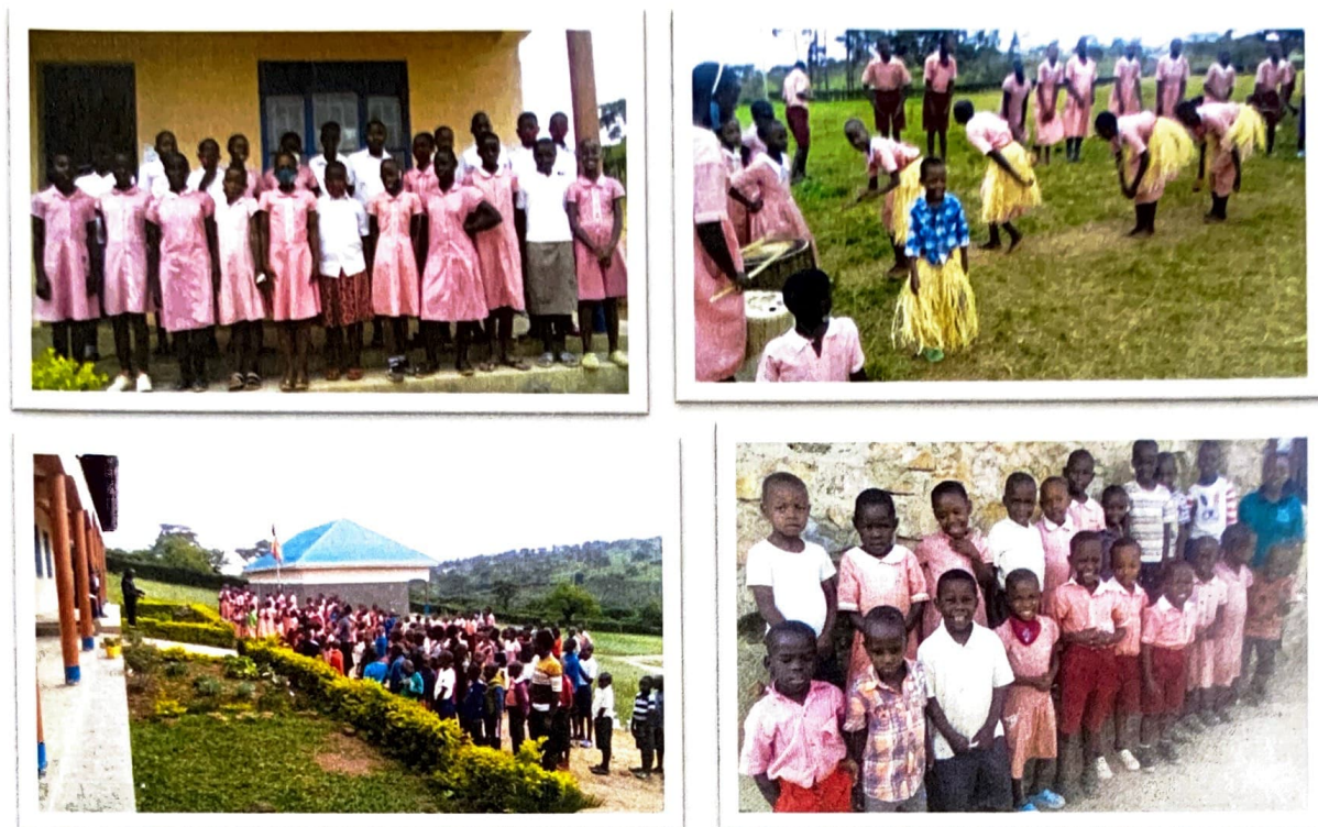
Above left: Older pupils standing outside their classroom, February 2022. Above right: Isaiah School end of term celebrations, April 2022. Bottom left: Isaiah pupils and staff outside the front of the school, September 2022. Bottom right: Younger pupils standing outside their classroom, April 2022.