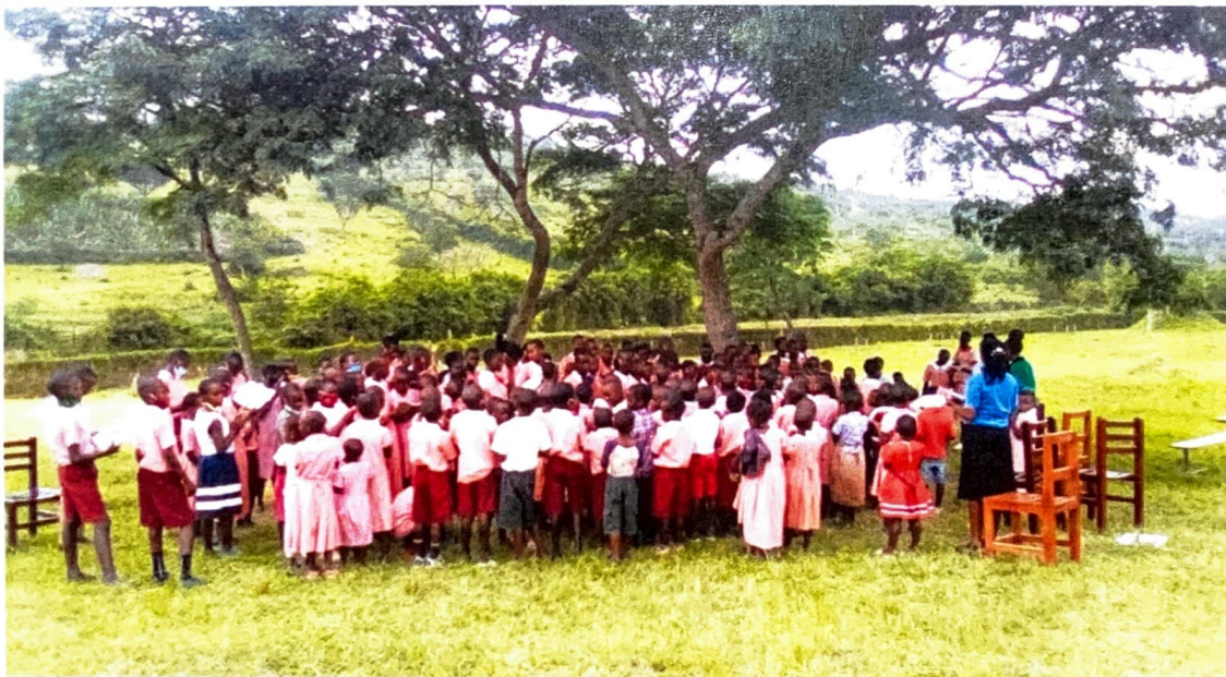
The Isaiah School children returned to school in January 2022, following lengthy nationwide Covid-19 lockdowns.