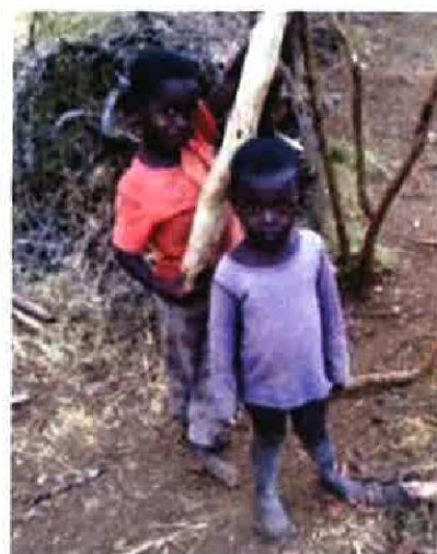
Isaiah children collecting firewood