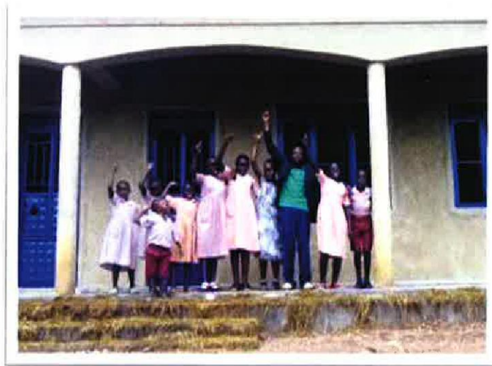
Local pupils waiting for Uganda's nationwide lockdown to lift

This year, FIACD attracted some new monthly donors, as well as four larger one-off donations (one of which enabled Phase 3 of the school building) and annual support from a company. In October 2019, FIACD organised two creative assemblies with the children of Claygate Primary School (a local UK school). Fliers were given to every home with the aim of attracting younger supporters and donors. A fundraising team was established and this team made plans for sponsored fundraising events in June and a supporters' 'Thank you' event later in the year. Unfortunately, these events together with plans for local UK partnerships have had to be postponed due to the Covid-19 restrictions.