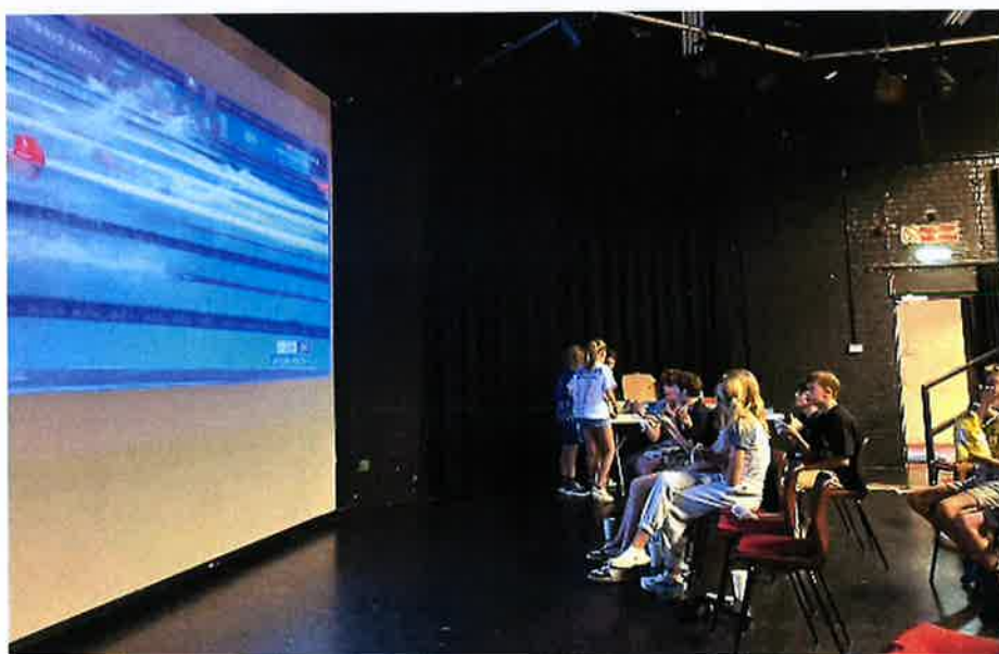
Our Olympic party organised by the coaching team