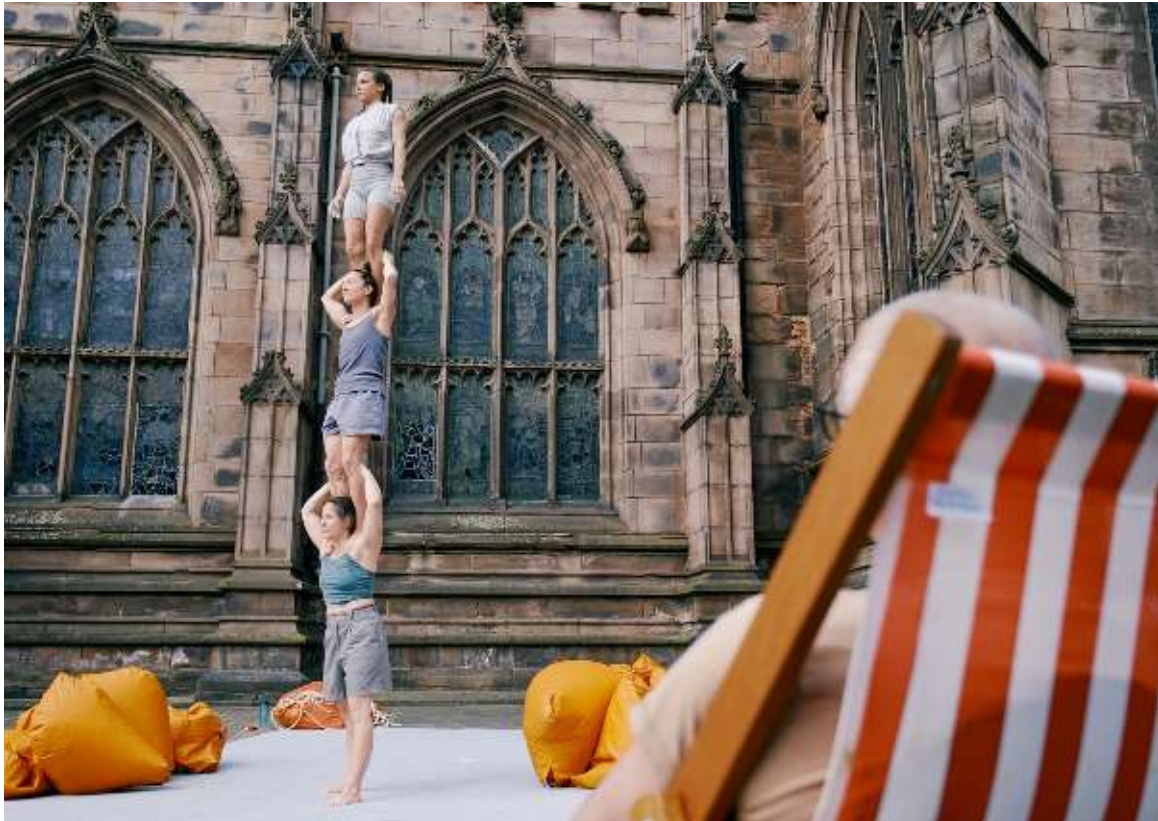
Weight(less) in Rotherham