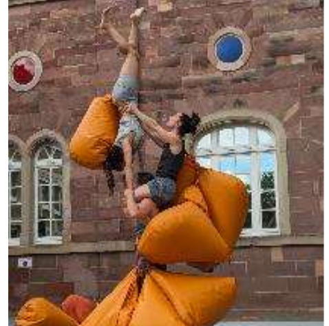
Mimbre in Malory Towers, Mimbre Youth Programme by HeardinLondon and Weight(less) on tour