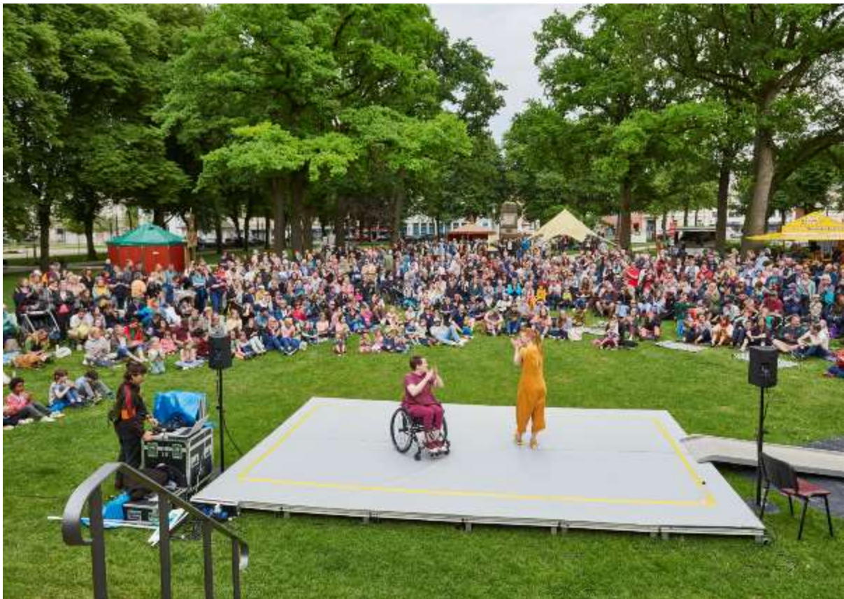
Look Mum, No Hands! in Germany, photograph by Dirk Schelpmeier

In total we were seen by audiences of nearly 18,000.