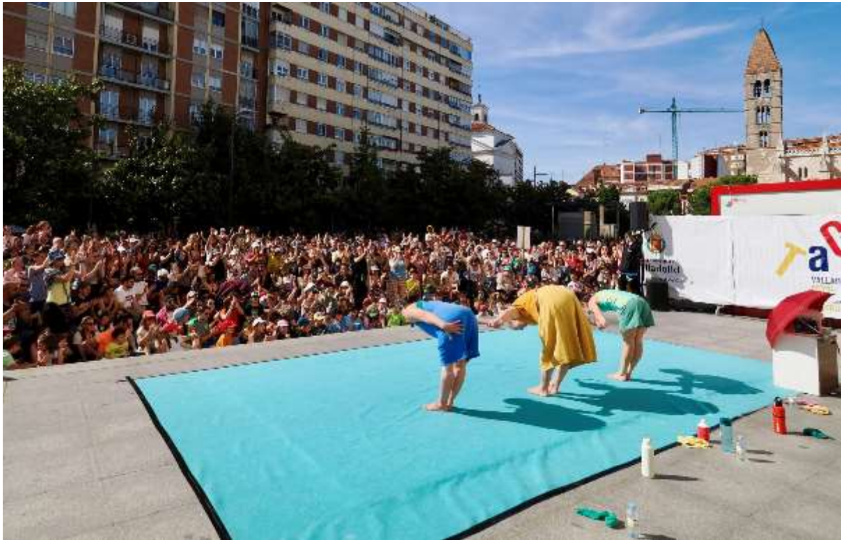
Lifted at Festival TAC Valladolid by Photogenic