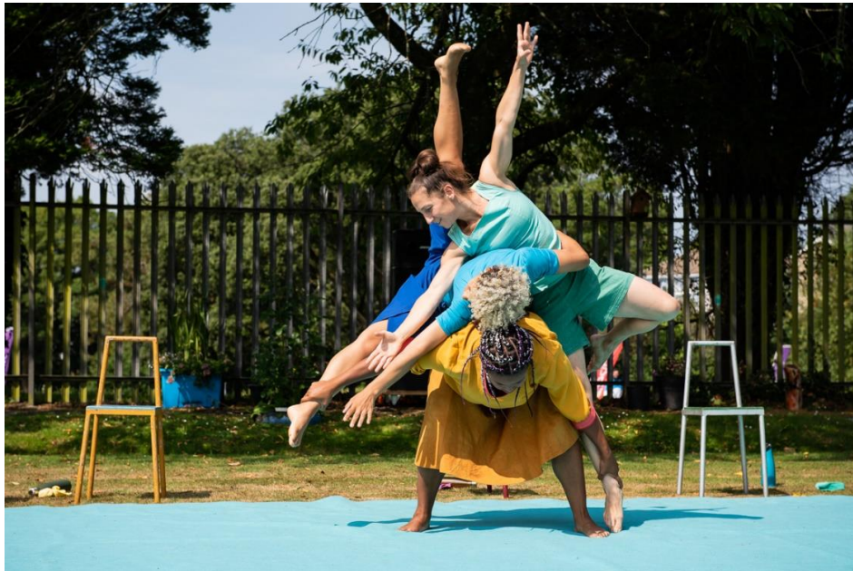
Lifted at Swansea.

Silvia Fratelli on touring Lifted in 2021