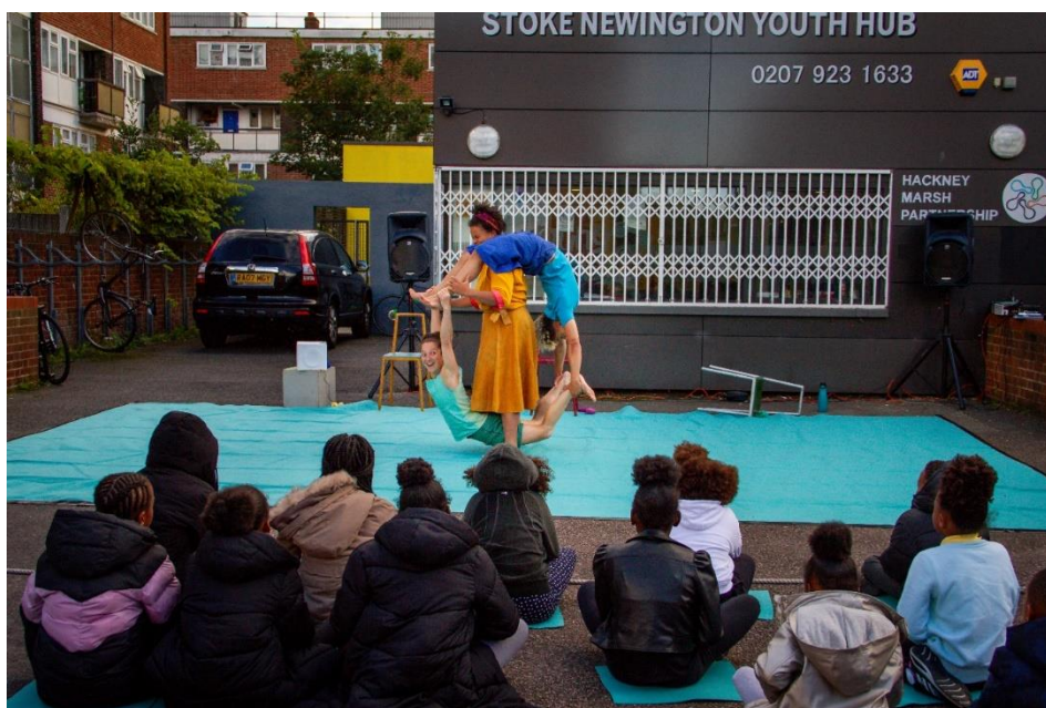
Lifted at Mimbire Youth

Mimbire Youth Programme continued at our replacement hall, St Matthias, for the autumn 2021 and spring 2022 terms. We finally returned to Milton Gardens Community Hall for our community day at the end of March 2022.