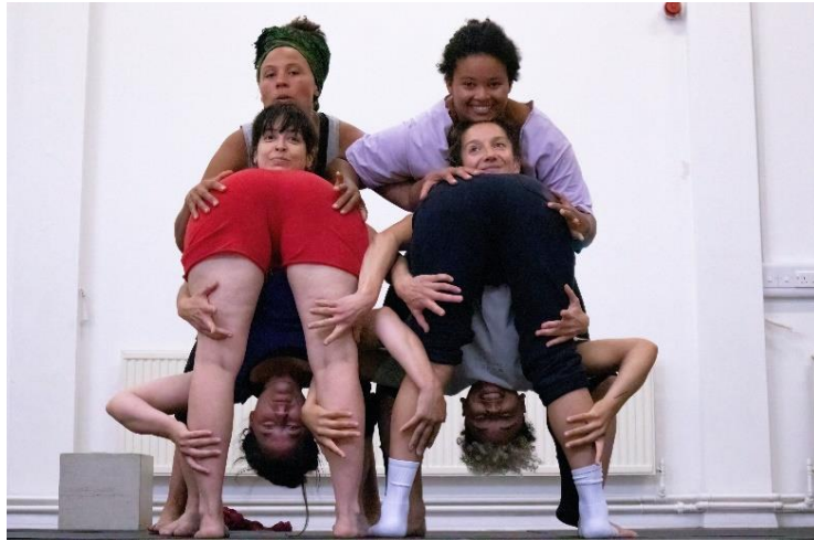
The full Lifted performer and understudy team.

Looking forward, Lifted toured again successfully the following year including visiting Arkansas, Texas and Florida in October 2022.