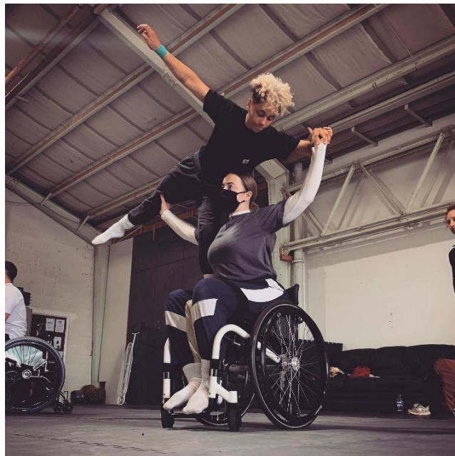
The Inclusive Acrobalance Residency