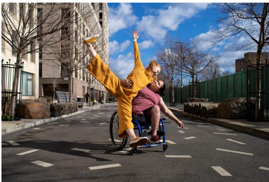
Look Mum, No Hands! publicity image.