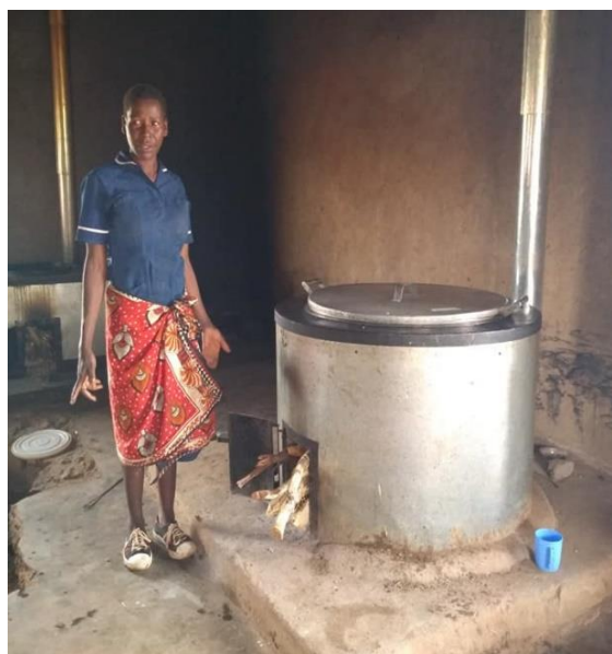
Figure 9: Pascalia with the new stove