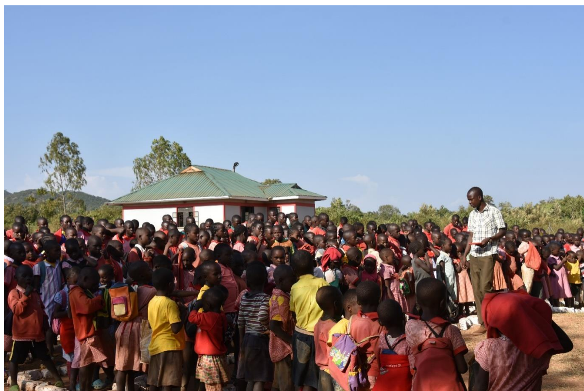
Figure 1: 'Uzima Children Orphan Centre' in the Samia district of Western Kenya

Uzima In Our Hands has decided to align its financial year with Uzima Children Orphan Centre, which runs per calendar year. For that reason, the 2019/2020 financial year runs from 1 August 2019 – 31 December 2020.