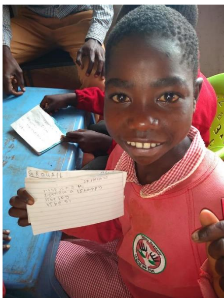
Figure 12: Special Needs Classes

The grievance policy, which was implemented last year, has now been signed by all staff, and the Roles and Responsibility document has clearly improved the organisation at the school.