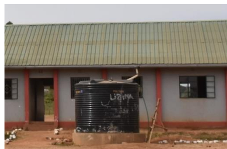
Figure 23: The existing water-harvesting tank

On top of the donations received from our supporters, Uzima In Our Hands received a grant from the Kitchen Table Trust (£6,000) which is used for the water-harvesting project, which entails the installation of new pump + 3 water-harvesting tanks. We will need to find an additional £3,000 to complete the project.