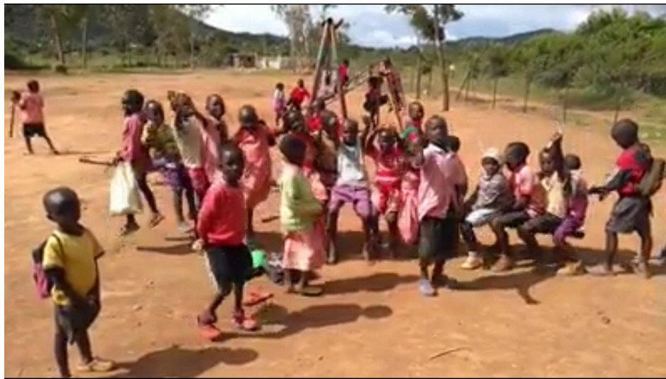
Figure 21: The seesaw is in good use...

The much-used play equipment (see photo) at the centre needed repair. Uzima In Our Hands has sent money to repair them, which has happened in the meanwhile.