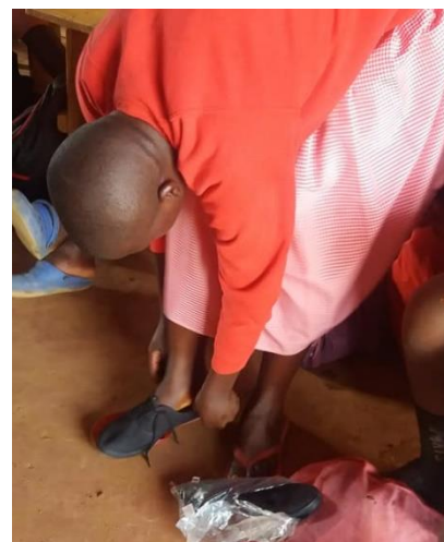
Figure 19: New Shoes!