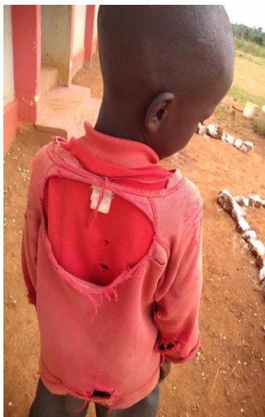
Figure 17: Replacement required...