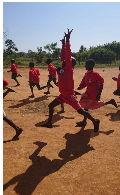
Figure 2: School is out

6 September 2019 18 October 2019 26 November 2019 16 January 2020 20 March 2020 17 April 2020 5 June 2020 17 July 2020 18 September 2020 30 September 2020 9 October 2020 6 November 2020 11 December 2020