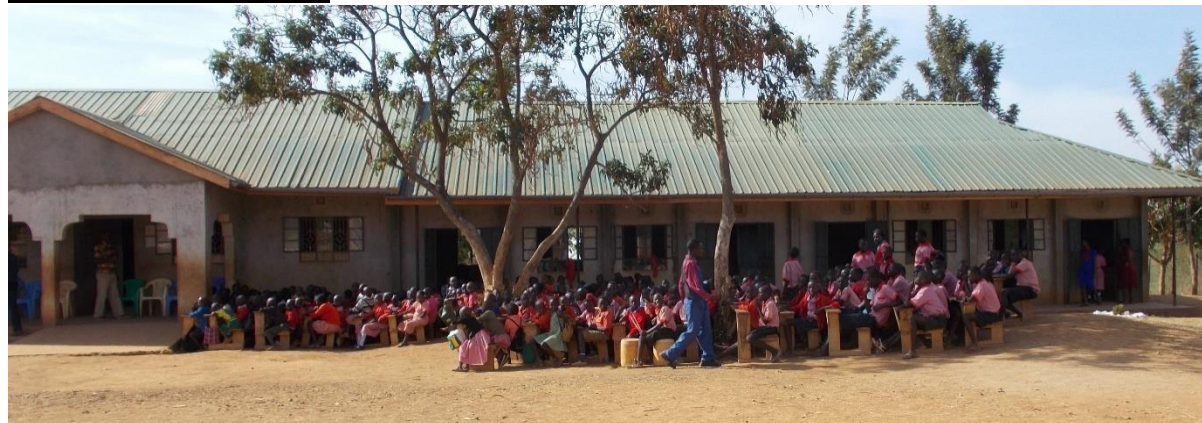
Figure 7: Desk sharing in practice

When the schools are re-opening, Uzima Children Orphan Centre will need to abide by a number of rules. In November, 100 pupils were back in school. The idea was to erect big gazebos on concrete platforms, to have more space and eventually get everybody back. However, this was not allowed, so we have to wait till the schools are opening officially with pre pandemic legislation before all the children can come back. The school will need more desks, as children currently share desks.