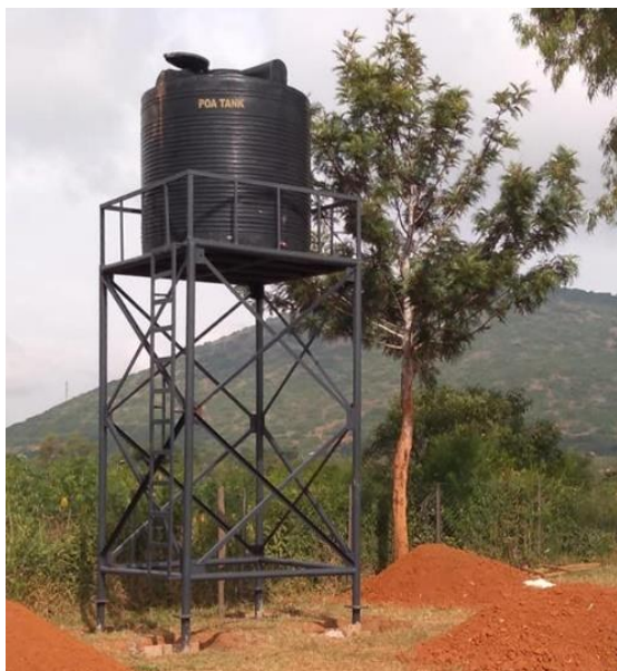
Figure 10: The new water tower

The water tower, the kitchen and the toilets, which we wrote about in our previous annual report, have been installed, thanks to generous donations of our supporters and hard work of the team in Kenya: