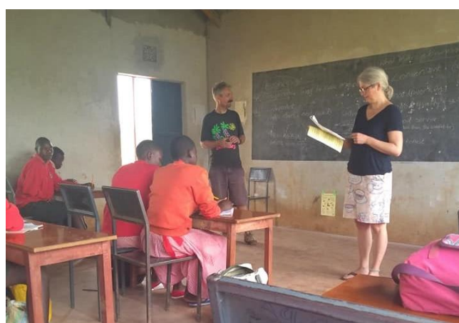
Figure 13: Business Training

Linked to this, Uzima Children Orphan Centre is planning to make contact with 5 Talents ( www.fivetalents.org.uk ), which is a simple way people can join together in developing countries and borrow a small amount of capital to set up their own business.