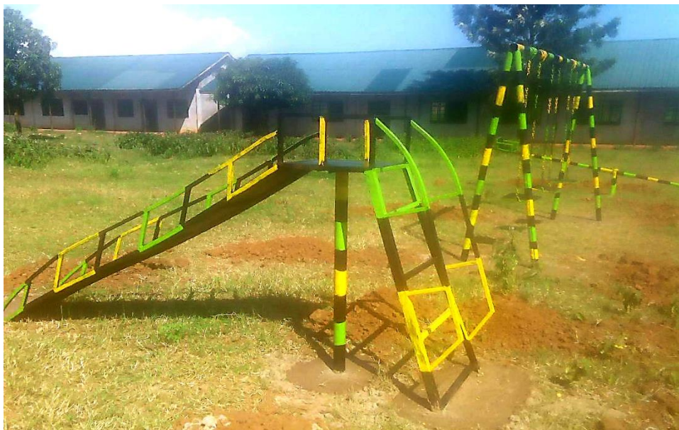
Figure 20: New play equipment