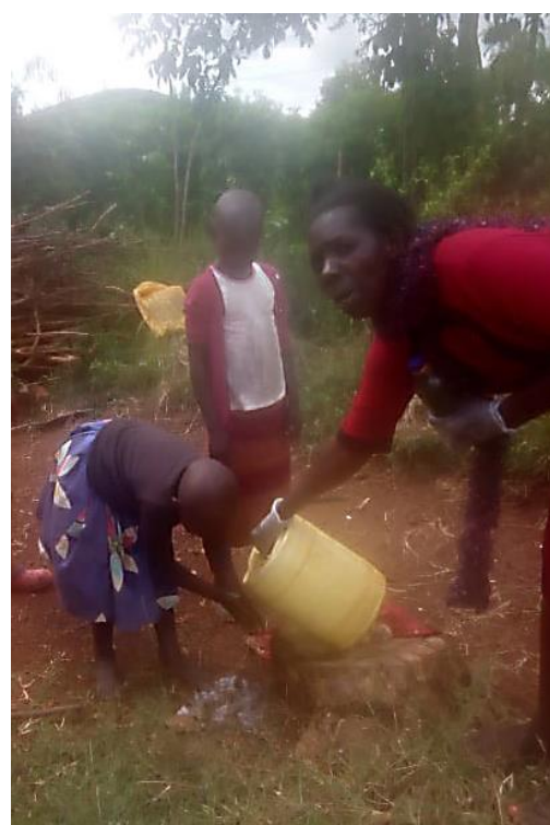
Figure 6: Newly delivered soap put to good use

Evans cannot distribute food as often as needed: each round of visits costs about KSh 170,000 ( \approx £1,300). The current quarterly food budget of KSh 495,000 allows for one round per month. Given that the team not only feeds the children, but also their families, we think at least two rounds per month would be required.