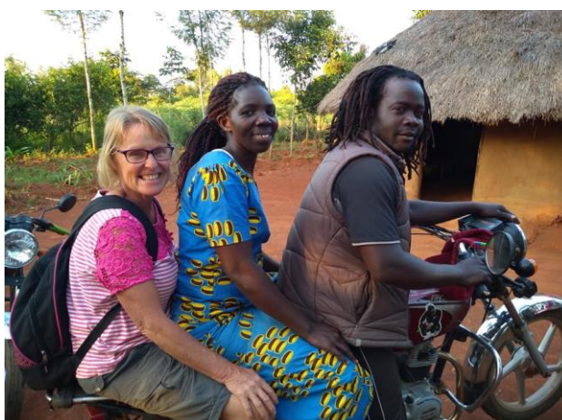
Figure 16: Local transport