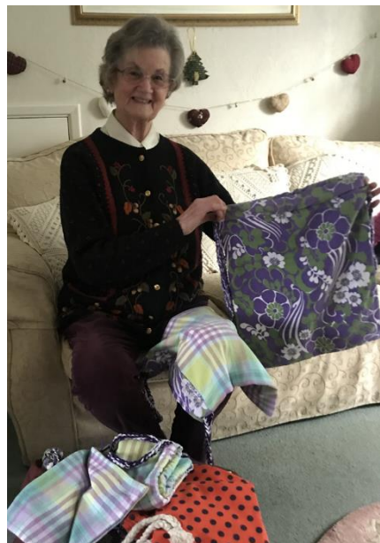
Figure 18: The Christmas elves have been busy: 340 drawstring bags...

All the children also received a drawstring bag with little goodies in it.