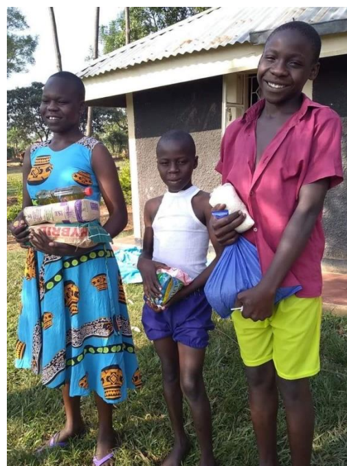
Figure 5: Happy faces when food is delivered

As you can imagine, these rules, necessary as they are, have a real impact on Uzima Children Orphan Centre. As the centre is closed, the 340 children won't get their daily meals either.