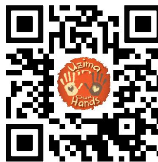
Figure 24: Website: www.uzimainourhands.org

12, Sunset Close, Freshwater, Isle of Wight, Postcode: PO40 9JR