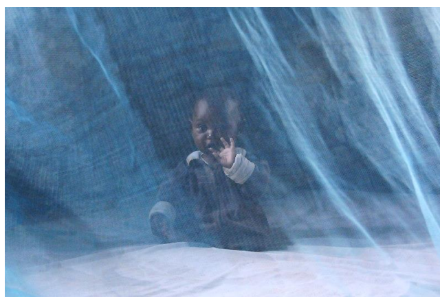
Figure 8: Photo credit: USAID/Wendy Stone

There has been lots of rain and following that quite a few cases of malaria. Nearly 40 children from Uzima Children Orphan Centre have had the disease and have been treated at Buburi clinic. Some had it relatively mildly, and were given a cheap treatment, but 12 or 13 had to be hospitalised and were treated with artesunate, which is expensive.