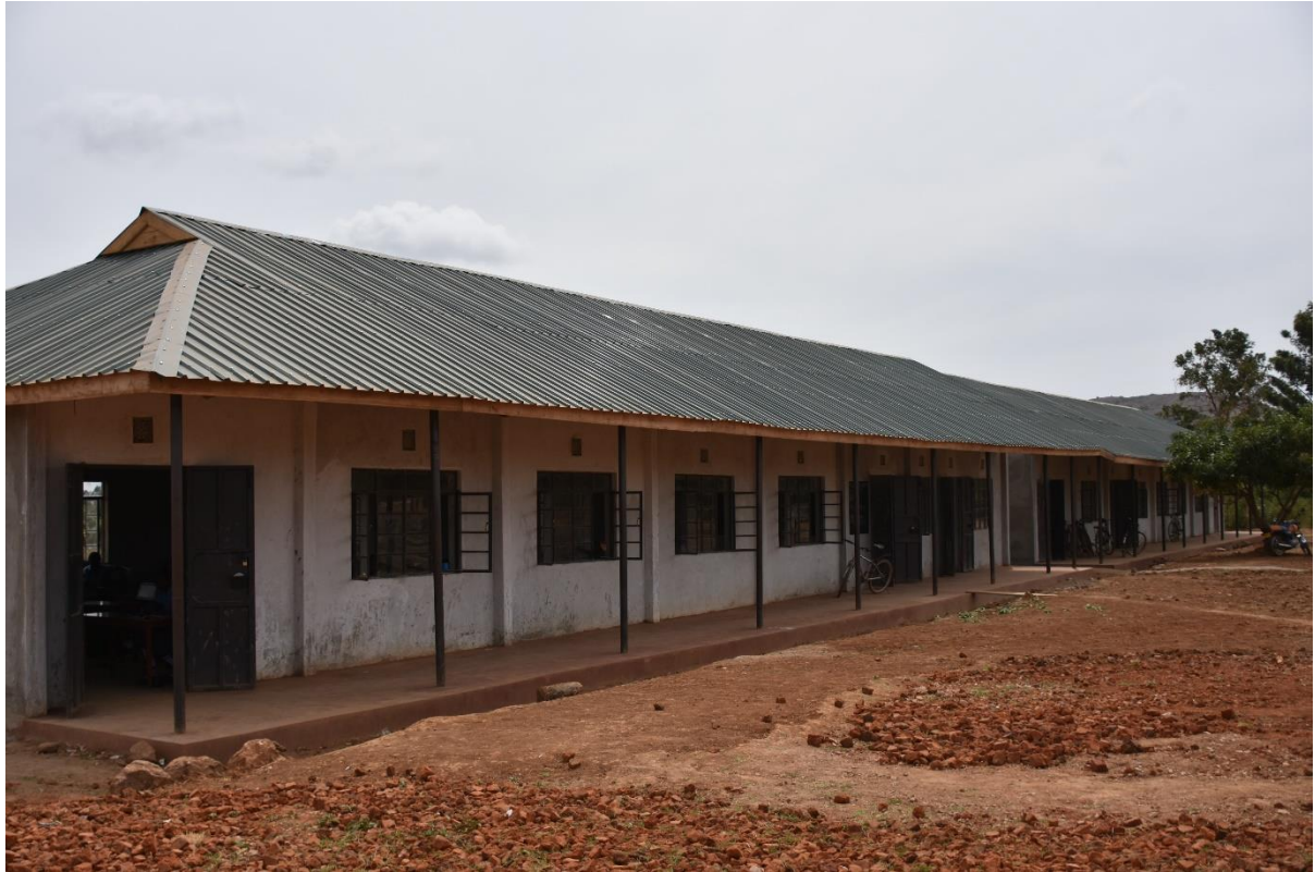
Figure 14: Vocational Classrooms

The Vocational Classrooms are now being used under new Kenyan Government regulations to accommodate the school itself. When the new regulations came in, schools weren't allowed to have partitions in classrooms. This means the whole school is now spread between the two buildings (original school & vocational classroom block) and because we had this space, it was allowed to stay open. So, although this was not the intentional use of the block, it saved the school!