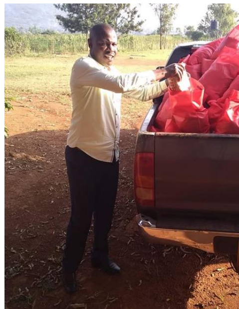
Figure :4 One of the local board members is a taxi driver, and he is delivering the food around the community by truck

In 2014, Kenya had 0.2 medical doctors (including generalist physicians and specialist medical practitioners) per 1000 people, compared to 2.81 medical doctors per 1000 people in the UK. Kenya had only half the hospital beds with 1.4 beds per 1000 people in Kenya compared to the 2.93 beds per 1000 people in the UK (data from 2010, source covid19kenya.org). So, you can expect that the consequence of being exposed to the Covid virus is more dangerous in Kenya than in the UK.