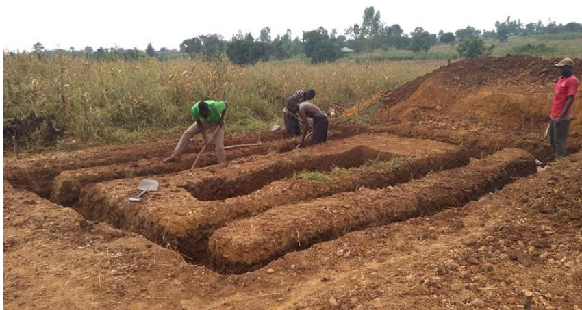
Figure 11: Toilets being constructed