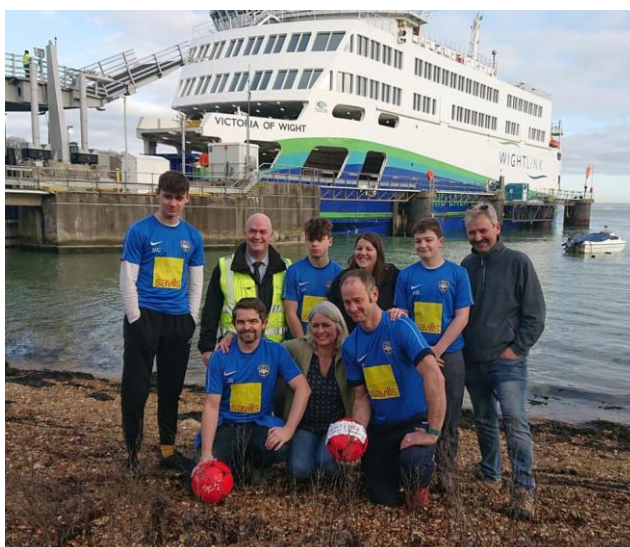
Figure 15: We're on our way! With special thanks to Wightlink, Isle of Wight Ferries, Savills and The Priory School

These visits are not a holiday. Each visitor is allocated activities to support the work of the Centre. Also, these visits are physically demanding: most visitors suffered some health issues while in Kenya, with one supporter falling terribly ill with amoebic dysentery. She was treated very well at Buburi Clinic and recovered soon.