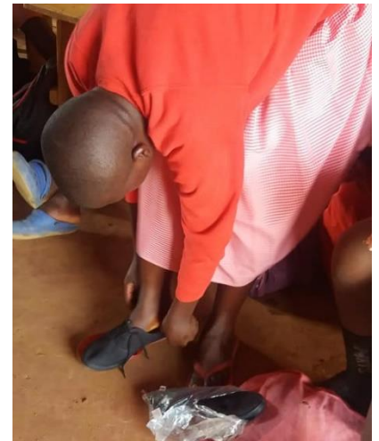
Figure 19: New Shoes!