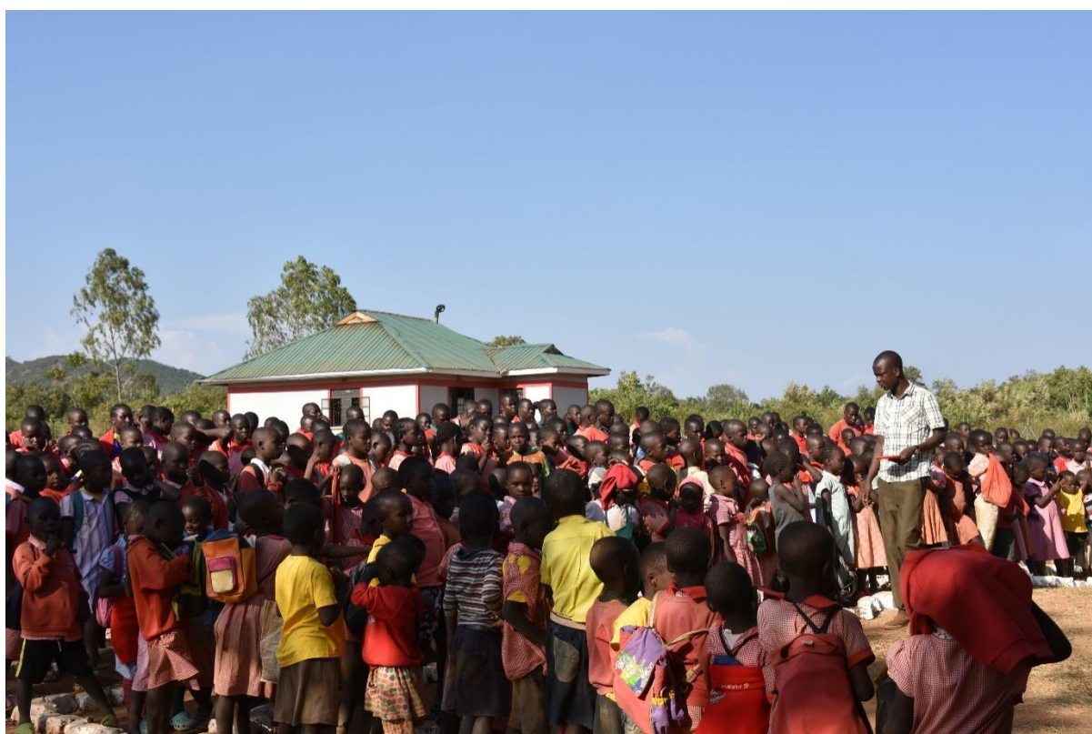
Figure 1: 'Uzima Children Orphan Centre' in the Samia district of Western Kenya

Uzima In Our Hands has decided to align its financial year with Uzima Children Orphan Centre, which runs per calendar year. For that reason, the 2019/2020 financial year runs from 1 August 2019 – 31 December 2020.