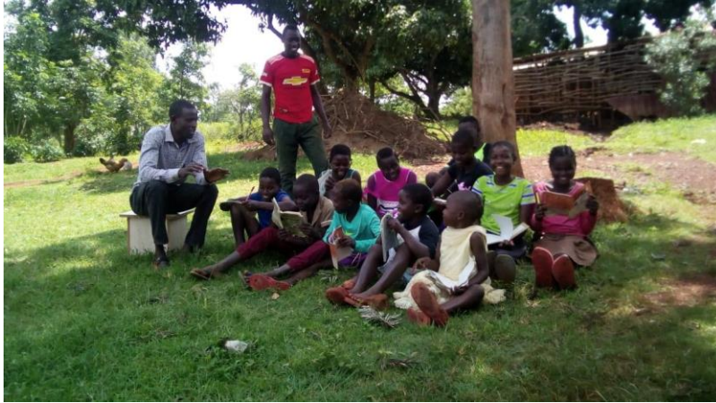
Above photo - learning in the Pandemic