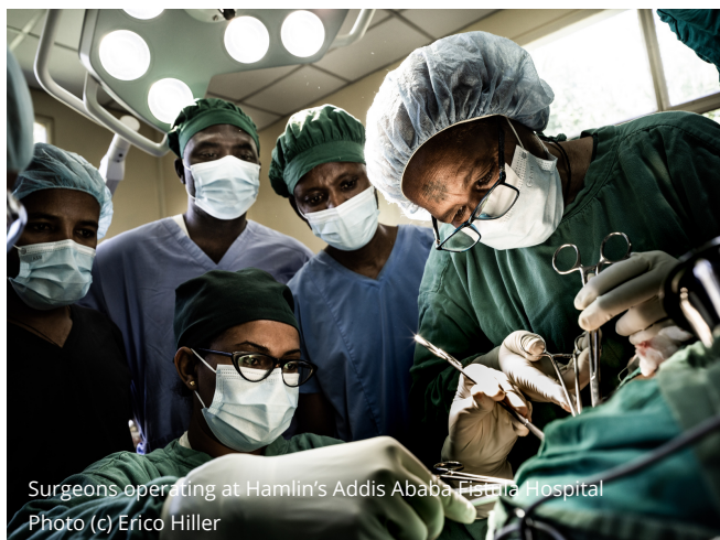
Surgeons operating at Hamlin's Addis Ababa Fistula Hospital

Obstetric fistula and Advanced Pelvic Organ Prolapse can both mostly be repaired with a single life-changing fistula surgery. For some, this can take no more than two and a half hours. Over the past year, surgical teams at our six hospitals across Ethiopia have delivered 4,309 restorative operations for women with childbirth injuries. This included surgery for obstetric fistula (1,055), advanced pelvic organ prolapse (2,730), other gynaecological conditions (431) and caesarean sections for past fistula patients having new babies (93).