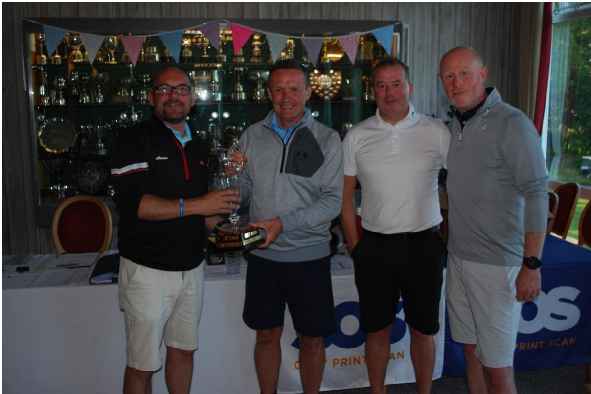
The winning team at the 2024 Sport Newcastle Golf Day, the Unite Group, pictured with the George Bayley Trophy.