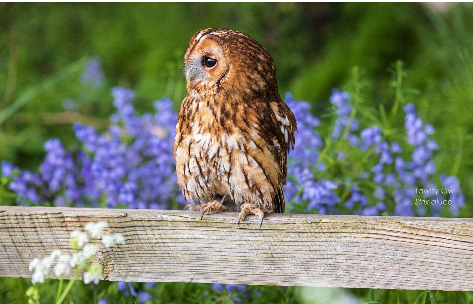
Tawny Owl Strix aluco

Acquiring staffing funding for employees to work in the field monitoring cavity nesting species, in addition to employees delivering community education with regard to birds of prey and nature-based learning will enable the Project to be extensively more far reaching in its objectives for wildlife and education.