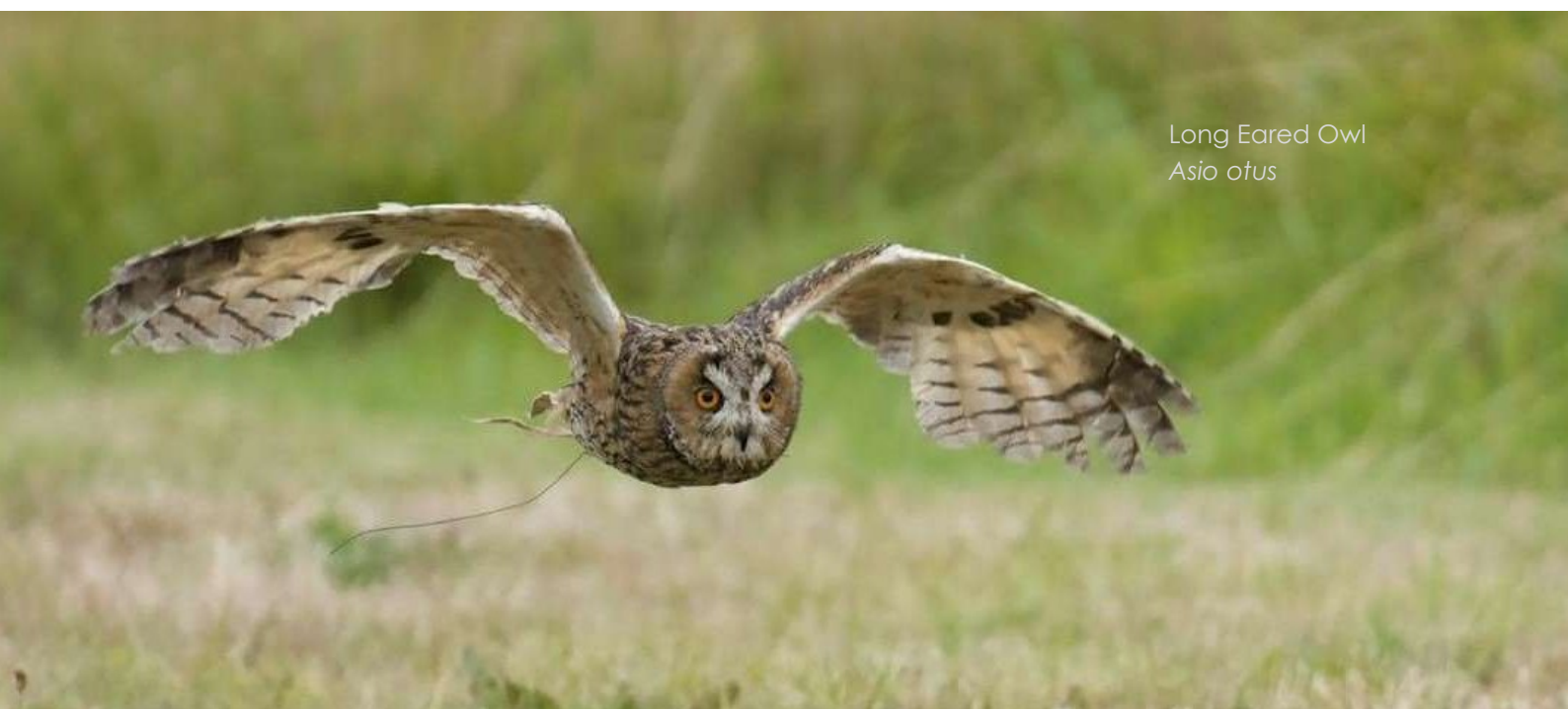
Long Eared Owl Asio otus

As a result of many of the new and improved training methods that our team had built up over the last few years, we were thrilled to see some of our resident birds complete their training objectives and join flying teams, including Ghost the Barn Owl, who joined our Owl Encounter flying team and did a great job inspiring guests about this beautiful species in the wild.