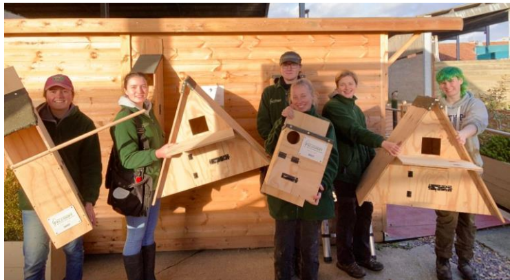
Above: Nest boxes prepared for installation