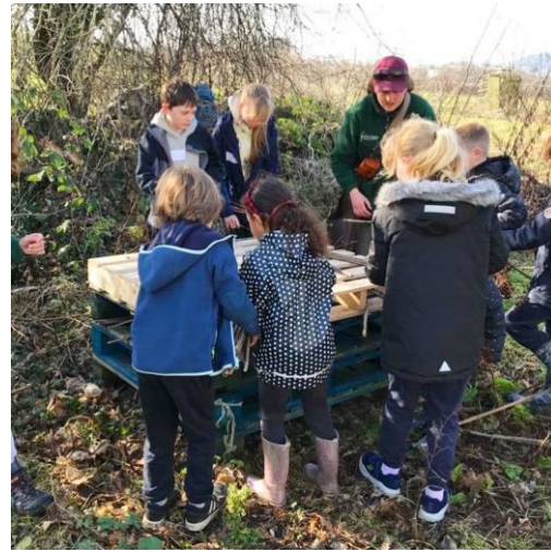
Above: Building an insect habitat

We welcomed over 30 young people aged 7 to 13 for our workshops during the half term, running activities such as Owl flying, 'meet a bird of prey', craft, trails and constructing insect habitats in the meadow at the centre. Giving young people inspiration to carry out practical conservation at home.