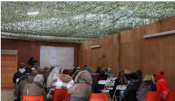
Right: dusk flying display

In January 2022 we began talks with local universities and initiated our specimen collection programme, taking feather samples from birds treated in our rehabilitation hospital for future analysis of particular persistent organic pollutants. We also hosted our first talk evening, generating an understanding of biomagnification and the connection between chemical use and environment, which was well attended and accompanied by a dusk flying display.