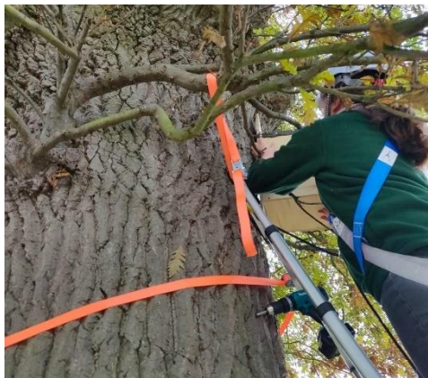
Above: Installation of a Little Owl nest box to a mature Oak tree

Key relationships were built on with local farmers and landowners, making great strides in making grassland habitats safer and more successful for residing pairs of owls and birds of prey.