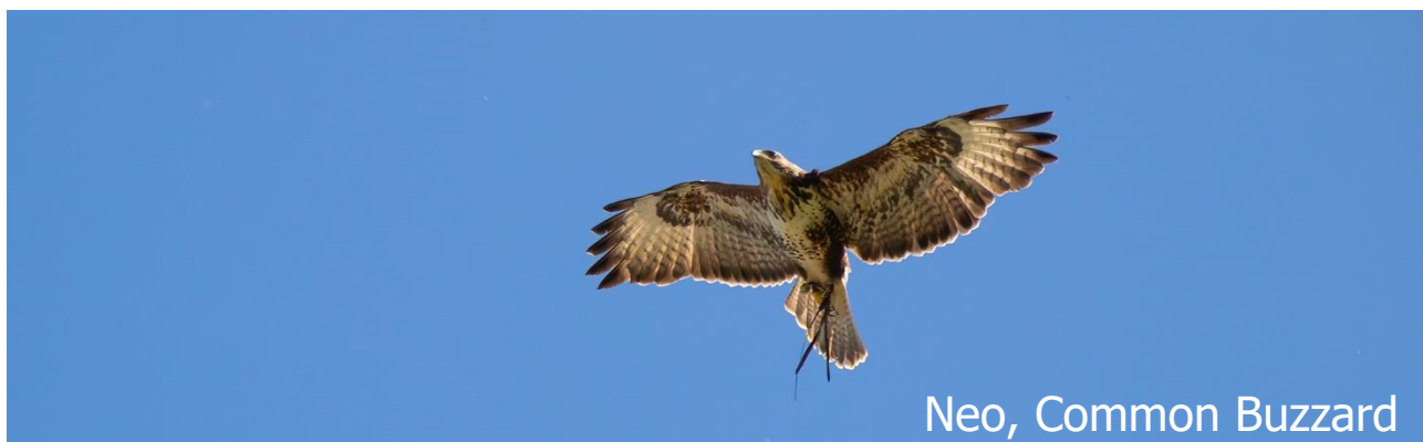
Neo, Common Buzzard