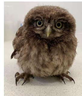
Above: A Little Owl admitted to the Hospital in July 2023 being treated for low condition before a successful soft release to the wild

The most frequently and most successfully treated species in this operational period was Tawny Owls.