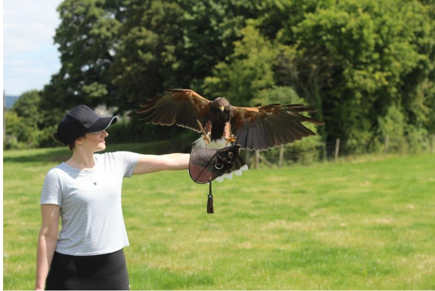
Above: A Hawk Walk

14 volunteers and students benefitted from raptor keeping training and education