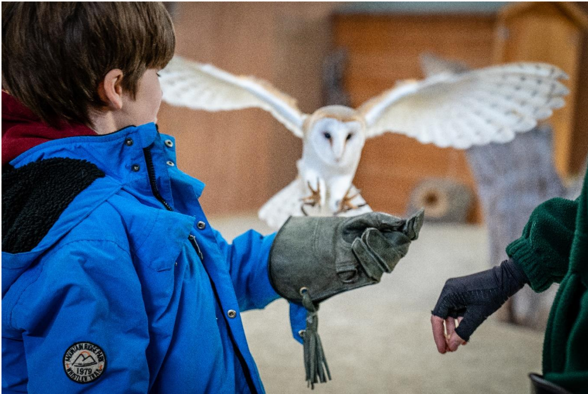
Above: An Owl Encounter

We provided 220 hours of education through hawk walks and owl encounters during the year to 510 visitors.