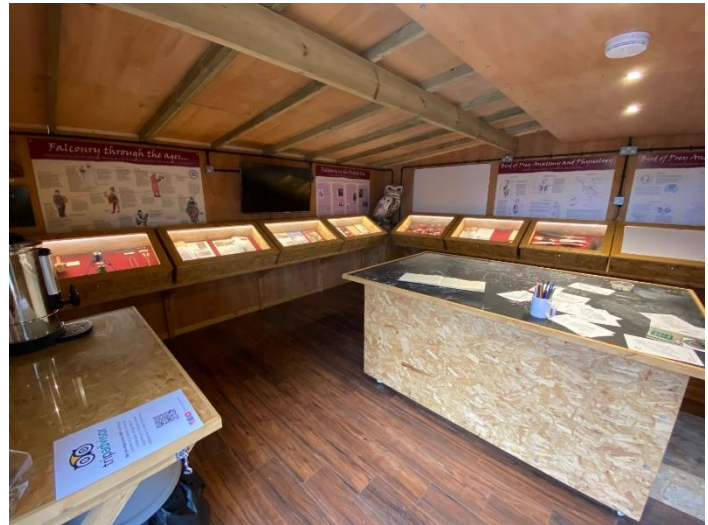
Above: Our new Museum of Falconry and Education Centre opened to visitors in March 2021.

The museum has proved highly successful and also includes a screen showing some of the centres popular films which can also be found on the centres YouTube channel.