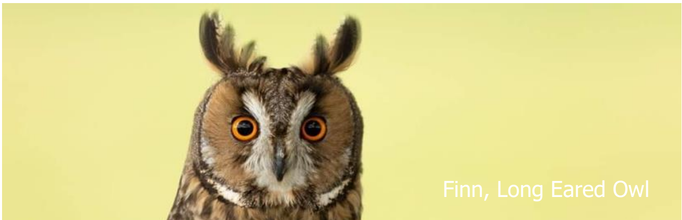
Finn, Long Eared Owl