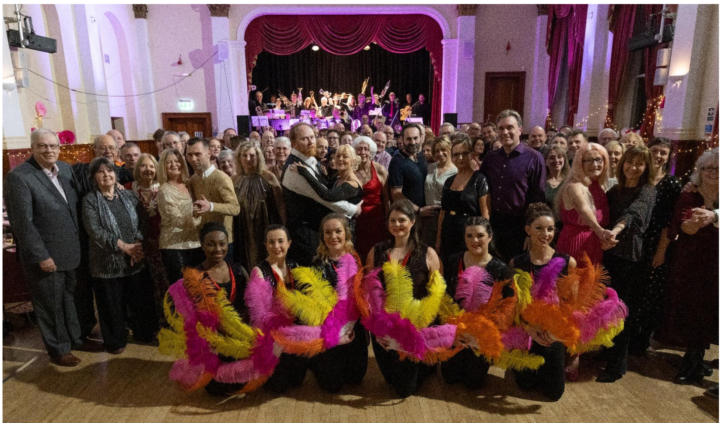
Tring Together. Registered Charity Number 1152858. Registered Company Number 05785975