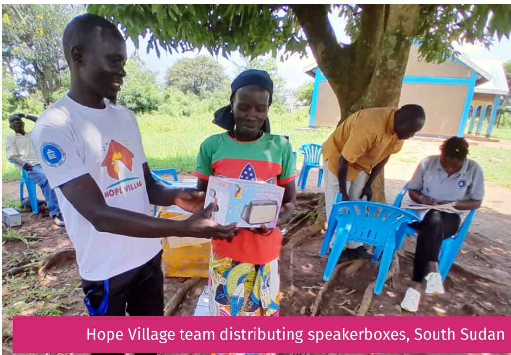
Hope Village team distributing speakerboxes, South Sudan

The "Hope Village" project has completed a second year using speakerbox programmes to promote peace after years of violent conflict.