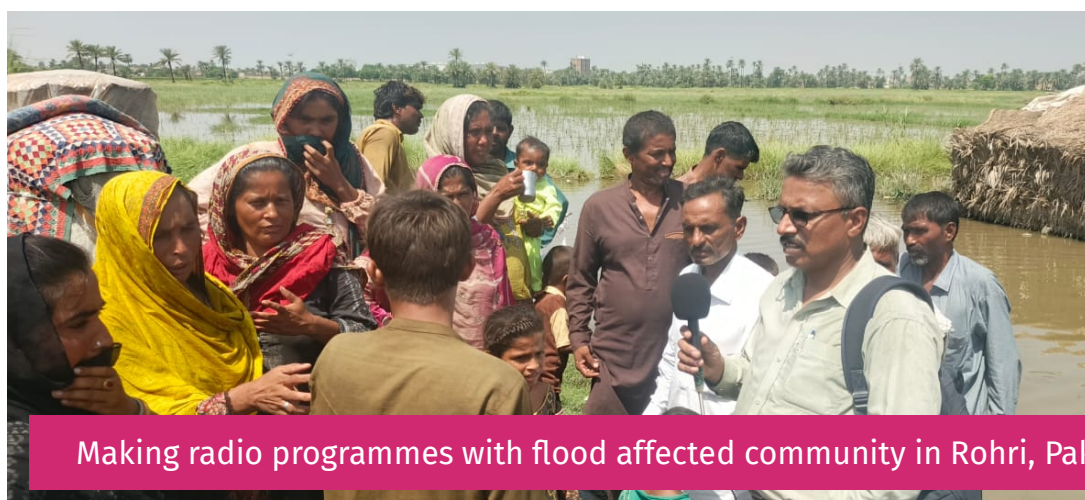
Making radio programmes with flood affected community in Rohri, Pakistan

Amplifying Voices Pakistan has started working with churches to encourage Christians to reach across religious divides in helping their neighbours. In Sargodha this was happening naturally as part of the shared benefits of Bright Home, so when there was an outbreak of religious persecution against Christians in Punjab in summer 2024, local Muslims offered protection to the Christian neighbours involved in Bright Home.