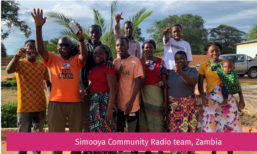
Simooya Community Radio team, Zambia

resulting load shedding limited the radio station's capacity to expand its schedule or build a steady income stream. Despite the challenges the radio station receives regular callers from across Pemba District and from neighbouring districts of Southern Zambia. Farming programmes are a particular favourite.