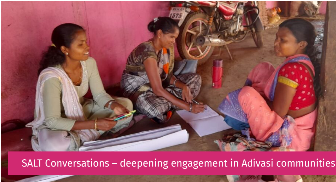
SALT Conversations – deepening engagement in Adivasi communities, India

for children, and solutions to persistent social issues such as addiction and health burdens. By amplifying these voices through monthly speakerbox programmes and community dialogue, the project is becoming a vital catalyst for social transformation in communities that have long felt marginalised. Many listener testimonies, like that of one man who overcame addiction with community support, exemplify the positive change emerging from this strengthened approach.