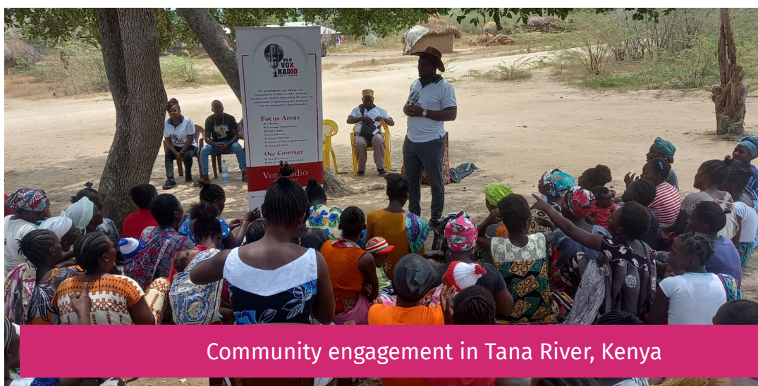
Community engagement in Tana River, Kenya

Amplifying Voices strengthened its partnership with Vox Radio in Tana River County by completing significant infrastructure upgrades and supporting a comprehensive staff restructuring to enhance the station's impact and sustainability. This year, the station continued to show the vital role community-centred media plays in addressing deeply rooted social challenges—ranging from gender-based violence and inequality to climate change and community cohesion—while giving air to voices that are often neglected or unheard. By broadcasting stories that challenge entrenched taboos—such as the intersection of poverty, gender inequality, and health—Vox Radio has initiated conversations that were previously suppressed. These broadcasts have not only raised awareness but have also empowered community members to take action, leading to increased participation in local initiatives and a gradual shift in societal attitudes.