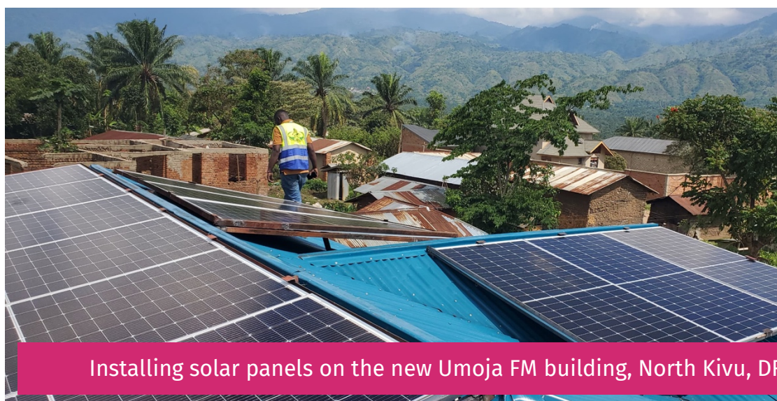
Installing solar panels on the new Umoja FM building, North Kivu, DRC

Amplifying Voices' project in North Kivu in the Democratic Republic of Congo, Umoja FM, continues to be a vital voice of hope for communities around the chiefdom of Watalinga, amidst renewed conflict between the Rwandan government-backed M23 group and the Congolese army. The Amplifying Voices team has continued to provide technical support, training and mentoring for the local team, however sadly this year, the solar power system that provided electricity to the station, was completely destroyed by fire. Despite the inability of the Amplifying Voices team to travel to the region due to the conflict, they successfully collaborated online with the local team and specialists in the DRC and Uganda to replace the system.