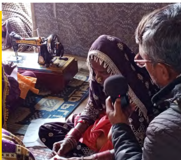
Interviews in the Bright Home class