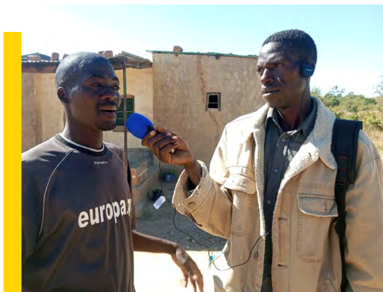
Interviewing Community members in Simooya

Amplifying Voices has been supporting local communities in the Pemba district of Southern Zambia to develop a radio station. Following widespread community consultations, training and discussions with the government, Simooya Community Radio began test broadcasts on 94.3 FM in early April. Against the backdrop of a severe drought, local people expressed how the radio station will play a vital role in helping them find ways to work together to overcome their greatest challenges, as well as promoting health and education.