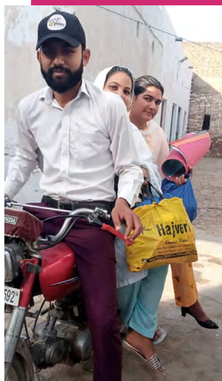
Mobile health clinic, Sargodha