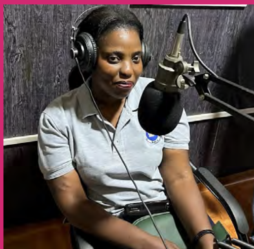
Getting ready to work with Iyete FM