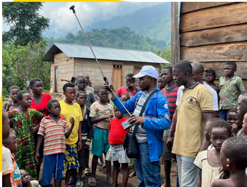
Measuring signal strength in Kikingi