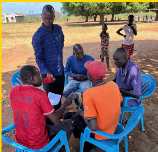
Learning to record content in Morobo

The “Hope Village” project has been running successfully for a year, using speakerbox programmes to promote peace after years of violent conflict. The community faces big challenges as they try to rebuild their lives, but even in the time that “Hope Village” has been running, community members already report improved relationships between soldiers and civilians. People said they now feel able to greet a soldier as they walk along the road without inviting violence or other abuse. Amplifying Voices has identified that a key focus in the coming year will be to support the local team in engaging more communities and expanding reach through a local radio station.