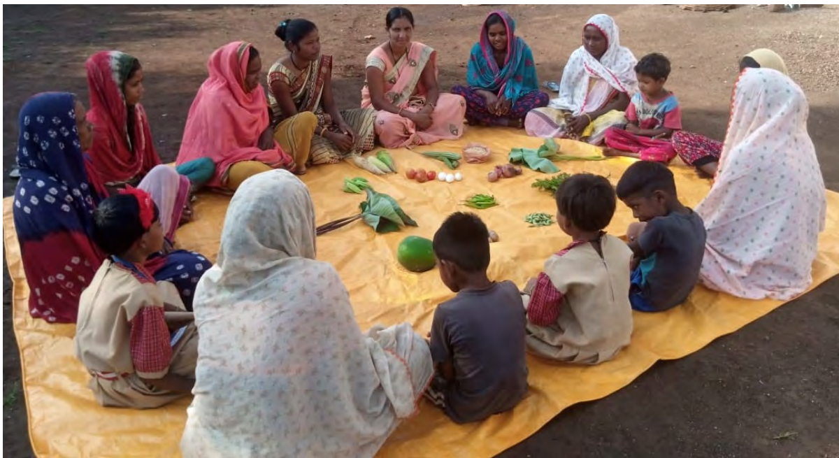
Adivasi women discussing nutrition after listening to speakerbox programme

growing kitchen gardens; many more children, especially girls, attending school; people coming out of bonded labour; reduced domestic violence and a reduction in addiction to substances.