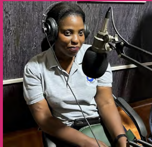
Getting ready to work with Iyete FM