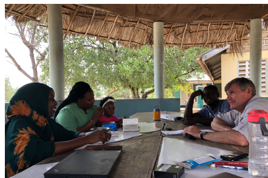
Amplifying Voices visit to Vox FM, Kenya, Feb 2023

In eastern Kenya's Tana River County , Amplifying Voices worked with local and international partners to relocate Amani FM (now known as Vox Radio) from Garsen to the strategically important town of Minjilla. This new initiative, involves the development of a community-based ICT (information communication and technology) centre, with the radio station at its heart. The project is designed to reduce poverty and promote peace, by improving access to information, education, health-access and creating new sources of income and employment through its digital resources centre. The ICT hub will also bridge the digital divide that has for years left the marginalised communities in Tana River and especially women and girls excluded from present-day opportunities.