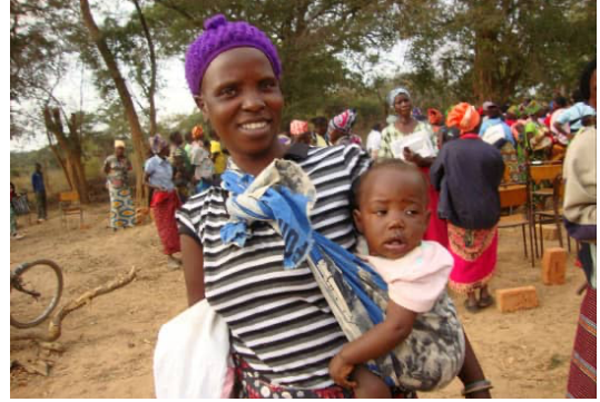
Community members share their hopes for the new station, Simooya, Zambia, 2023

This year saw us form a new partnership with Chibozu Community Trust , a Zambian organisation, to support a community applying for a license to set up a community radio station in Simooya , a rural area in Pemba District, Southern Zambia. Chibozu Community Trust and local community members have worked together for several years to develop a rural health clinic and school, with recent supporting developments such as latrines for the school and a maternity wing for the clinic. The people living in Simooya and the surrounding area are mostly subsistence farmers. Community members consulted told us that a local radio station could mean that the benefits brought by these other developments could reach more people and create new opportunities for education and collaboration among local farmers.