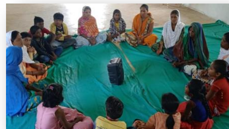
Speakerbox listener group, Maharashtra

As the health situation in India stabilized towards the end of 2021, Amplifying Voices continued supporting our partners in expanding the 'Adivasi Voices' project to reach more indigenous tribal villages with community-centred media to promote health, education and development. As part of this initiative a pilot project was launched to reach bonded labourers from Adivasi villages using a mobile phone app. Currently in its test phase, it is hoped the app will provide critical information to enable them to make their way out of this modern-day form of slavery.