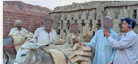
Supporting brickmakers, Pakistan

Amplifying Voices Pakistan also expanded its work to the town of Nowshera in KPK province, which led to the formation of a new partnership known as “Community Media Power” (CMP). After a series of workshops, Amplifying Voices Pakistan provided studio equipment to enable the local team to produce weekly programmes involving the community, which has resulted in significant social gains: