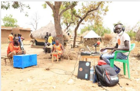
Creating content in refugee settlement, Uganda

In Northern Uganda , our South Sudanese partner, Community Development Centre (CDC), continued to produce and distribute 'Soot Seme' (or 'Voice of Compassion'), community-centred media podcasts bringing together content created by community members in Omugo zone of Rhino Camp. The project continues to expand organically and CDC trained their newly