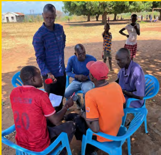
Learning to record content in Morobo

The “Hope Village” project has been running successfully for a year, using speakerbox programmes to promote peace after years of violent conflict. The community faces big challenges as they try to rebuild their lives, but even in the time that “Hope Village” has been running, community members already report improved relationships between soldiers and civilians. People said they now feel able to greet a soldier as they walk along the road without inviting violence or other abuse. Amplifying Voices has identified that a key focus in the coming year will be to support the local team in engaging more communities and expanding reach through a local radio station.