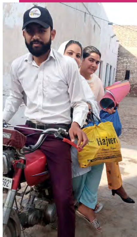
Mobile health clinic, Sargodha