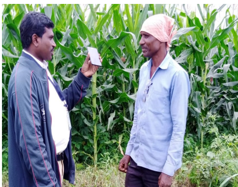
Local team interviews labourer, Maharashtra

As life in India began to normalise following the pandemic, the Amplifying Voices team worked closely with teams in Maharashtra to expand the 'Adivasi Voices Project' and reach new villages. During the year, forty-two indigenous communities were regularly receiving and participating in creating media content, which promoted their health and well-being, delivered on 'speakerboxes'. The project also attracted the involvement of a range of service providers, increasing the interchange of 'on-air' and 'off-air' activities, thus dramatically increasing the impact of the project. Through regular engagement with all the communities and monitoring of changes by the local team, many dramatic stories are being recorded every day, such as the establishment of self-help savings groups; families setting up kitchen gardens to grow vegetables to improve their nutrition; better hygiene and sanitation resulting in improved health; improved access to water and more children going to school, especially girls. In almost all villages however one of the key challenges remains the lack of access to clean water and this year the team worked hard to bring water to a number of villages.