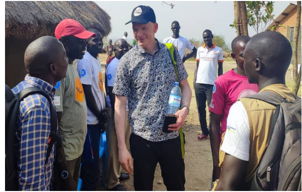
Amplifying Voices visit to Omugo 4 village, Uganda, Feb 2023

In Northern Uganda , our South Sudanese partner, Community Development Centre (CDC), continued to produce and distribute ‘Soot Seme’ (or ‘Voice of Compassion’), community-centred media podcasts bringing together content created by community members in Omugo zone of Rhino Camp. An Amplifying Voices associate visited the Omugo zone in Uganda in Feb 2023. The Soot Seme Council of Reference (CoR), and one of the listener groups met with Amplifying Voices to provide feedback about the project.