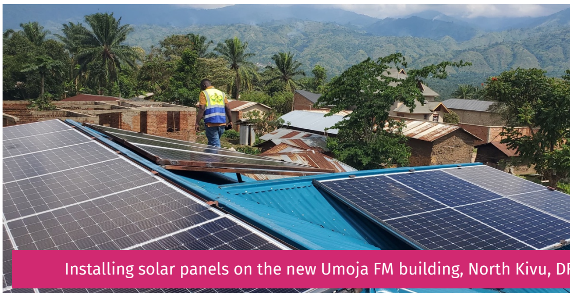
Installing solar panels on the new Umoja FM building, North Kivu, DRC

Amplifying Voices' project in North Kivu in the Democratic Republic of Congo, Umoja FM, continues to be a vital voice of hope for communities around the chiefdom of Watalinga, amidst renewed conflict between the Rwandan government-backed M23 group and the Congolese army. The Amplifying Voices team has continued to provide technical support, training and mentoring for the local team, however sadly this year, the solar power system that provided electricity to the station, was completely destroyed by fire. Despite the inability of the Amplifying Voices team to travel to the region due to the conflict, they successfully collaborated online with the local team and specialists in the DRC and Uganda to replace the system.