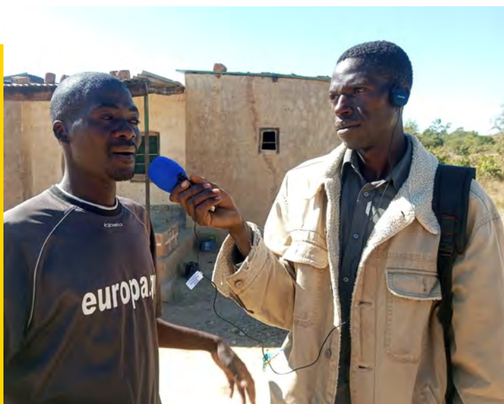
Interviewing Community members in Simooya

Amplifying Voices has been supporting local communities in the Pemba district of Southern Zambia to develop a radio station. Following widespread community consultations, training and discussions with the government, Simooya Community Radio began test broadcasts on 94.3 FM in early April. Against the backdrop of a severe drought, local people expressed how the radio station will play a vital role in helping them find ways to work together to overcome their greatest challenges, as well as promoting health and education.