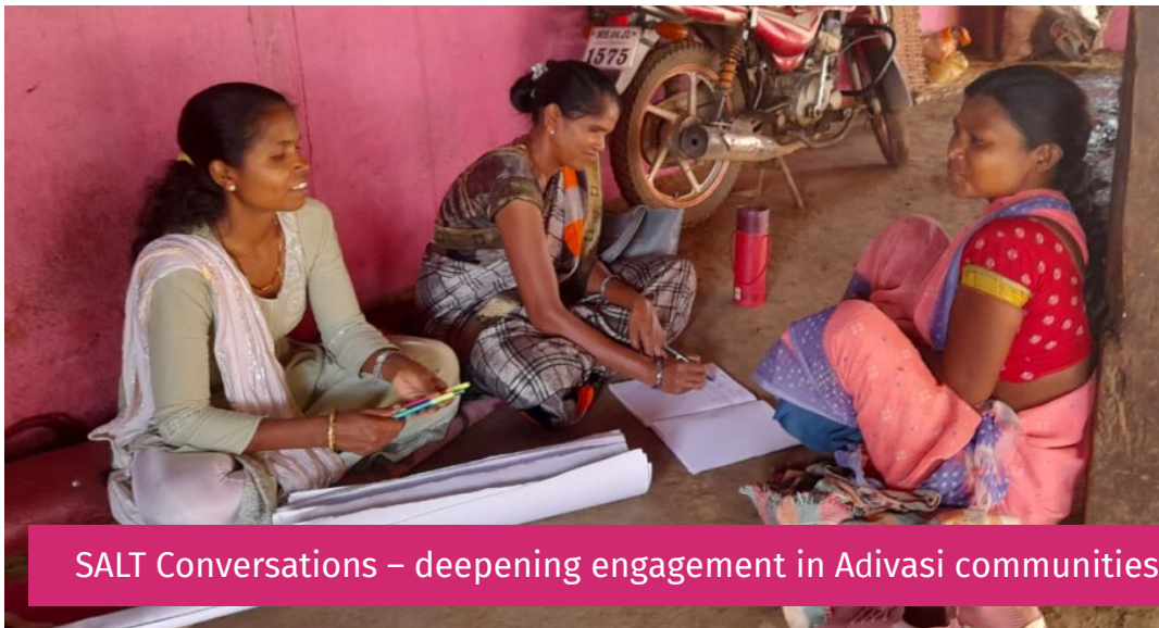
SALT Conversations – deepening engagement in Adivasi communities, India

for children, and solutions to persistent social issues such as addiction and health burdens. By amplifying these voices through monthly speakerbox programmes and community dialogue, the project is becoming a vital catalyst for social transformation in communities that have long felt marginalised. Many listener testimonies, like that of one man who overcame addiction with community support, exemplify the positive change emerging from this strengthened approach.