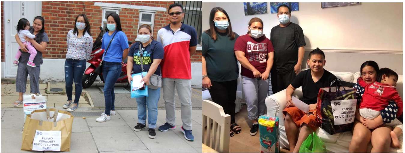
Families of Frontline workers who were supported by TCC Covid-19 Community Support Project (with TCC Trustees and Volunteers).