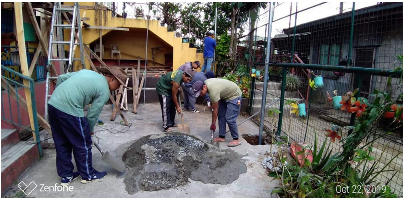
Thru the efforts of individual sponsors and donors, TCC helped repair school facilities in day care center in La Trinidad, Benguet, Philippines.