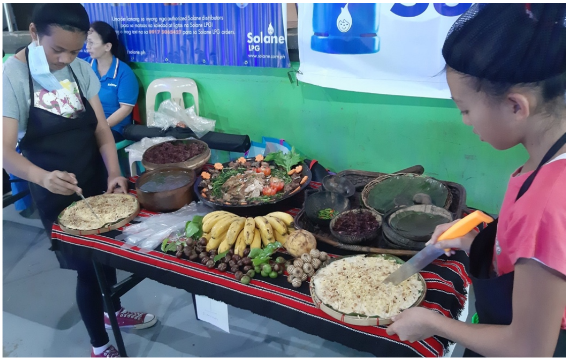
Indigenous Cooking Contest