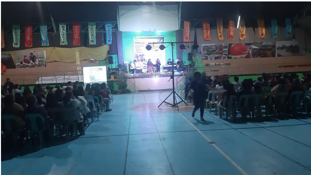
TCC's last concert before COVID-19 Pandemic- Concert for Life 30 Held at the La Trinidad Municipal Gym in 15 December 2019.

TCC's Concert for Life Series have been a success in helping our hundreds of beneficiaries who need financial assistance for their medical needs. From its launching in 2013, 30 concerts have raised more than Php15,0000,000.00 These monies raised were directly used by beneficiaries and no amount are submitted to TCC. TCC funds all the expenses such as talents, hall rents, ticket productions and others. Beneficiaries sell tickets and use whatever money they raise from selling tickets. Sponsors and TCC chapters and partners around the are the sources of funding for this big project. The current COVID-19 Pandemic that struck the world has unfortunately stopped the project and will hopefully restart when life goes back to normal.