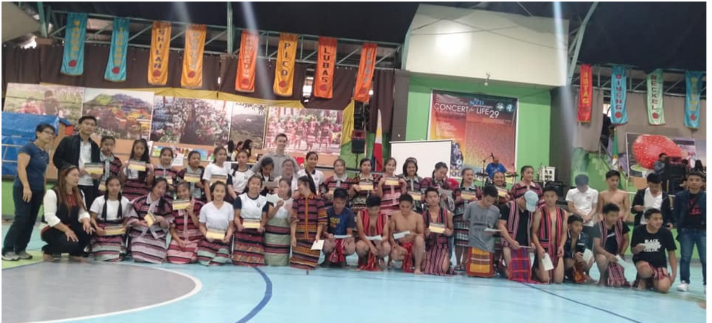
Cultural Dance Contest