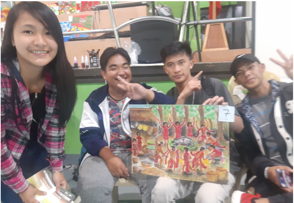
Cultural Art Contest with some of the participants and winners.