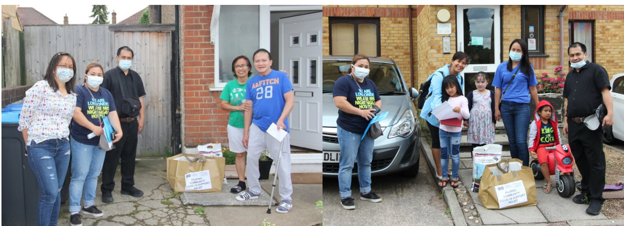
Financial assistance and relief goods to Families and COVID-19 survivor (with TCC Trustees and Volunteers).