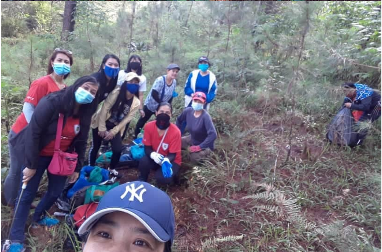
TCC's Project Tree- Clean Up and maintenance drive in December 2019 and July 2020