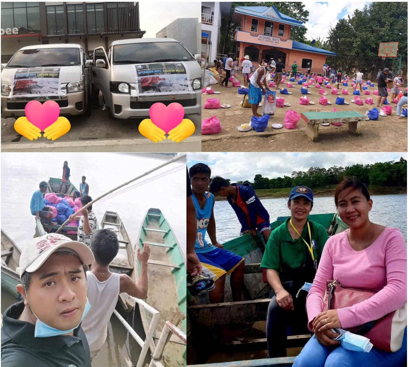
TCC conducted relief operation for the victims of floods in Cagayan Valley.

Here in United Kingdom, the UK Government thru National Lottery awarded £9,000.00 grant to TCC to help members of the Filipino Community. With the grant, TCC COVID-19 Community Support Project was set-up and TCC Trustees and volunteers worked with several Filipino community and church organisations to reach out those who are in need. More than a hundred individuals and families were given support. The support ranged from providing essential goods up to granting financial financial assistance.