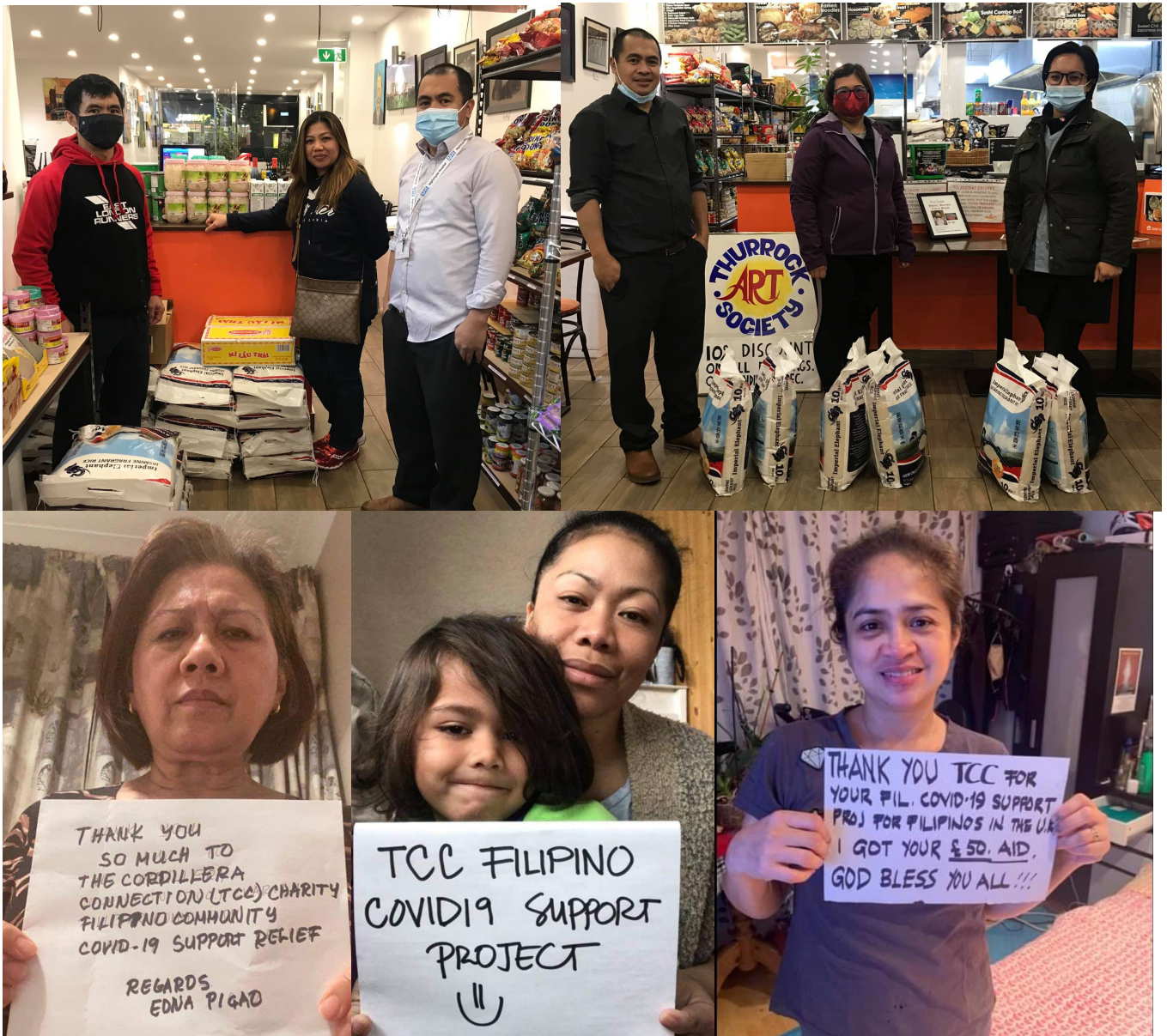
Some of the many members of Filipino Communities and organisations who were supported.