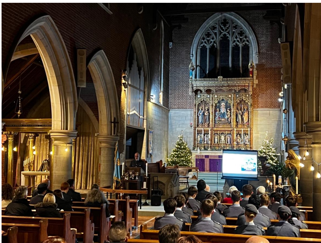
ATC Award Evening at St Mary's

Junior Church continues to teach our children and young people the Faith during our Sunday masses throughout term-time. We thank those hard working people who share the Faith with our young people, and in doing so, prepare the Christian leaders of the future to work with us in Christ's Vineyard.