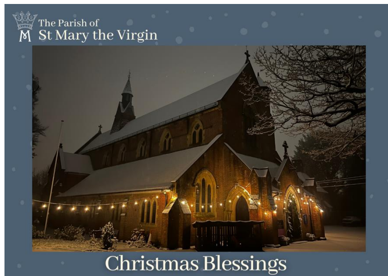
2023 Parish Christmas Card

We carried out the annual distribution of St Mary's Christmas Cards across the whole parish detailing our Christmas services.