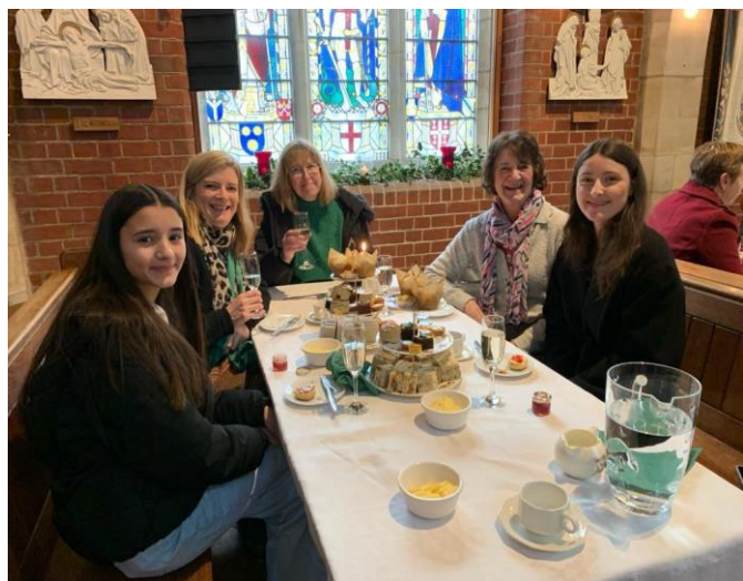
A family enjoying our wonderful tea-room in church

And a special big thank you goes out to Kyle Smith who sourced, set up purchase agreements and collected kegs from several local breweries dotted around Sussex. The beer selection was excellent.