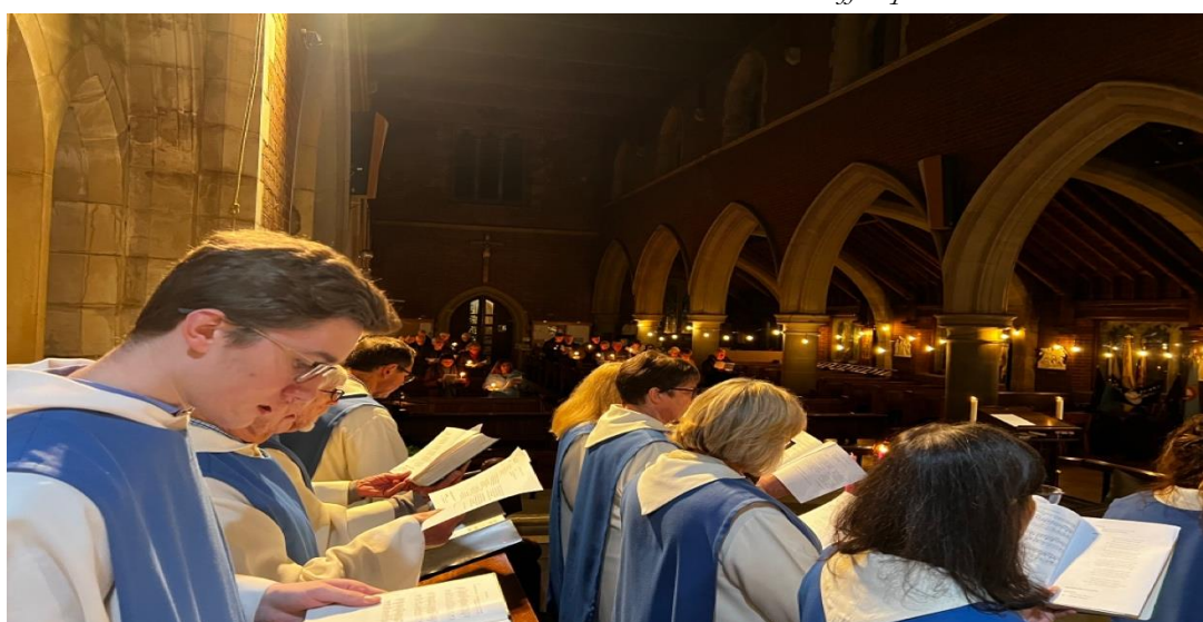
The choir lead a beautiful Advent Carol Service.