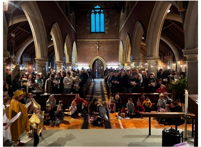
Christmas Eve Crib Service