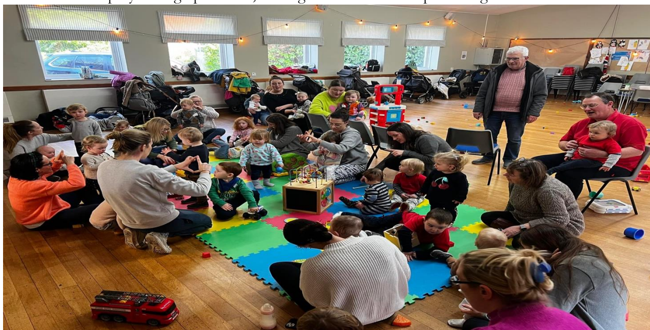
Song time at Baby and Toddler