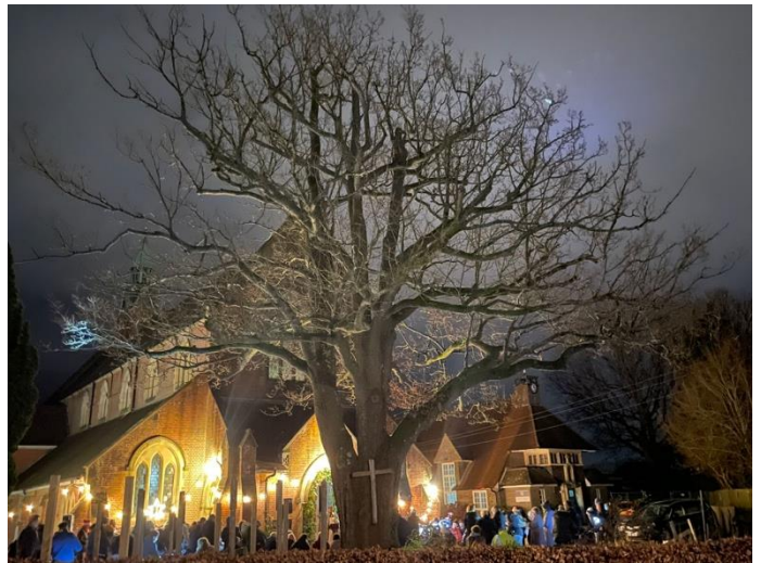
Carols around the oak Tree

Our crib service was supported by children who attended the Christmas Club, and was attended by over 250 people. This service, along with our Advent Carol Service, and Christmas masses helped us increase our 'Christmas service' attendance to pre-pandemic numbers; a very positive achievement.