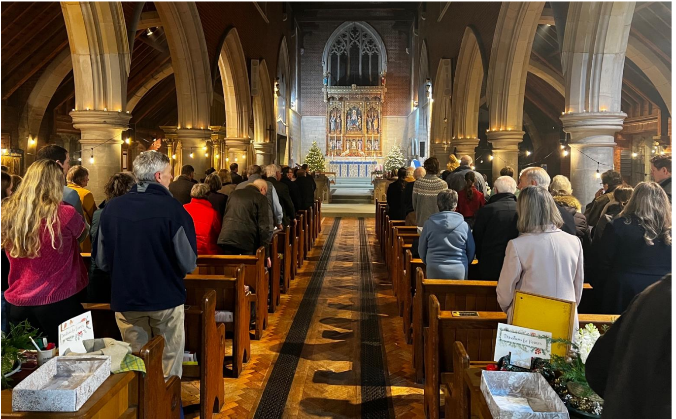
A full nave for Midnight Mass.