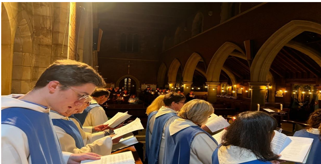
The choir lead a beautiful Advent Carol Service.