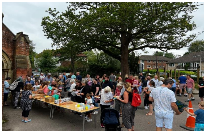
Families and friends enjoying pizza together after the summer club play.