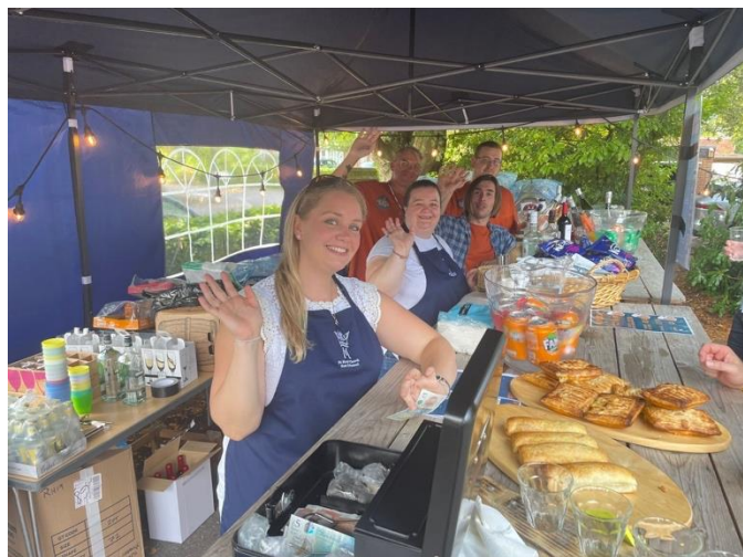
Volunteers at our Beer Festival

We intend to make tweaks and adjustments but we think we have cracked the formula. Supported by the Concert Band in the afternoon and The Uke Band for our evening entertainment punters drank, chatted, danced and had a jolly good time. We even played the rugby through our newly purchased flat screen TV and served half time burgers.