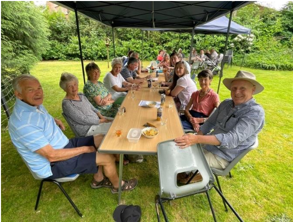
Parish BBQ at the vicarage