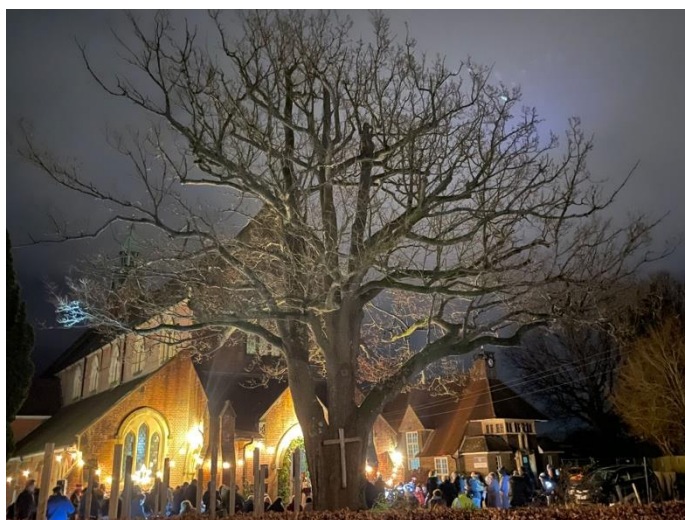
Carols around the oak Tree

Our crib service was supported by children who attended the Christmas Club, and was attended by over 250 people. This service, along with our Advent Carol Service, and Christmas masses helped us increase our 'Christmas service' attendance to pre-pandemic numbers; a very positive achievement.