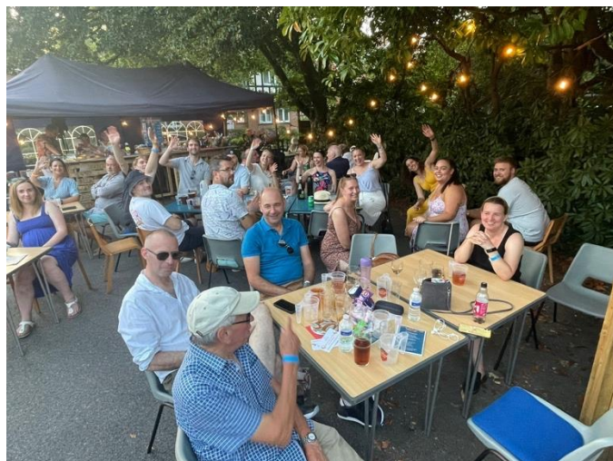
Revellers soaking up the festival vibe

The event requires a lot of set up and dismantling but we had a strong team meaning we were in a fit state (minus a few hangovers) to host the Patronal festival the day after. Thank you to everyone who made this a great event not just for church but for East Grinstead. It certainly helps put our church on the map.