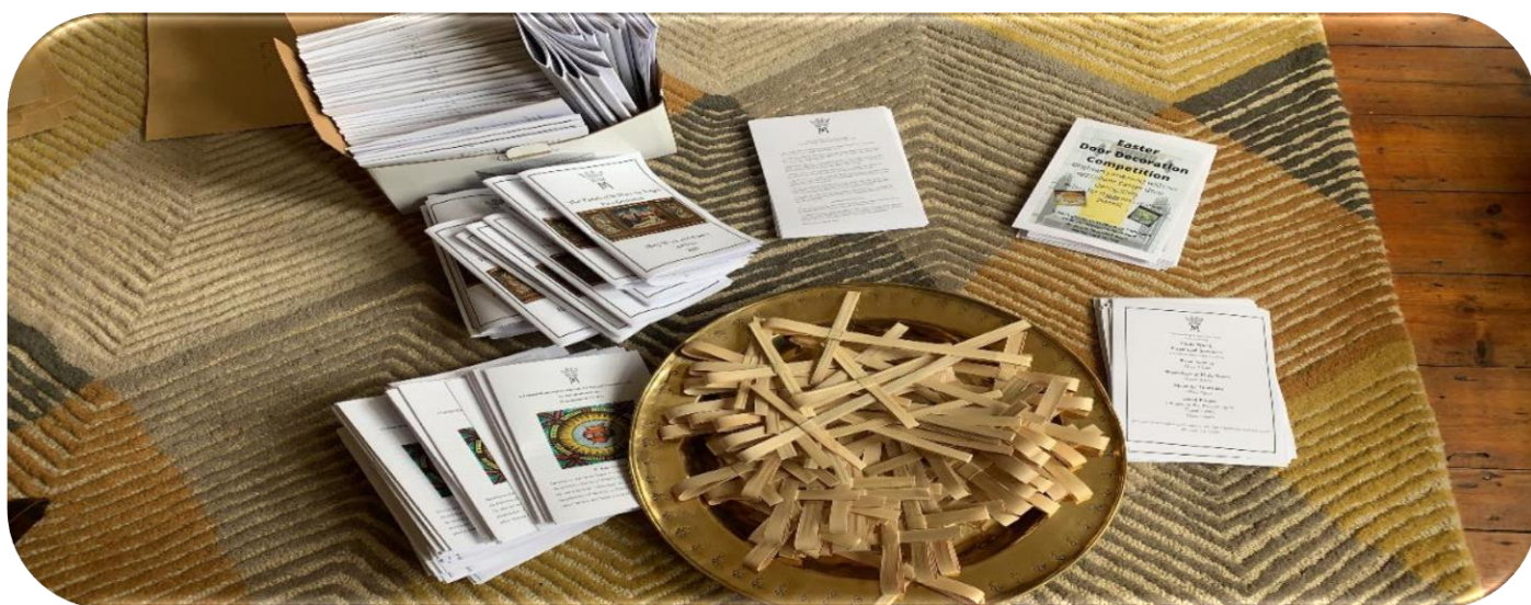
Holy Week Packs being put together in the Vicarage.