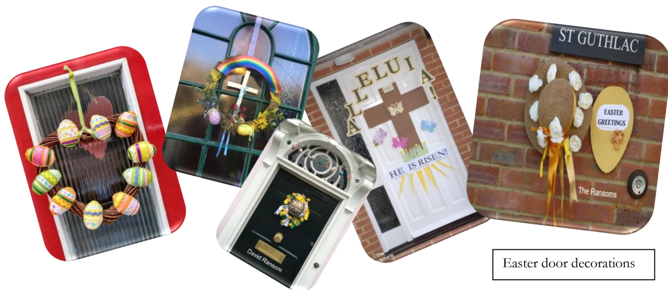
Easter door decorations

As part of the Lent packs that were sent out to the electoral roll, our young people (and the young at heart, one creative participant is in her 90's!) were asked to decorate their front doors for Easter. This sparked a wave of creativity with some making fantastic displays, Easter Gardens and lots of sweet treats.