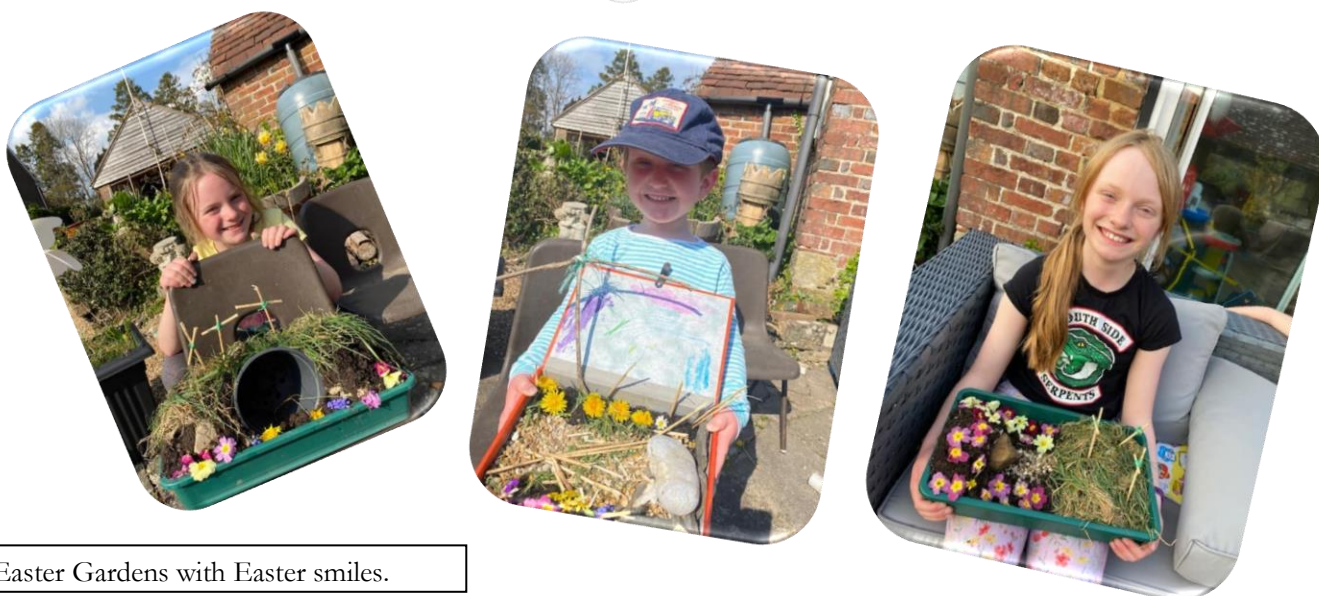
Easter Gardens with Easter smiles.

The Foundation Governors continued to represent the interests of the Church on the Governing Body of the school. There are currently two vacancies on the Governing Body for Foundation Governors.