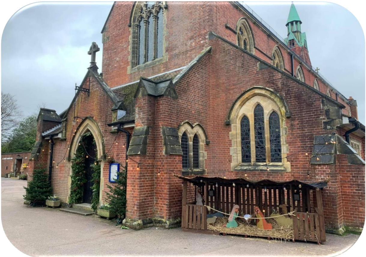
St Mary's Outdoor Nativity Scene