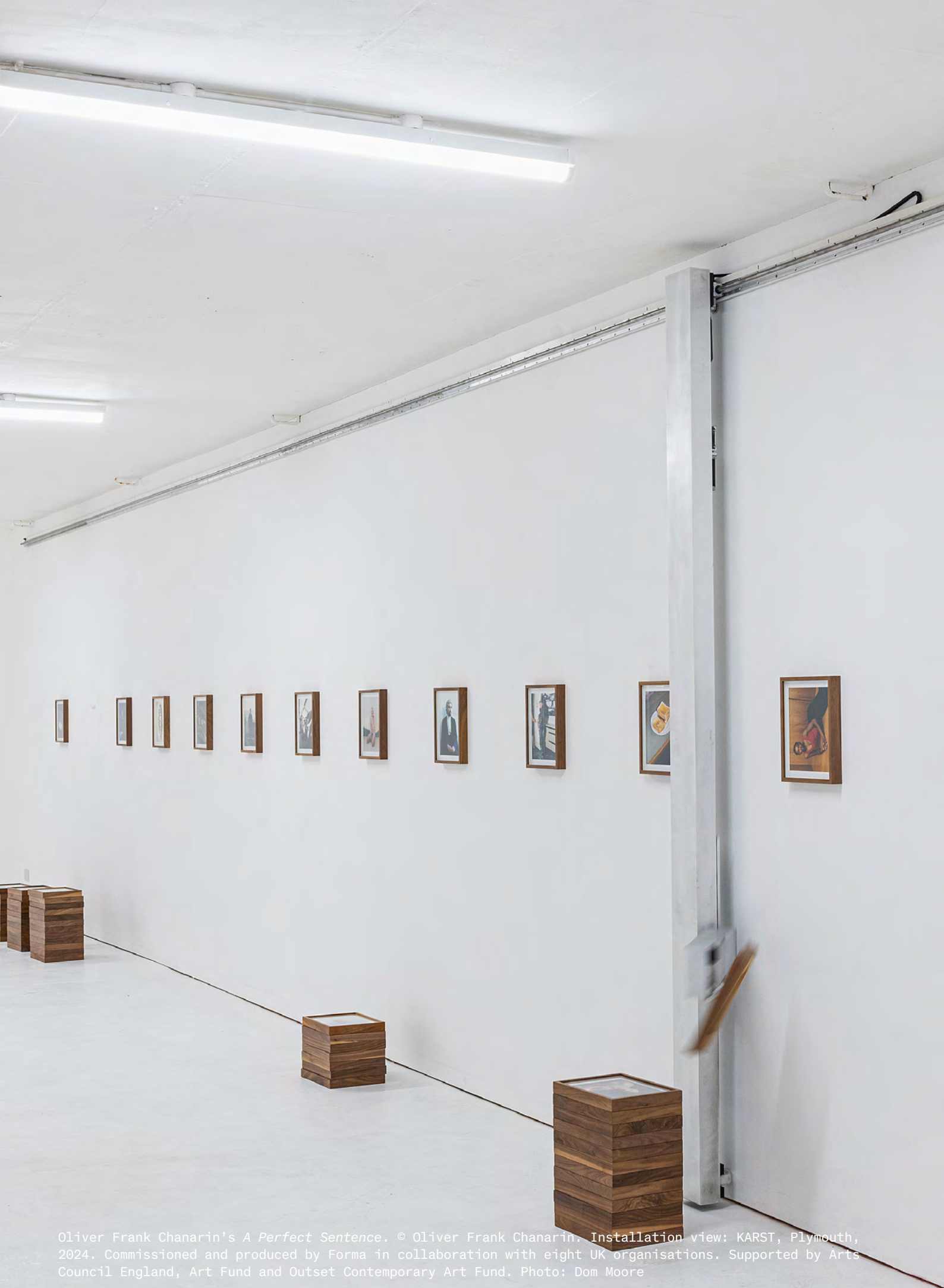
Oliver Frank Chanarin's A Perfect Sentence . © Oliver Frank Chanarin. Installation view: KARST, Plymouth, 2024. Commissioned and produced by Forma in collaboration with eight UK organisations. Supported by Arts Council England, Art Fund and Outset Contemporary Art Fund.