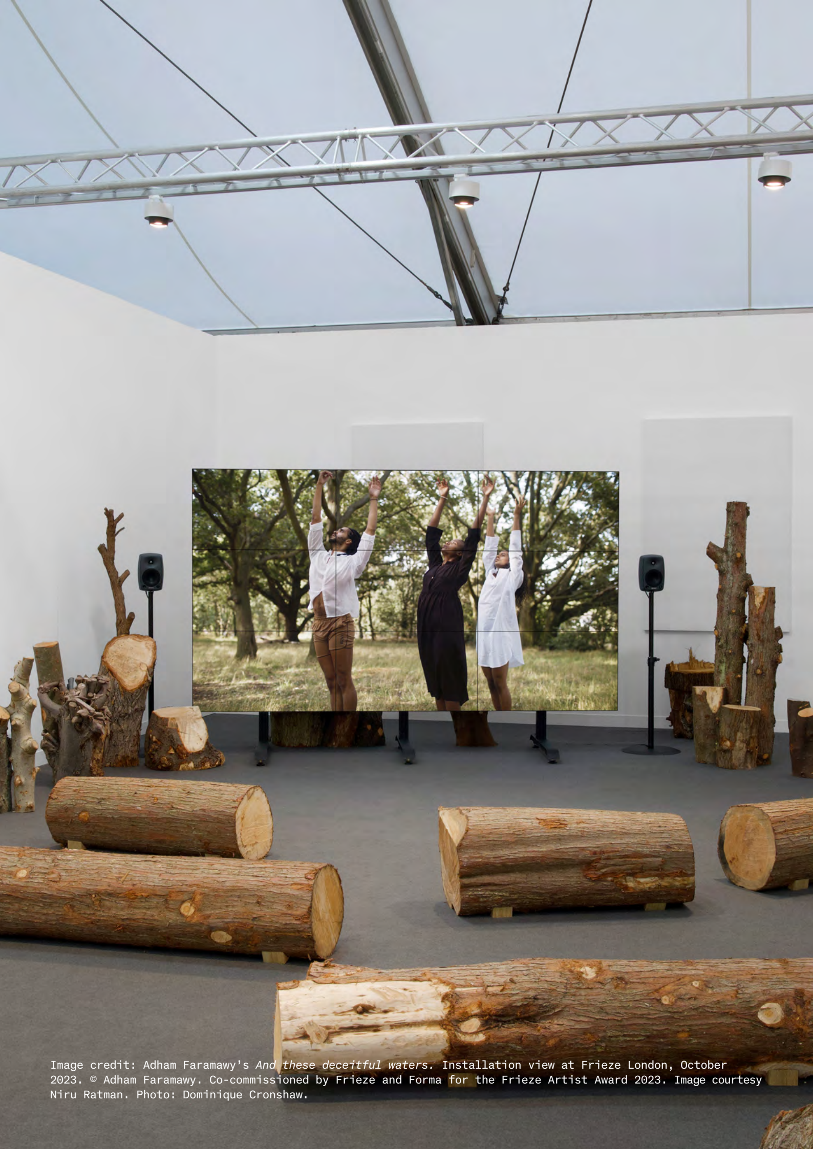
Image credit: Adham Faramawy's And these deceitful waters . Installation view at Frieze London, October 2023. © Adham Faramawy. Co-commissioned by Frieze and Forma for the Frieze Artist Award 2023. Image courtesy Niru Ratman. Photo: Dominique Cronshaw.