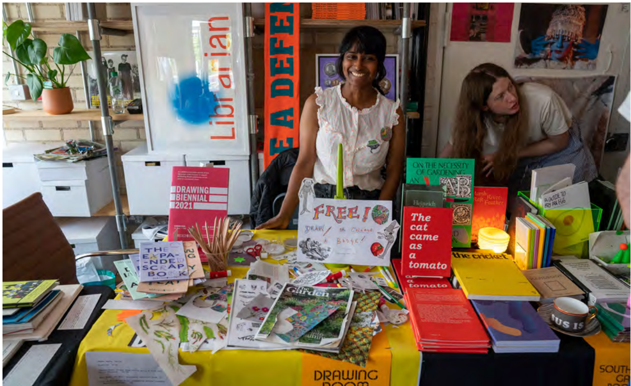
Image Credit: Presse Books Fair at FormaHQ, June 2023. Photographer Katarzyna Perlak. Courtesy Forma.

Through our public programme we support artists and community partners in the development and presentation of events such as performances, workshops, talks, screenings, book launches, exhibitions, architectural tours or garden open days. This free-to-attend programme is delivered by a dedicated team of 3 Forma staff and creates employment opportunities for up to 50 artists, technicians and casual staff throughout the year. In 23/24 we welcomed 4,148 visitors to the building across a programme of 22 events, Presse Books and Peveril Gardens.