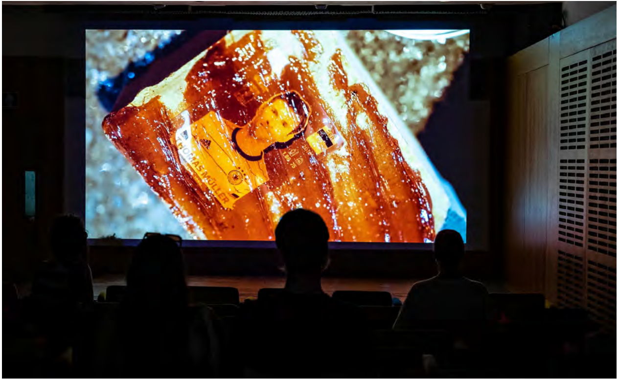
Image Credit: R.I.P. Germain's Everything's For Sale & Everyone's Welcome To Buy . Installation view. Courtesy and © the artist. Commissioned by Forma for the Whitechapel Gallery's Artists' Film International 2023. Photo: Katarzyna Perlak.

Everything's For Sale & Everyone's Welcome To Buy toured throughout 2023/24 to the following AFI partners: