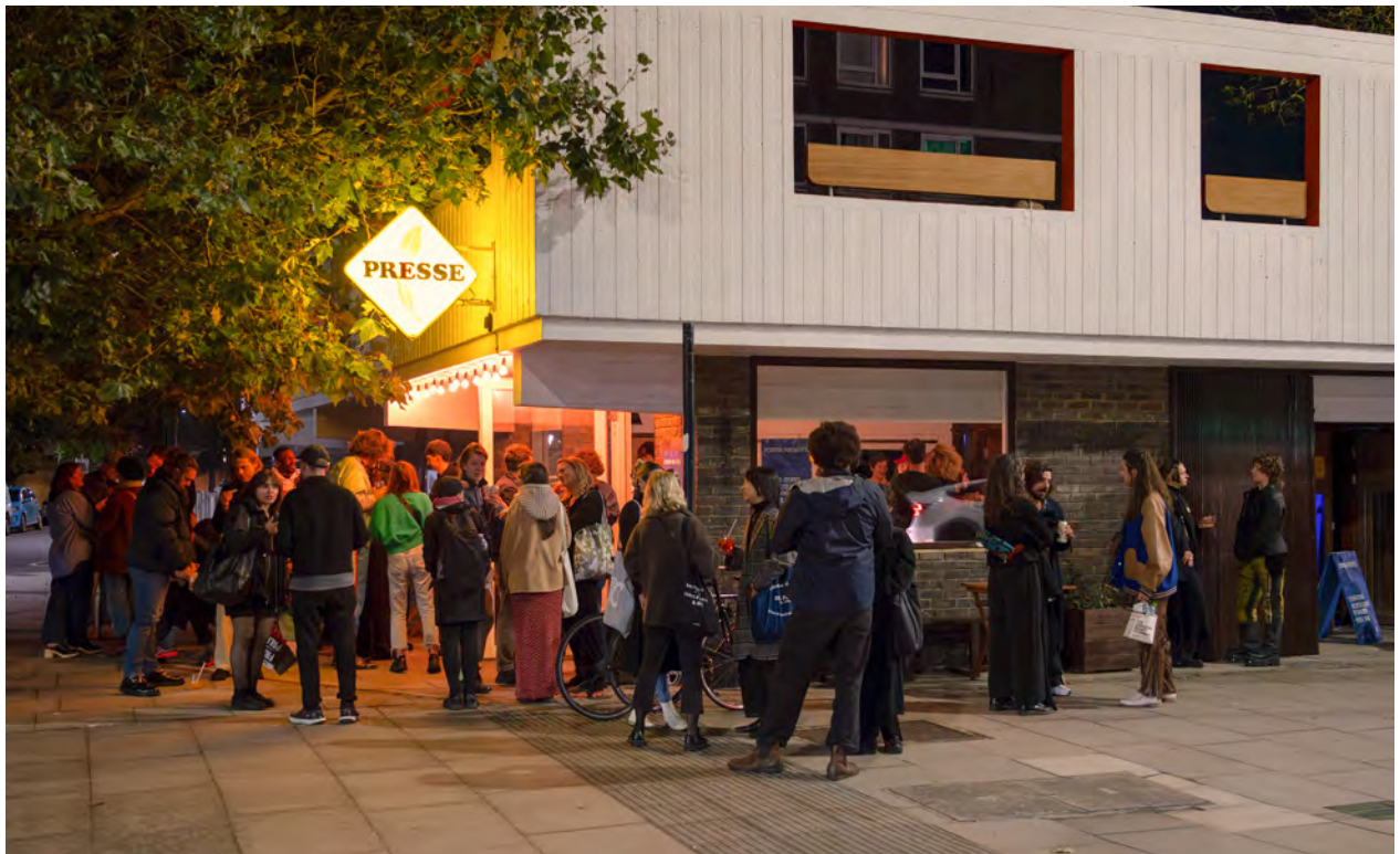
Image Credit: Presse Books at night. Photographer Sam Nightingale. Image courtesy Forma.

As a new venture, a close eye was kept on monthly performance. The operational cost of the original model was weighted towards the coffee shop aspect of Presse Books with a full-time member of staff, equipment and supplies. Our primary market was therefore local residents and general footfall on Great Dover Street.