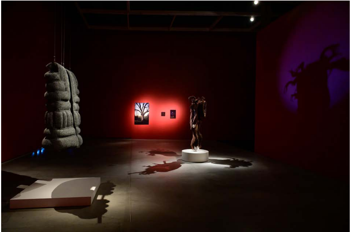
Exhibition view of Amarte Golding's solo show In the comfort of embers at The Power Plant, Toronto, 3 February - 14 May 2023.

Upon the end of the tour, the work went on to be exhibited at The Power Plant, Toronto as part of Golding's solo show, In the comfort of embers from 3 February - 14 May 2023.