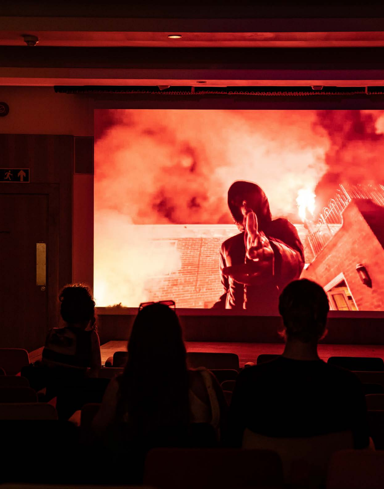
Image Credit: Installation view of RIP Germain's Everything's For Sale & Everyone's Welcome To Buy as part of Artist Film International at Whitechapel Gallery, London 14 June - 17 September 2023. Photographer Kasia Perlak. Image courtesy of Forma.