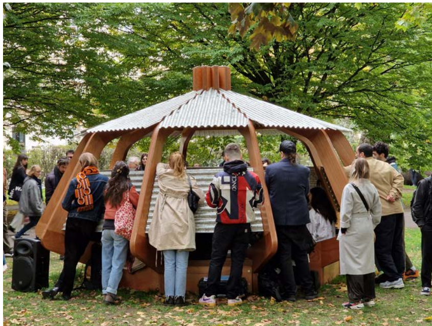
Image Credit: Installation view of Abbas Zahedi's Waiting With {Sonic Support} in Regent's Park as part of Frieze London, 12-16 October 2023. Image courtesy of Forma.

Winner of the Frieze Artist Award 2022, Abbas Zahedi presented a prototype for a new form of civic infrastructure with Waiting With {Sonic Support} . Responding to the particularities of Frieze London, the installation activates the fair's threshold, to establish a speculative transport system for utopian daydreaming between its inside and outside. Developed from Jean-Paul Sartre's notion of bus stops as places to "achieve practical and theoretical participation in common being", one first encounters the installation whilst approaching the fair. Echoing the form of a Central Asian Soviet-Era bus stop, Abbas' co-designed waiting zone is a site of ensemble; a place where one can depart from the isolated individuality of our contemporary age - Sartre's "plurality of isolations" - by convening with others in a common interconnected space.