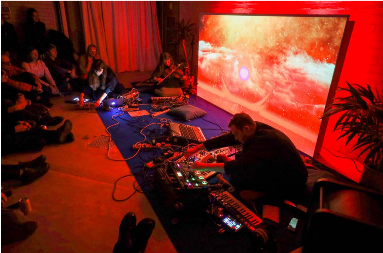
Image Credit: Benedict Drew live performance at FormaHQ with Arianne Churchman and Natalie Kynigopoulou on 9 December 2022. Image Courtesy of Forma.

Tieu's film presents a detailed reconstruction of the interior of the Hotel Nacional de Cuba in Havana, the site of the first-known instance of sonic warfare, and the incident to which the mysterious set of medical disorders collectively termed "Havana Syndrome", owes its name. First reported by US government officials in the Cuban capital in 2016, Havana Syndrome includes a range of unexplained symptoms from nausea, fatigue and memory loss to brain injuries resembling concussions, thought to be caused by covert sonic weapons. In Tieu's film, footage leading from the hotel's lobby through to an occupied hotel room is shown from the viewpoint of a small flying mosquito. Rendered as nano-drone camera footage, these images analyse the architectural and technical skeleton of the hotel, speculating on how the attacks could have taken place.