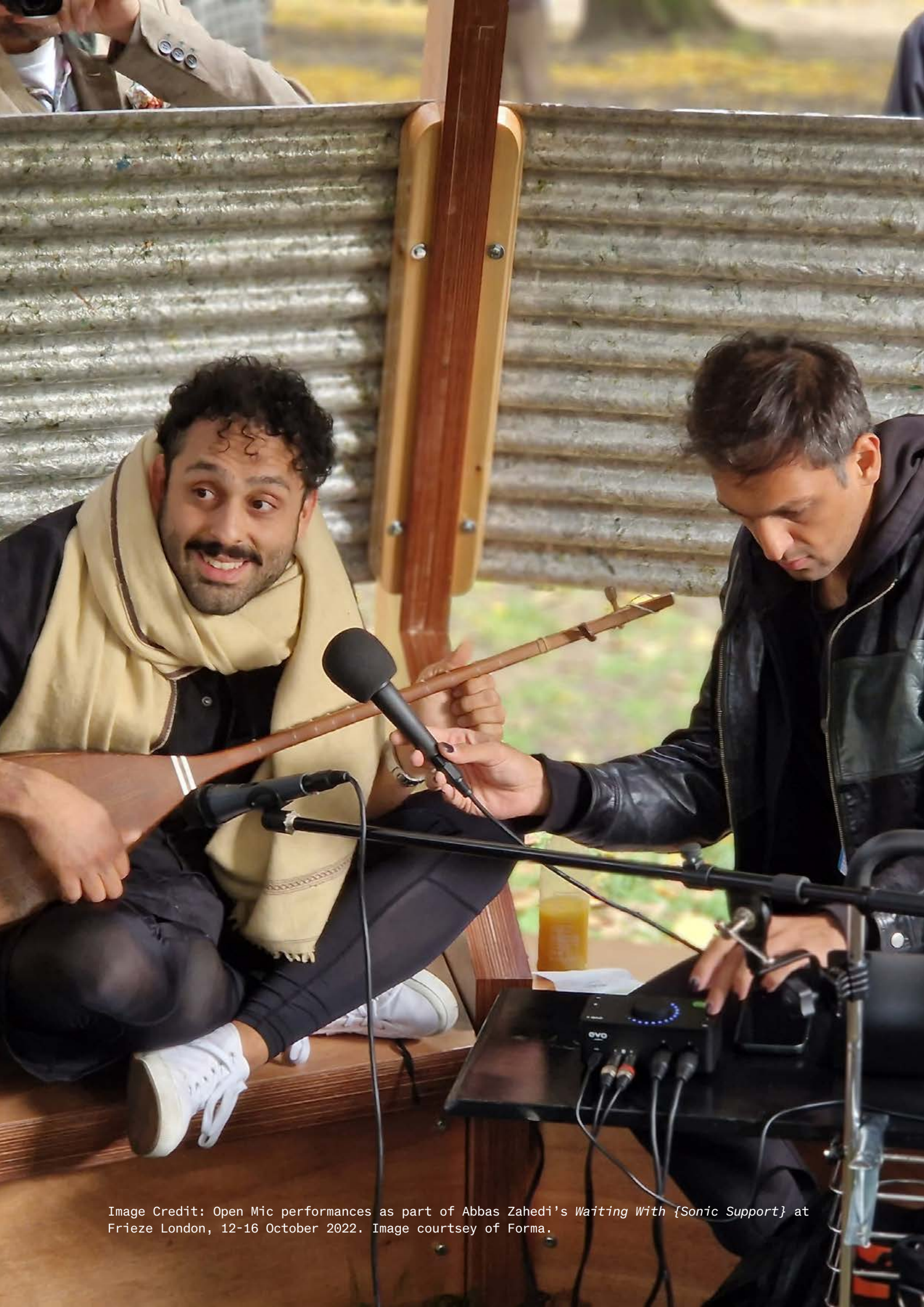
Image Credit: Open Mic performances as part of Abbas Zahedi's Waiting With {Sonic Support} at Frieze London, 12-16 October 2022. Image courtesy of Forma.