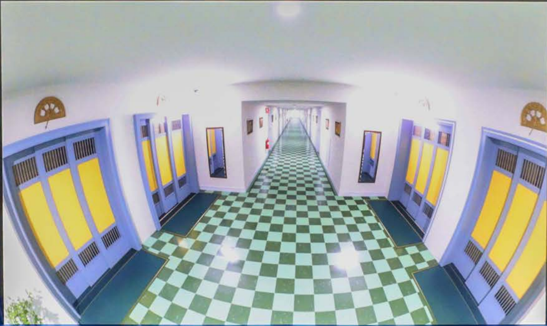
Image Credit: Sung Tieu, Moving Target Shadow Detection at FormaHQ 18 November - 3 December 2022. Image courtesy of Forma.