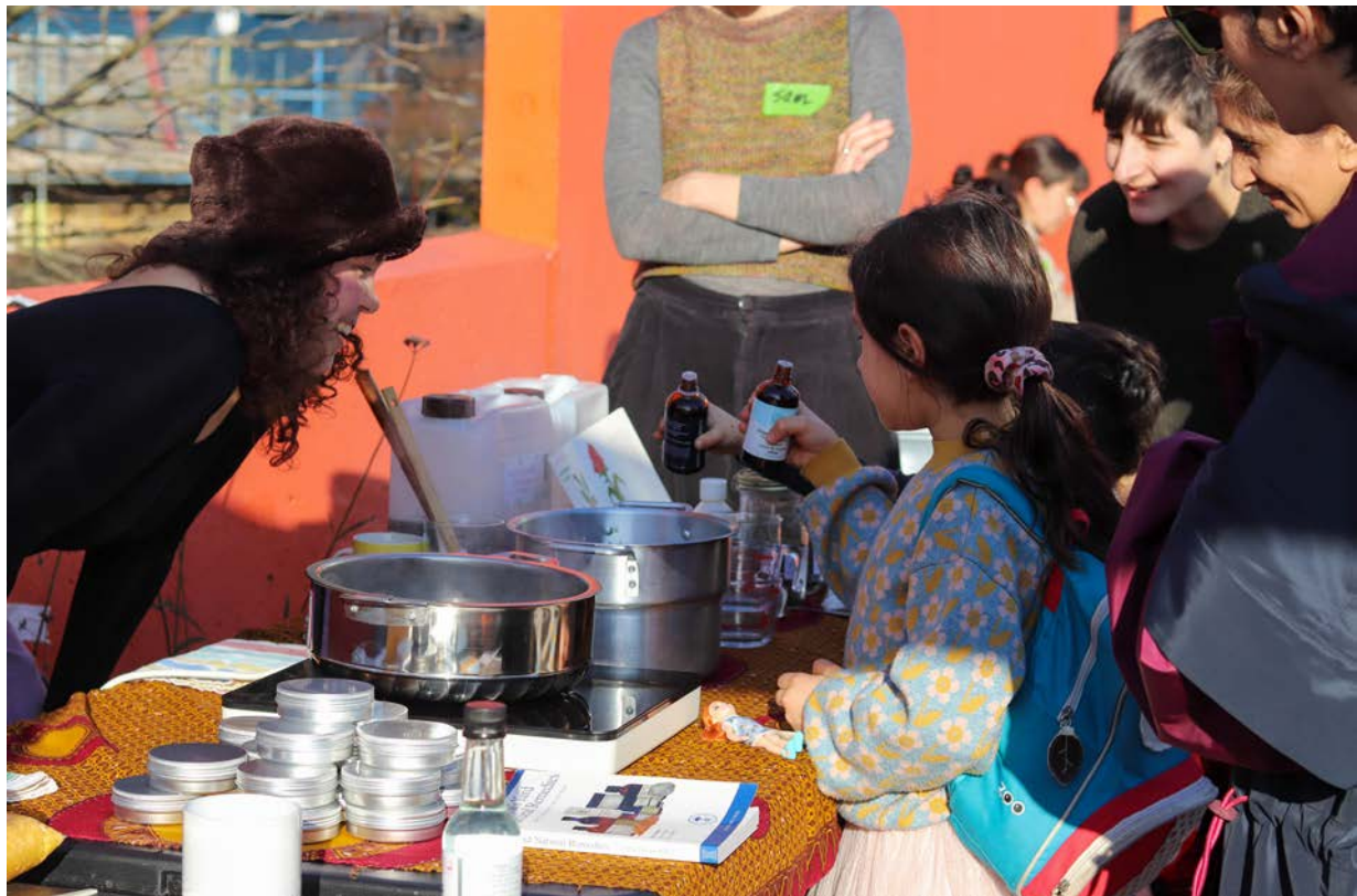
Image Credit: Ali Yellop's 'Winter Wellness' workshop in Peveril Gardens, February 2023 as commissioned and led by Flatness during their residency. Image courtesy of Forma.

Following 120 applications to the Open Call, collective Flatness were awarded a free studio at FormaHQ for 7 months, a £15,000 bursary towards fees and production costs and mentorship support from Forma staff.