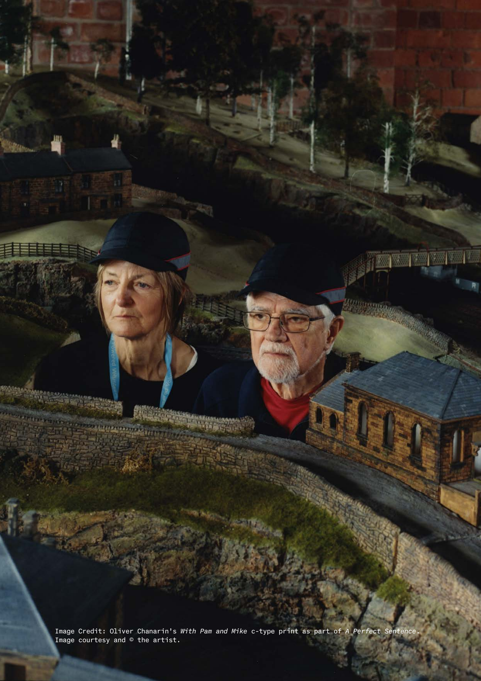
Image Credit: Oliver Chanarin's With Pam and Mike c-type print as part of A Perfect Sentence . Image courtesy and © the artist.