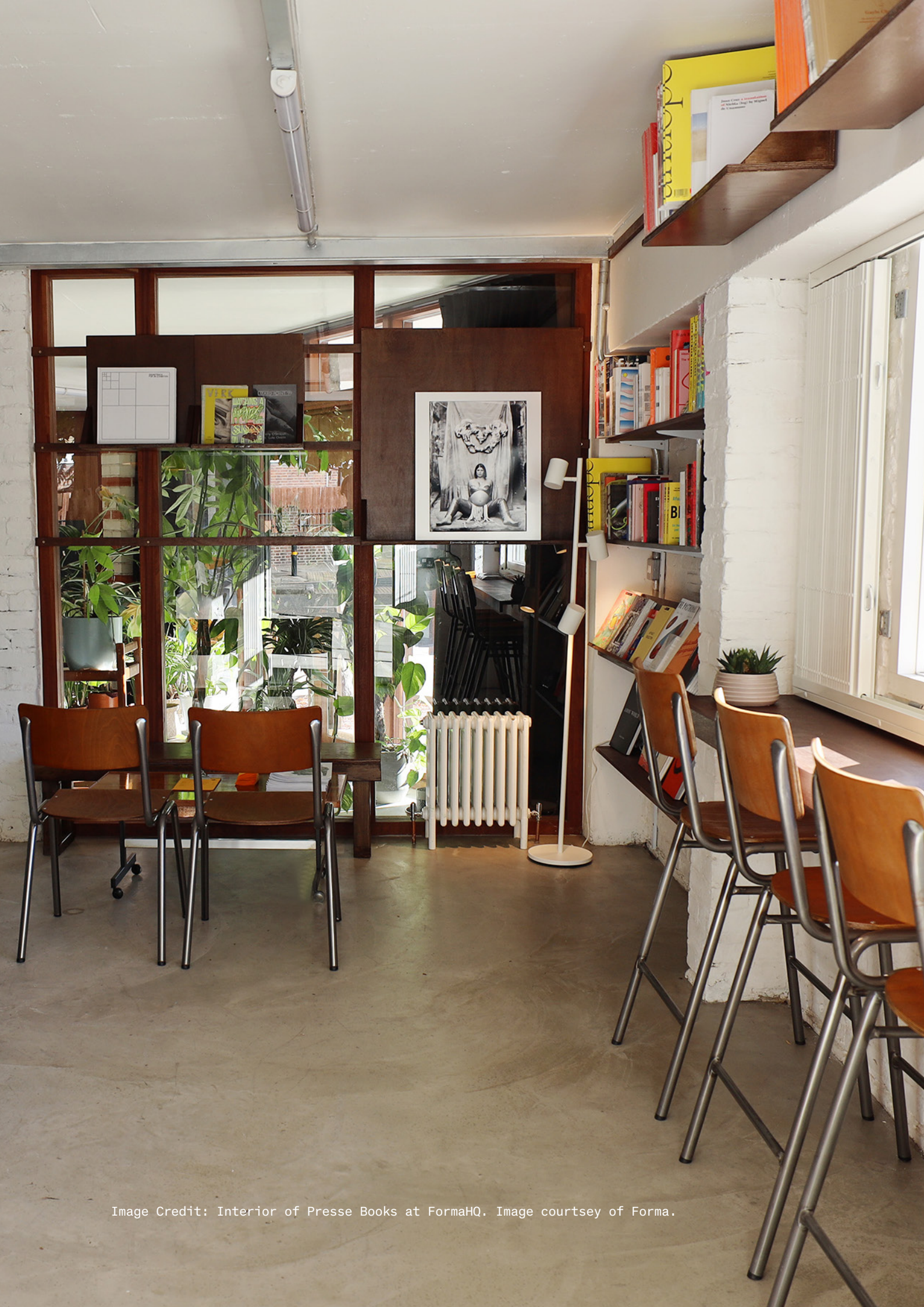
Image Credit: Interior of Presse Books at FormaHQ. Image courtesy of Forma.