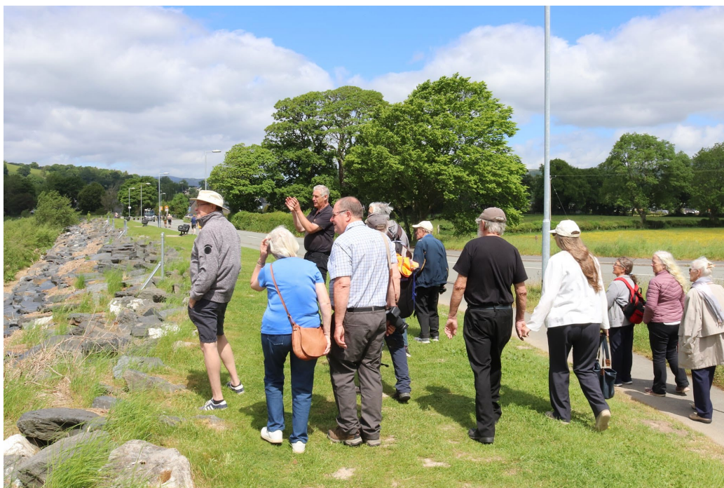
Visitors in June 2021 walking the proposed extension.