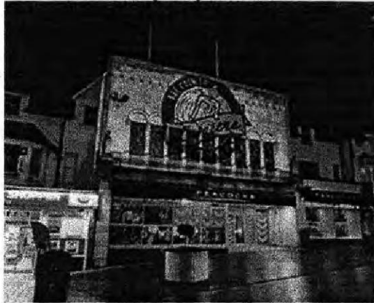
Creating Animations for the Lumiere at Bayview Shopping Centre