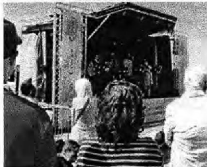
Ghostbusters at Promxtra