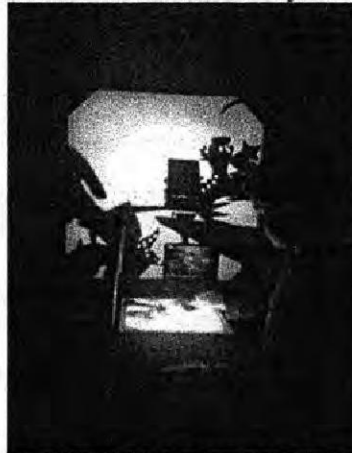
Beacons Cymru Basecamp Event at TAPE