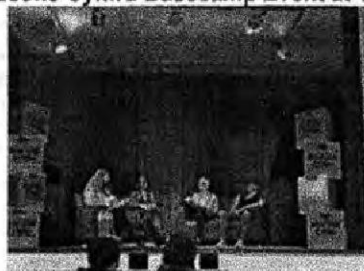
Ghostbusters with the Conwy Connect Makaton Choir at Winter Sounds