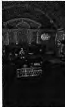
TAPE Sound at Winter Sounds with John Power