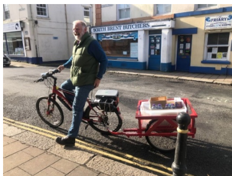
A volunteer delivering pharmacy supplies