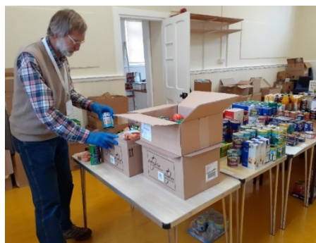
Volunteering at the food-bank