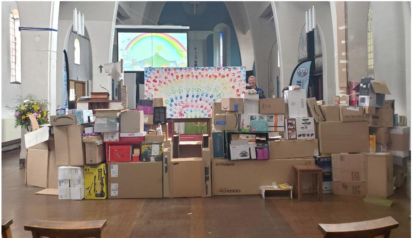
Junk-model Noah's ark, with a hand-print rainbow, from our summer fun day