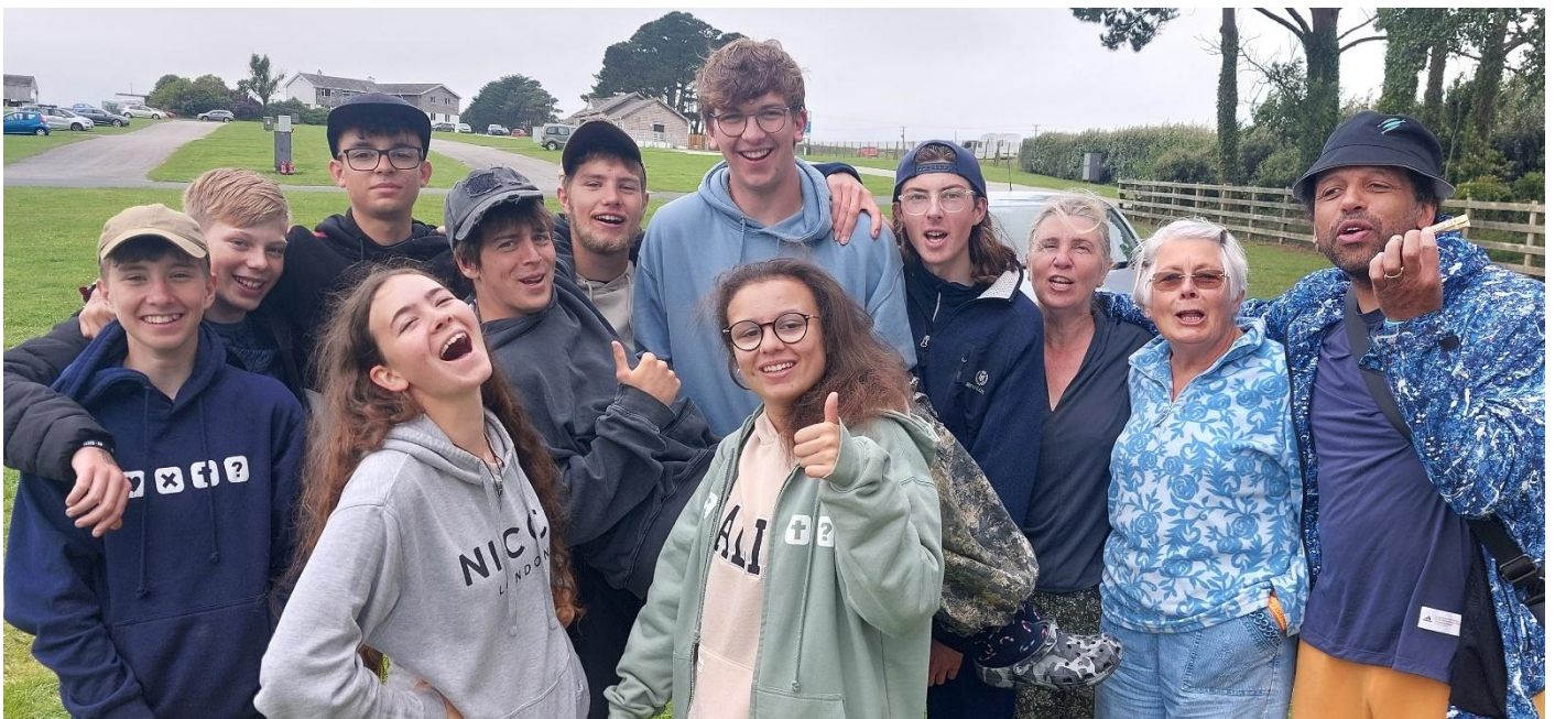
The Youth Group at CreationFest