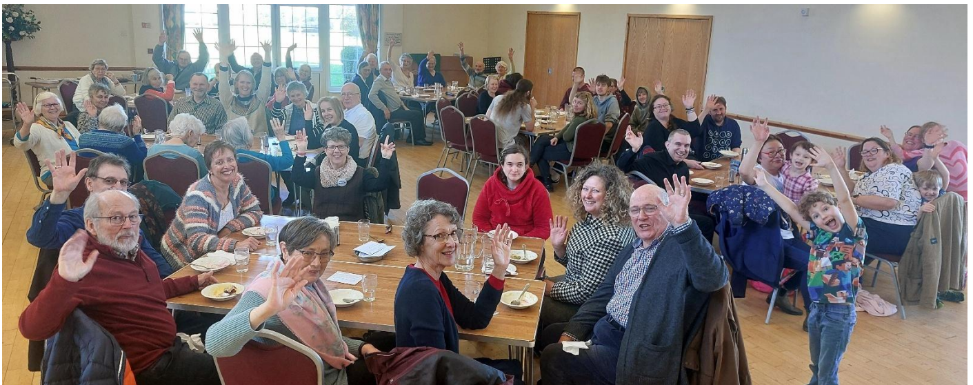
St Faith's Lent Lunch, in spring 2024