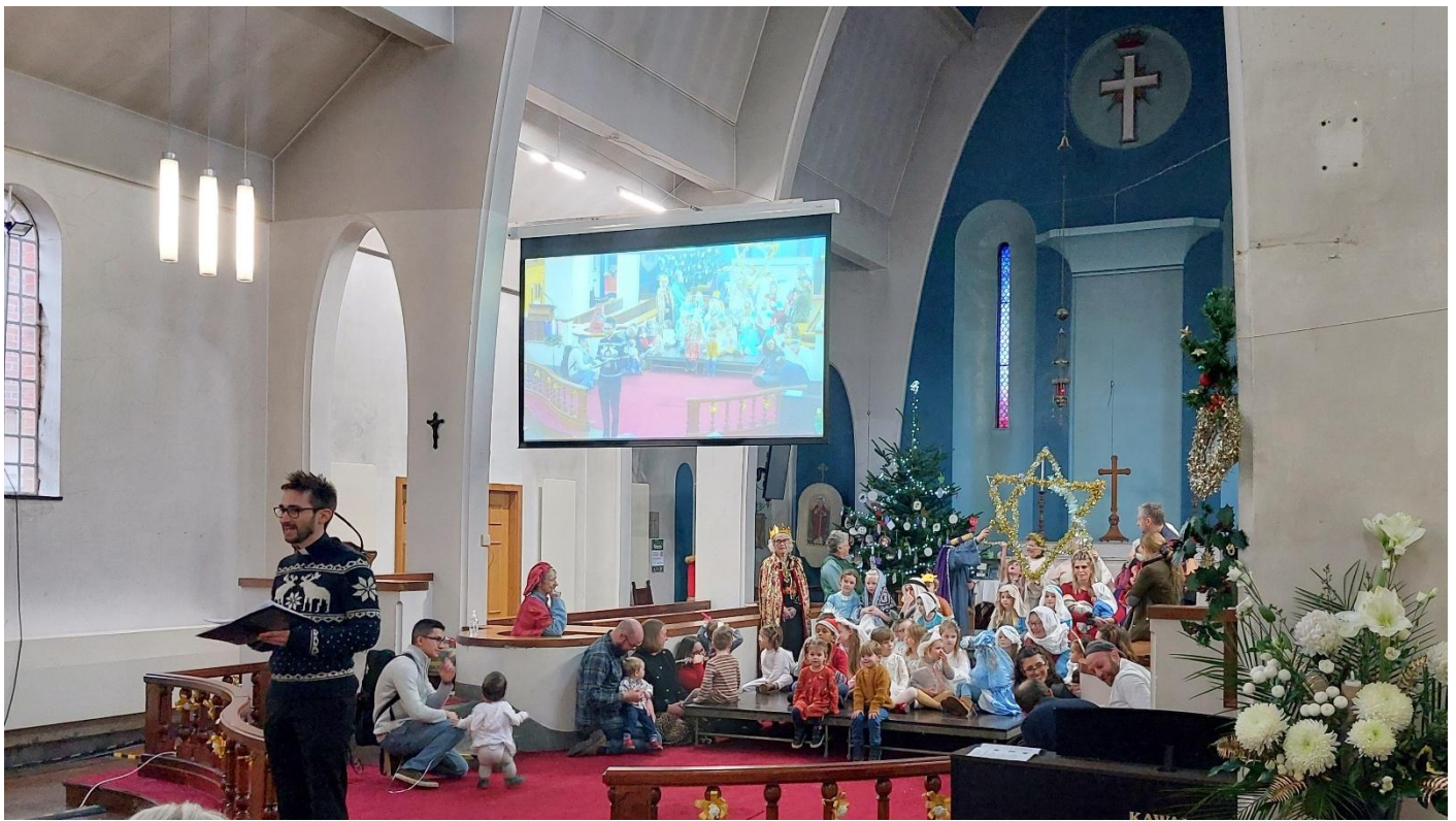
The Crib Service on Christmas Eve