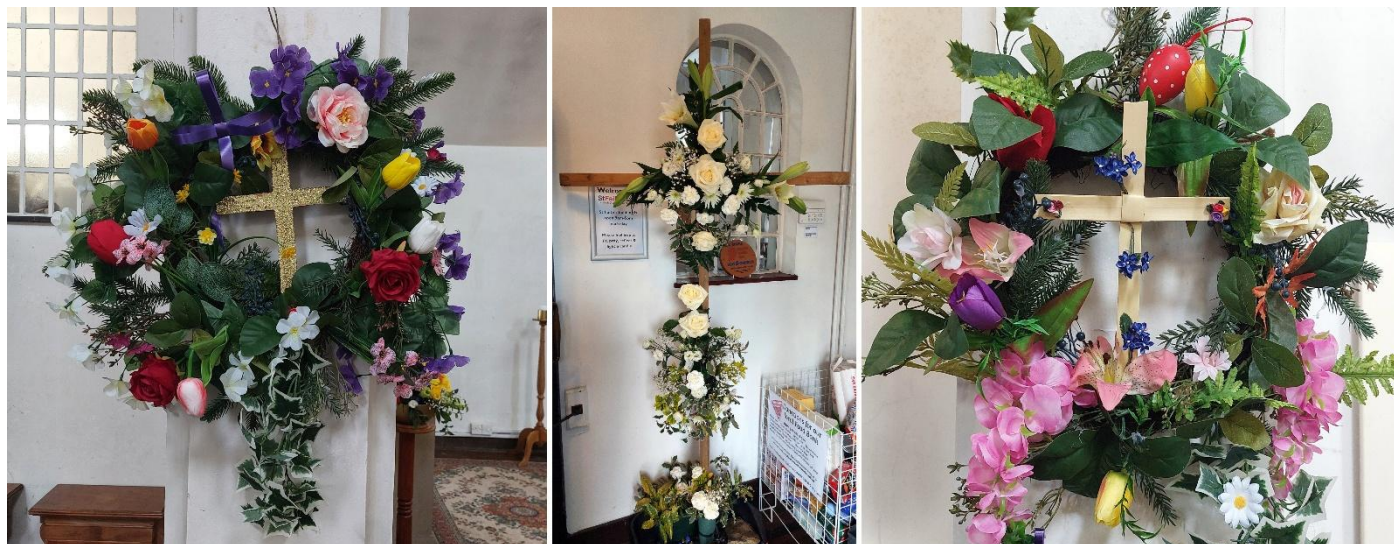
Easter Day flowers