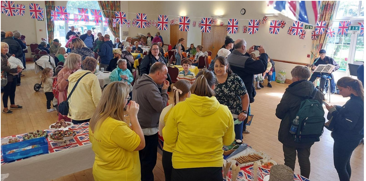
Judging at the Great Lee Bake Off