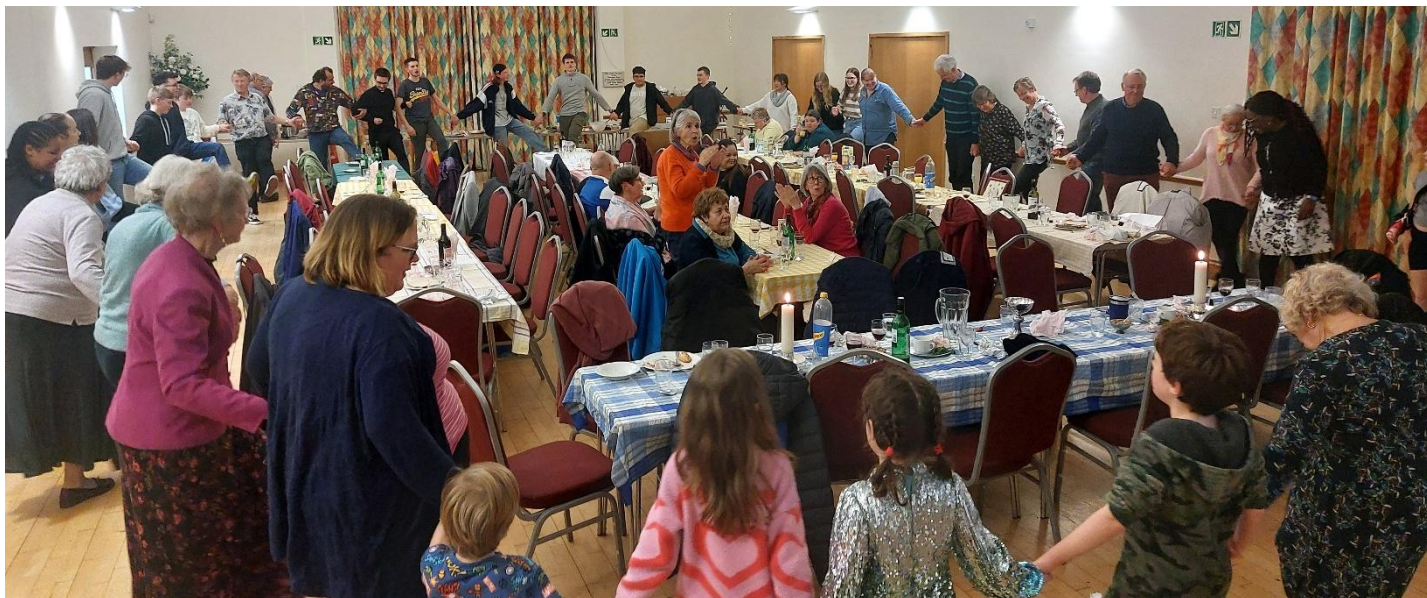
Passover Celebration on Maundy Thursday