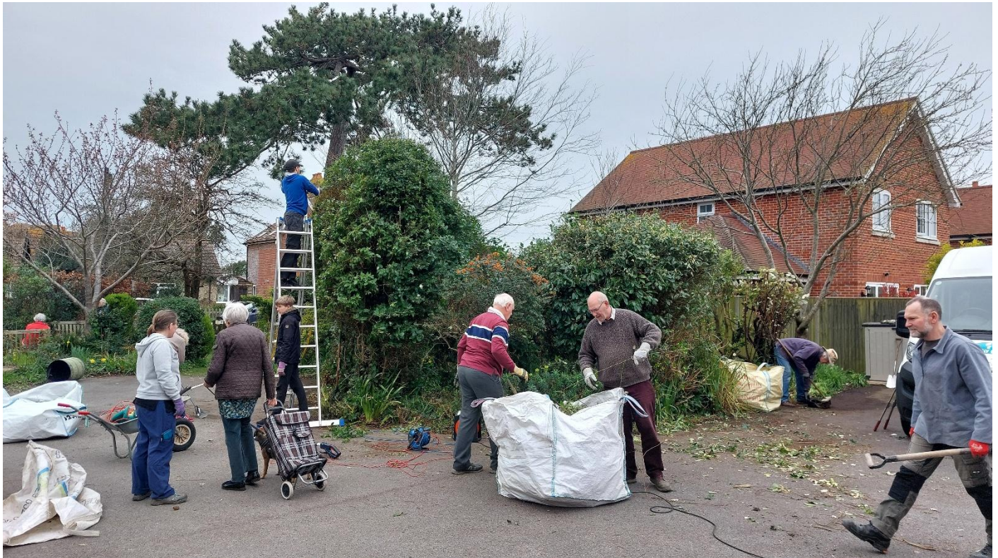
Working on the Garden of Remembrance in spring 2024