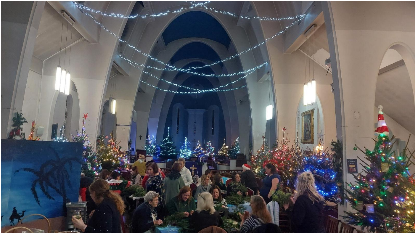
Wreath making at the Christmas Festival

While visitor numbers were lower than we had hoped, those who came were full of positive feedback, and the atmosphere throughout the weekend was warm, vibrant, and deeply appreciated. We also raised a small financial surplus, though this was not the main aim of the event.