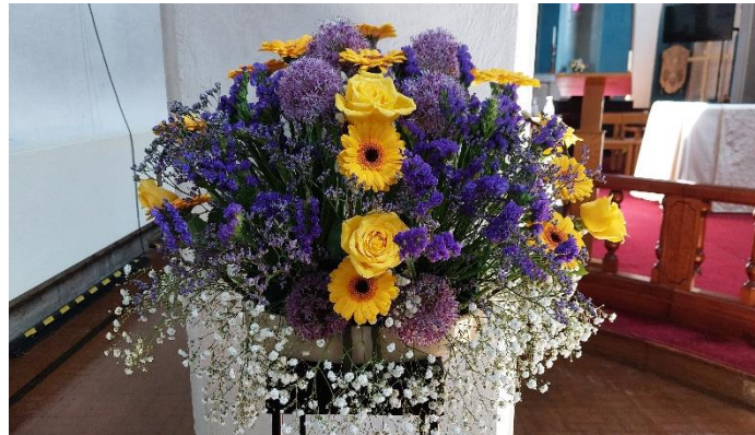
Flowers for the King's coronation celebrations