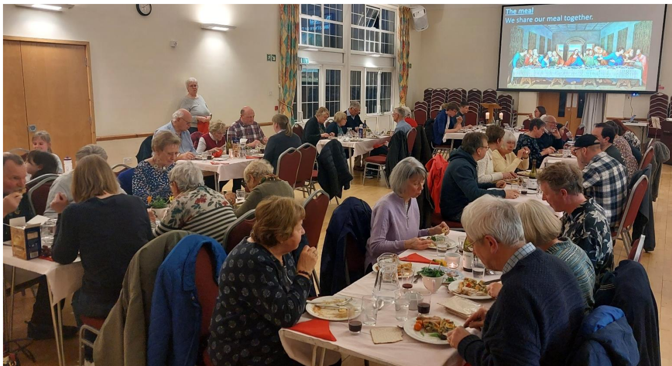
Passover Celebration on Maundy Thursday