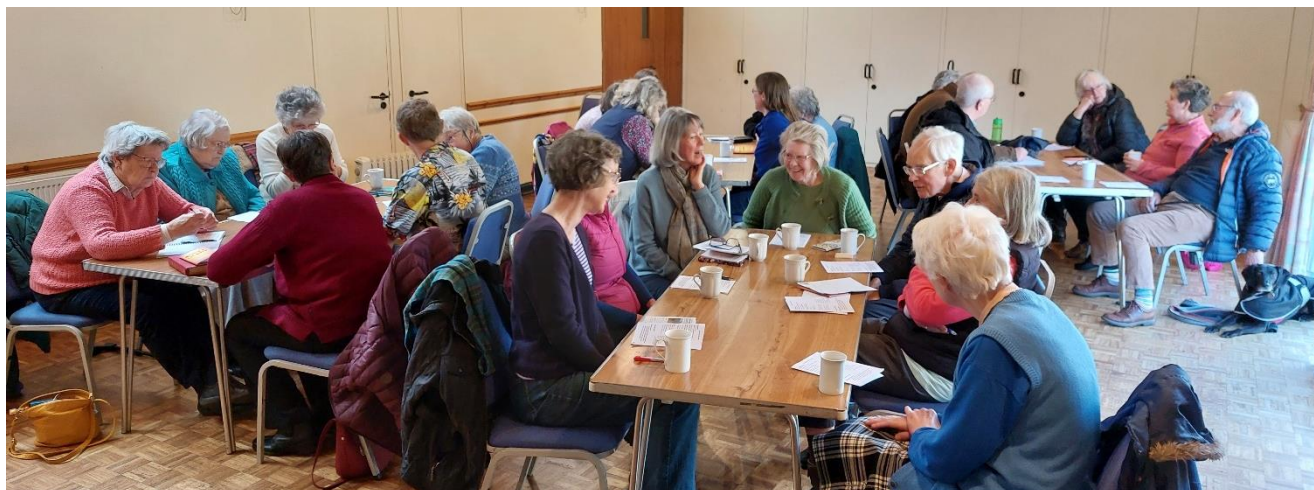
A session at the 2023 Lent Course

We would like to offer parenting courses, Parenting for Faith courses to resource parents, grandparents and all those supporting children, and more regular kids clubs, as well as continuing with all of the above.