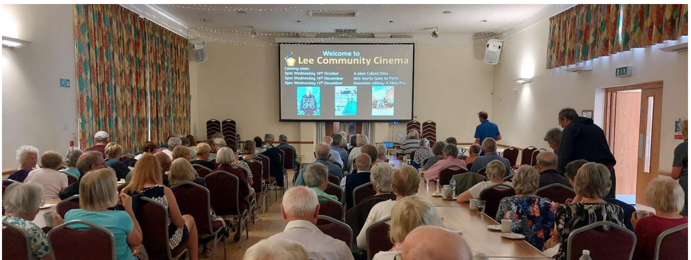
Lee Community Cinema, in the Bulson Hall

I would like to thank our Parish Centre Oversight Group for their continued support. This is a very exciting time for the Parish Centre and I would like to thank our church members, volunteers, and all our hirers who have stayed with us over the last year, but to also welcome new ones too. What a great community we have here.