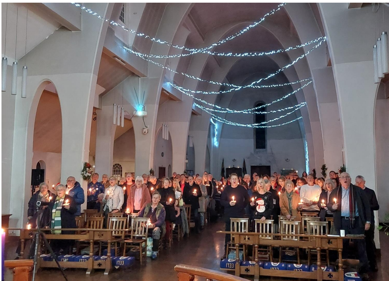
A packed church for the Carol Service in December 2023

If you have any ideas about how we can enhance the welcome given, do let me know. Also, should you be interested in joining the welcome team for your service, do get in touch - we always need more volunteers for this important task.