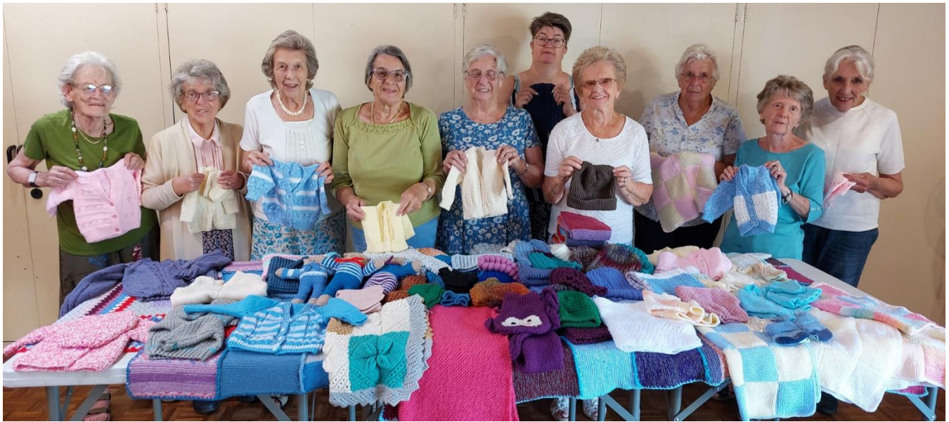
Our Knit and Natter group, displaying the items they have made to send to Ukraine

church decided to provide a Warm Space under the national initiative and we were pleased to join forces with them. We therefore had a good number at this event.