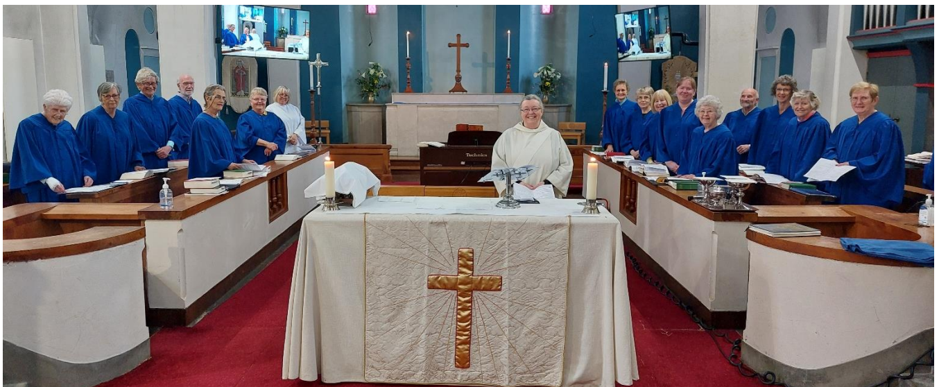
St Faith's Choir

Our year finished when we hosted the Deanery Advent Carol Service in December. It was rather bizarre to sit amongst the undecorated Christmas trees which had just been put in place for the Christmas Tree Festival! We were delighted to have our Diocesan President welcome and 'admit' our latest branch member at that service. We look forward to the year ahead.