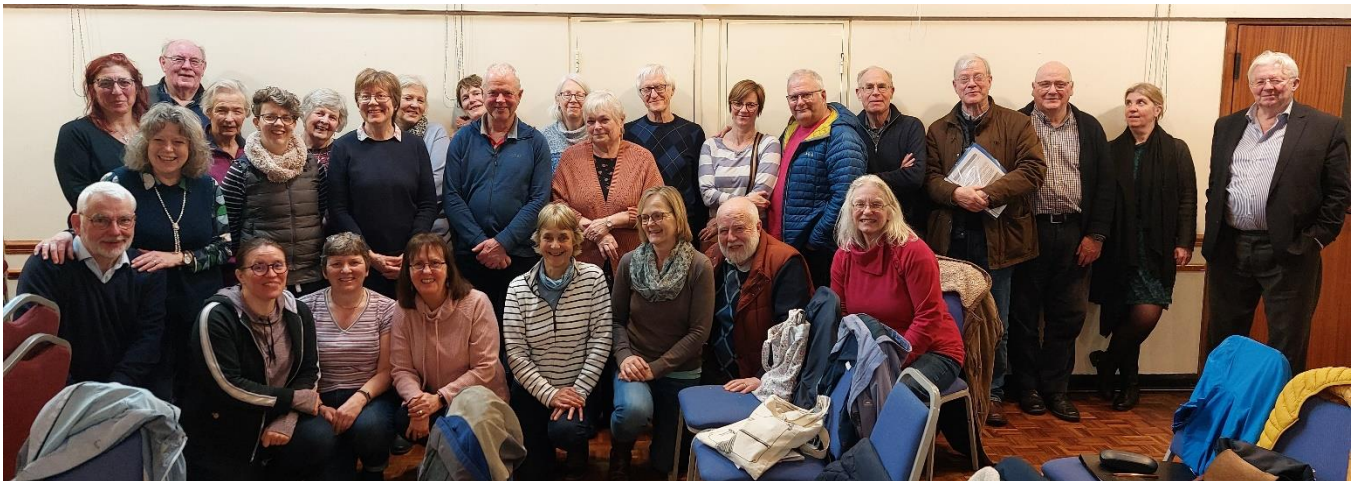
The Lay Worship Leaders Course, spring 2023

A full financial statement will follow but as of 31 st December 2023 we have a balance of £4,672.67 which includes our reserve of £1,500.