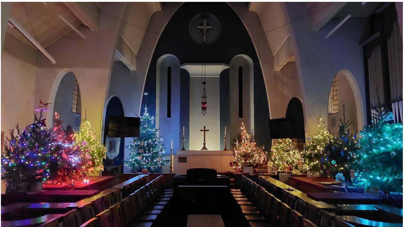
Trees at the Christmas Tree Festival

A huge number of church volunteers spent hours planning and delivering this for the community, so a huge thankyou and well done is deserved to anyone involved.