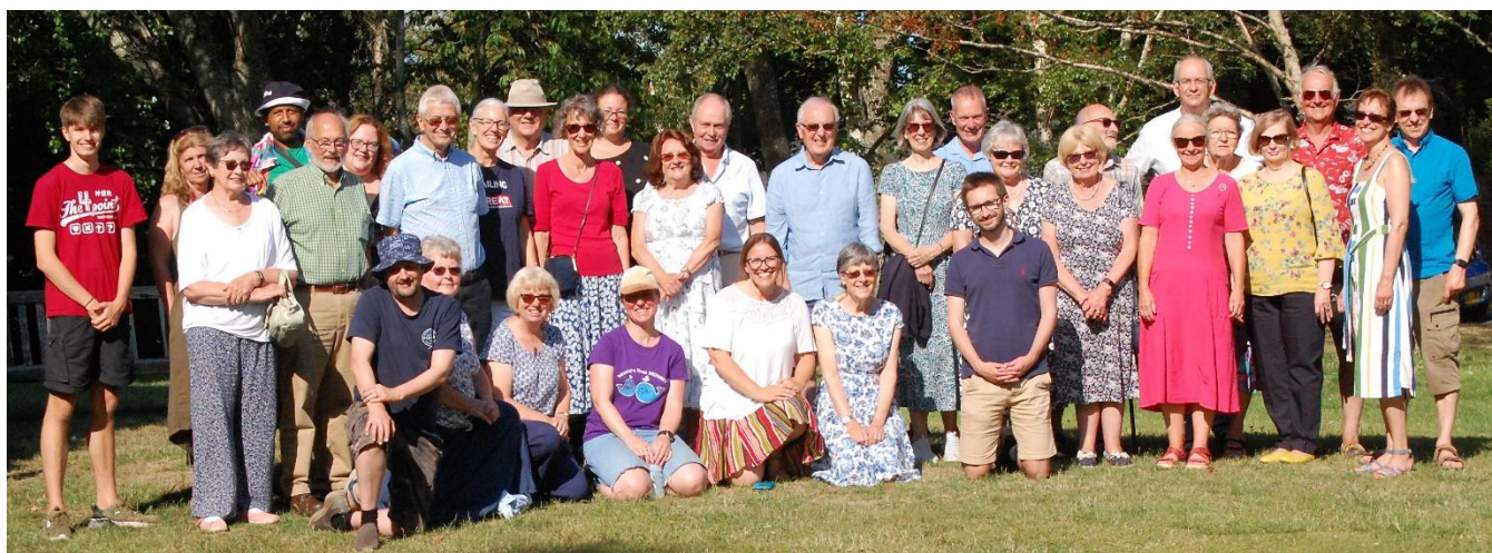
The childrens' and youth team at St Faith's

W4W has always been intentionally dynamic, responding to the needs of the women (and men) in our town. We hope that we can continue to reach out to those in the church community and beyond. As always, my thanks go to the small team of women who help plan, organise, make cakes and serve tea as needed. They are the beating heart of everything we do.