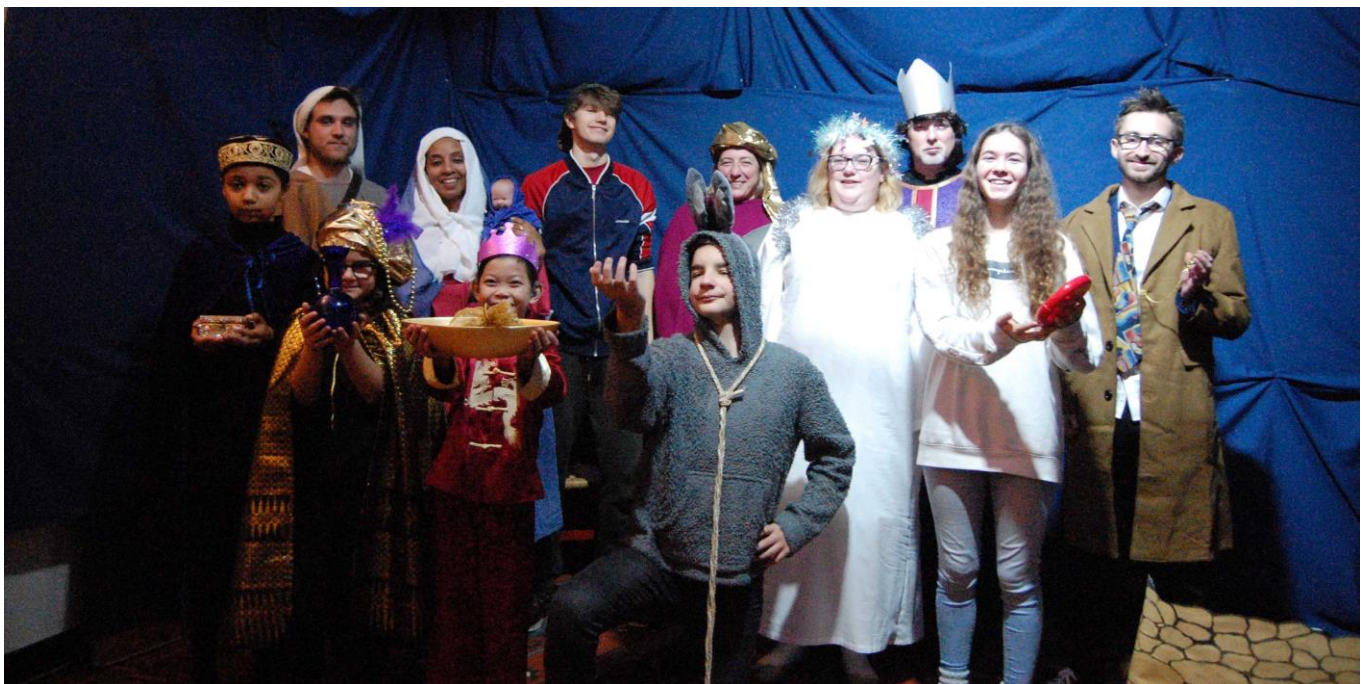
The cast of “Time Travelling at Christmas” – our Live Nativity

If you are interested in sound, vision mixing, autocue, video editing or any of the aspects connected with social media broadcasts please call me - you may never look at TV in the same way again!