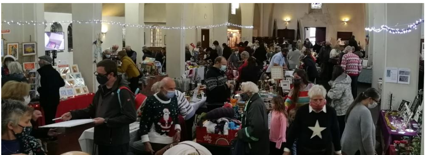
Christmas Festival, December 2021