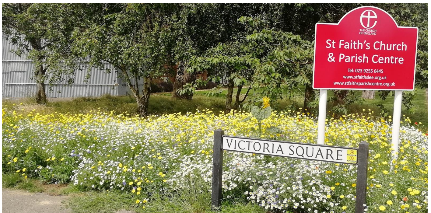
The wildflower area in full bloom, July 2021

We have formulated a Land Management Plan, with the help of the Grounds team, to find ways of making our church land more inviting for nature and to help reverse the trend in declining insect populations. We cleared 2 areas for wildflowers at the south of the church, one for perennial grasses and the other for annual cornfield type flowers. The annual patch was a colourful delight in the Summer and was visited by pollinating insects. We also allowed a small area of grass to be left unmown to provide shelter for a variety of insects and small mammals. As part of our desire to link with other community groups we joined the Hampshire and Isle of Wight Wildlife Trust's Team Wilder project and have also formed links with the Gosport and Fareham Friends of the Earth group. A log circle area was created in the large grass area behind the Bulson Hall for use with small groups for prayer, teaching etc. Remembrance Circles of Spring flowering bulbs were planted at the front of the church to remember those who died in the Covid pandemic.