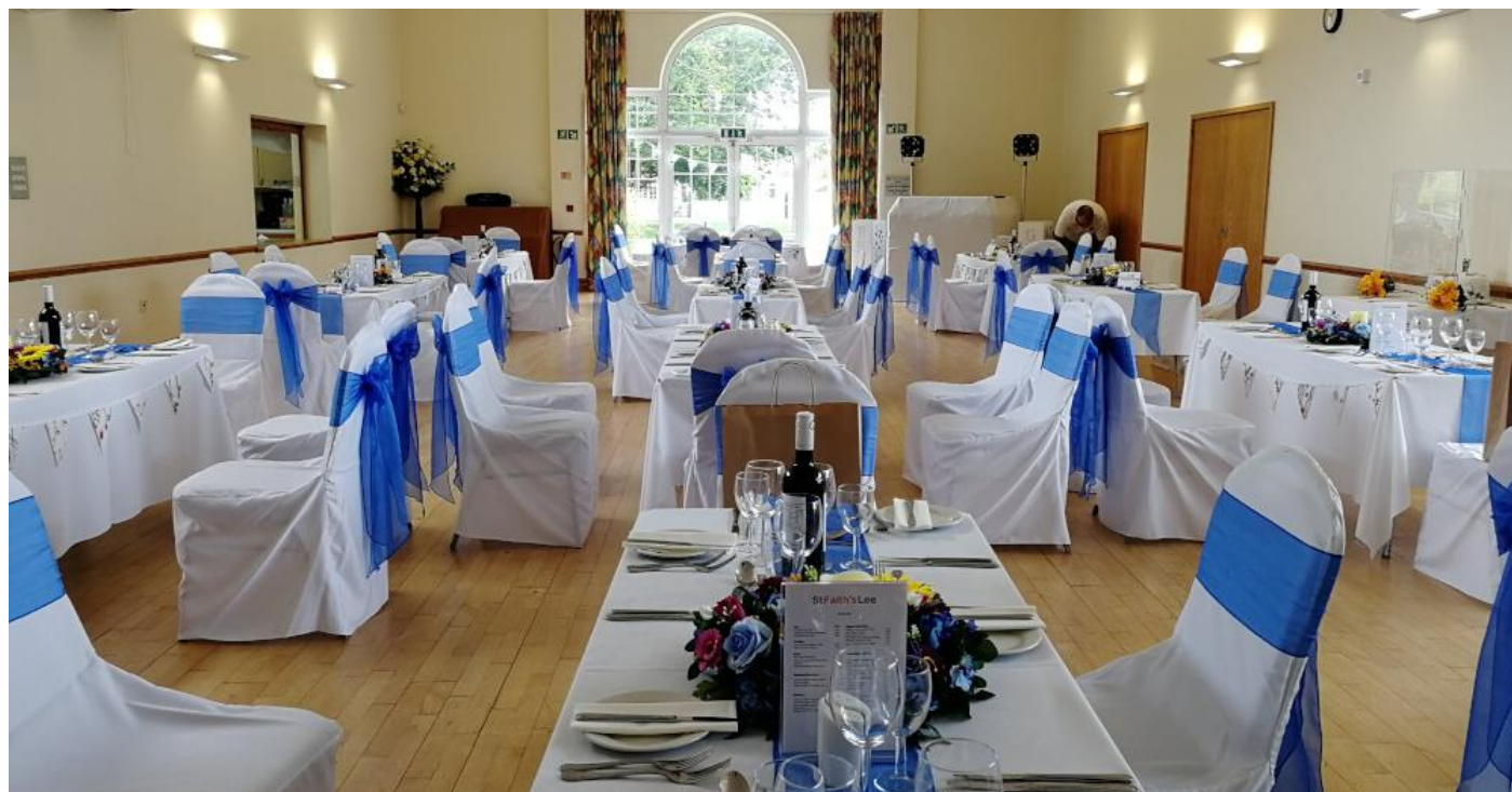
Bulson Hall set for a wedding reception, 5 th July 2021: the first large event in the Parish Centre since the pandemic, and the first to use the bar