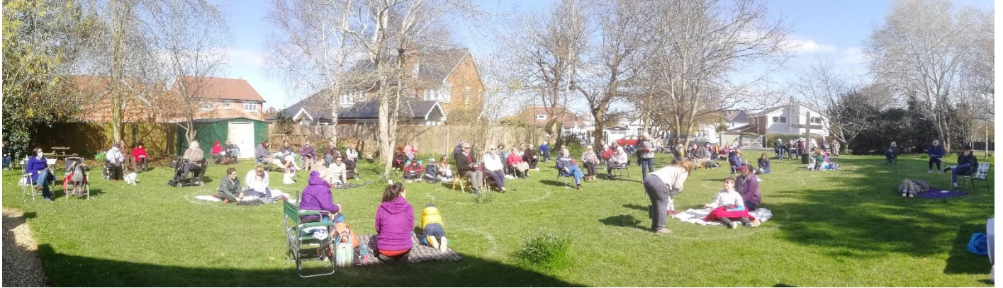
Good Friday for everyone on Victoria Square. Notice family groups are sitting in circles, 2m apart from everyone else.

In the Spring we also launched St Faith's Recycling Hub, led by the People and Planet Group, encouraging the church and wider community to recycle items which we can't put in our household recycling bins. The Group also did the preparation work for new wildlife-friendly areas around the Square, particularly in the south east corner, which by the summer was ablaze with flowers and colour, and helped provide food for pollinating insects.