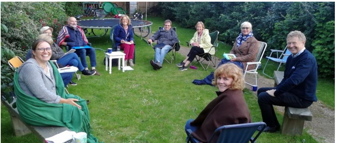
An outdoor meeting of the People and Planet group in the vicarage garden, July 2021. Note that although it was July, it wasn't very warm!