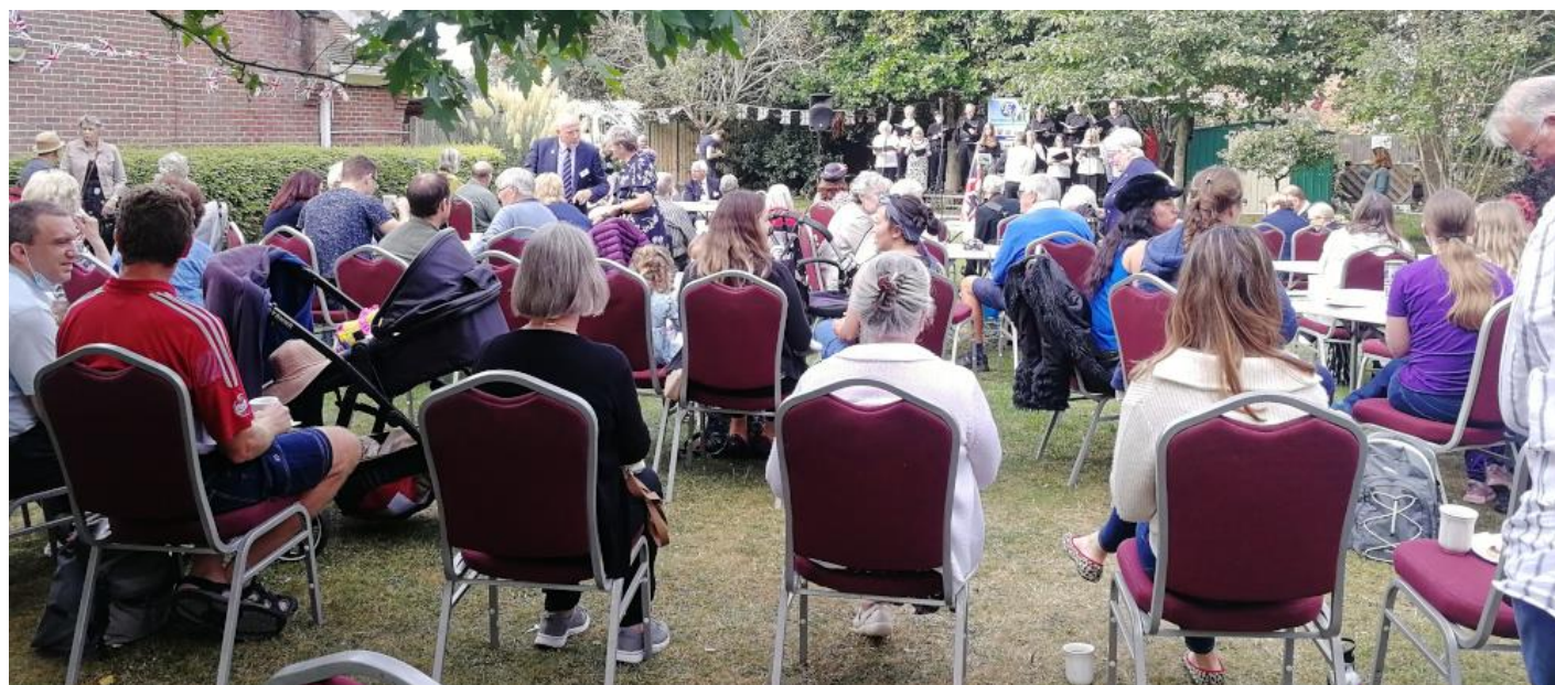
Lee Victory Festival at St Faith's, September 2022