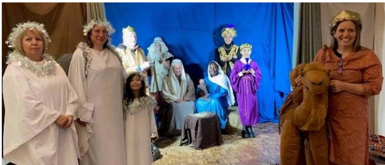
Some of the cast of the Live Nativity, December 2021