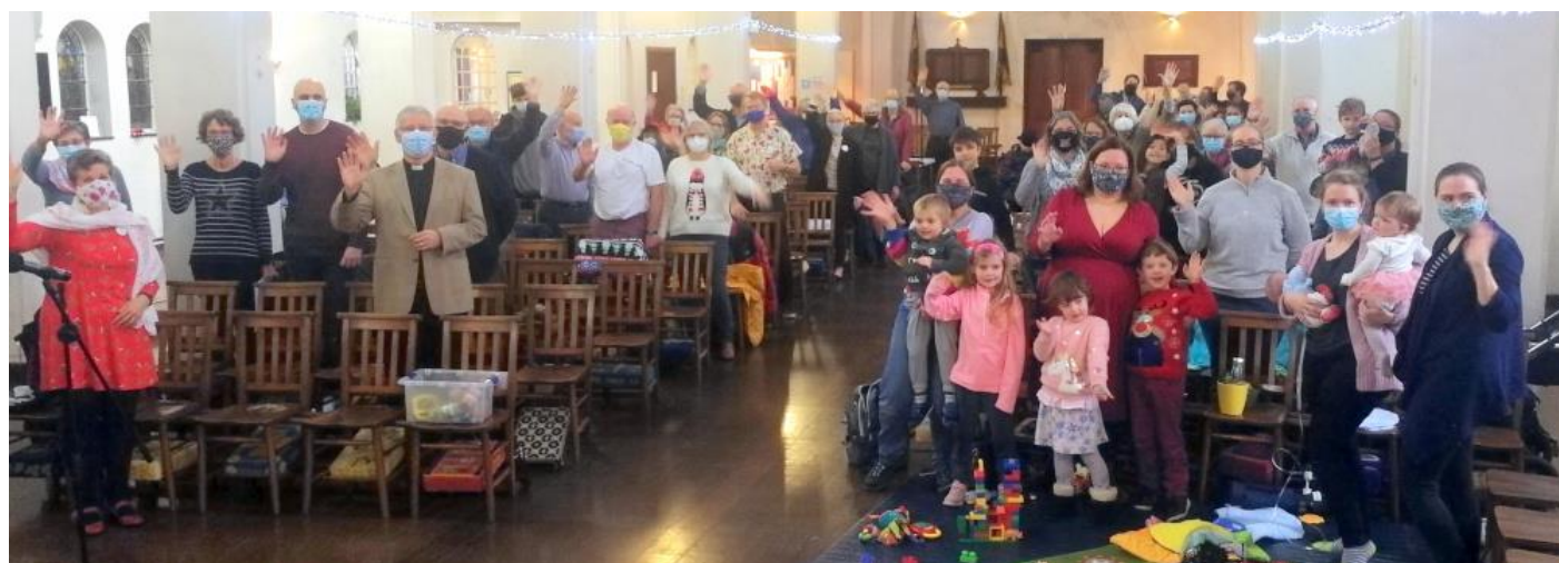
Sundays@11 in December 2021