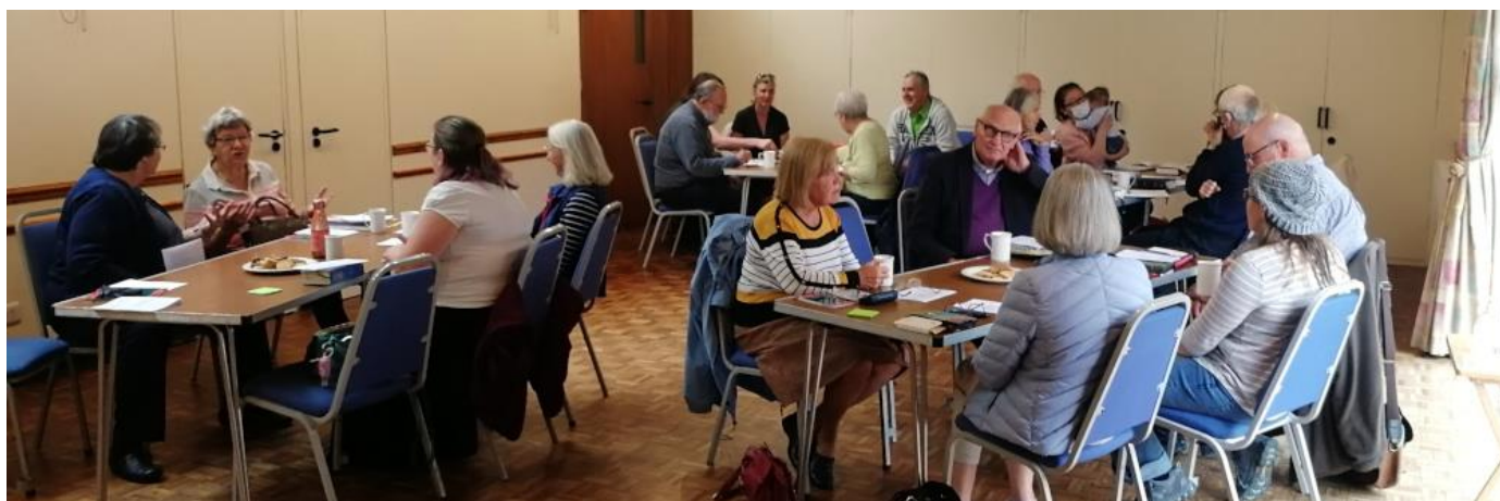
Holy Habits course in the Lowry Room, October 2022

There are 9 Holy Habits, and we started with “worship”. Using material from the Bible Reading Fellowship’s Holy Habits, we spoke about worship on Sundays, and because things were increasingly able to take place in person, we also held a weekday Holy Habits Course.