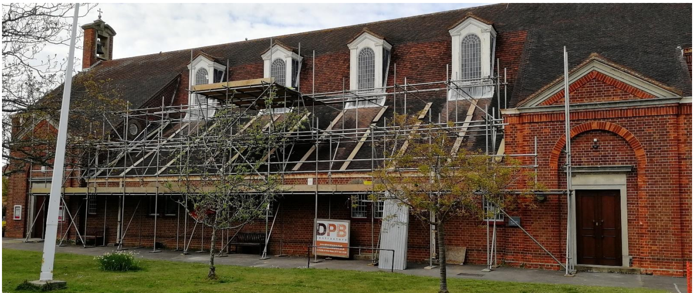
Scaffolding being erected on the south side of the church, 29 th April 2021