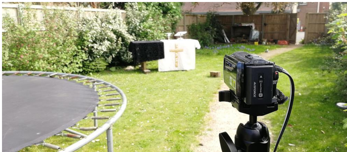
Recording services in the vicarage garden