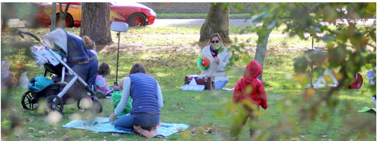
Outdoor Toddlers in October 2020