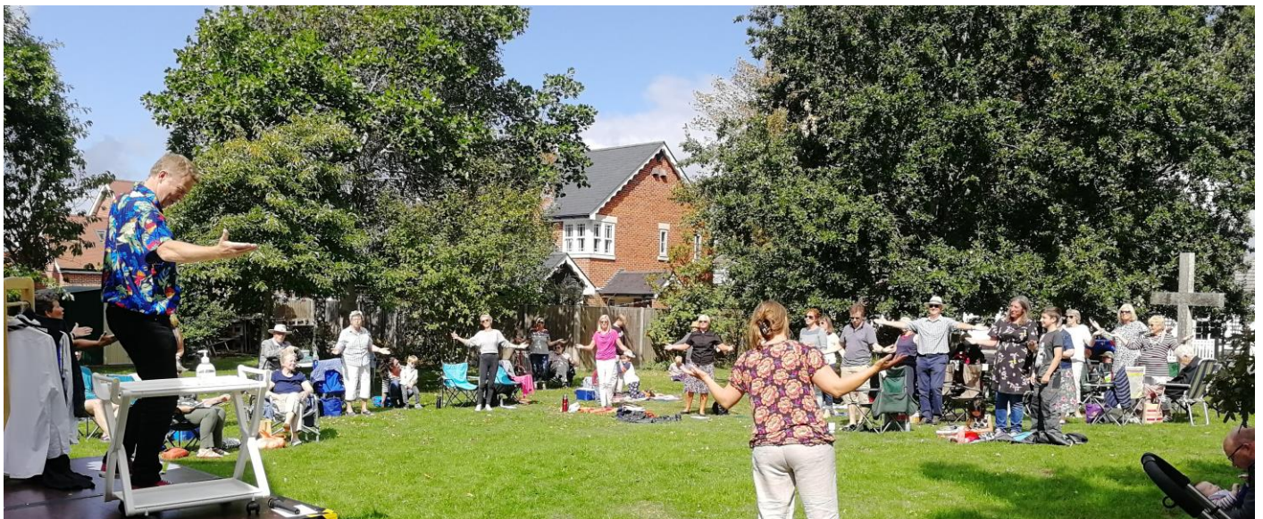
Picnic Church in September 2020