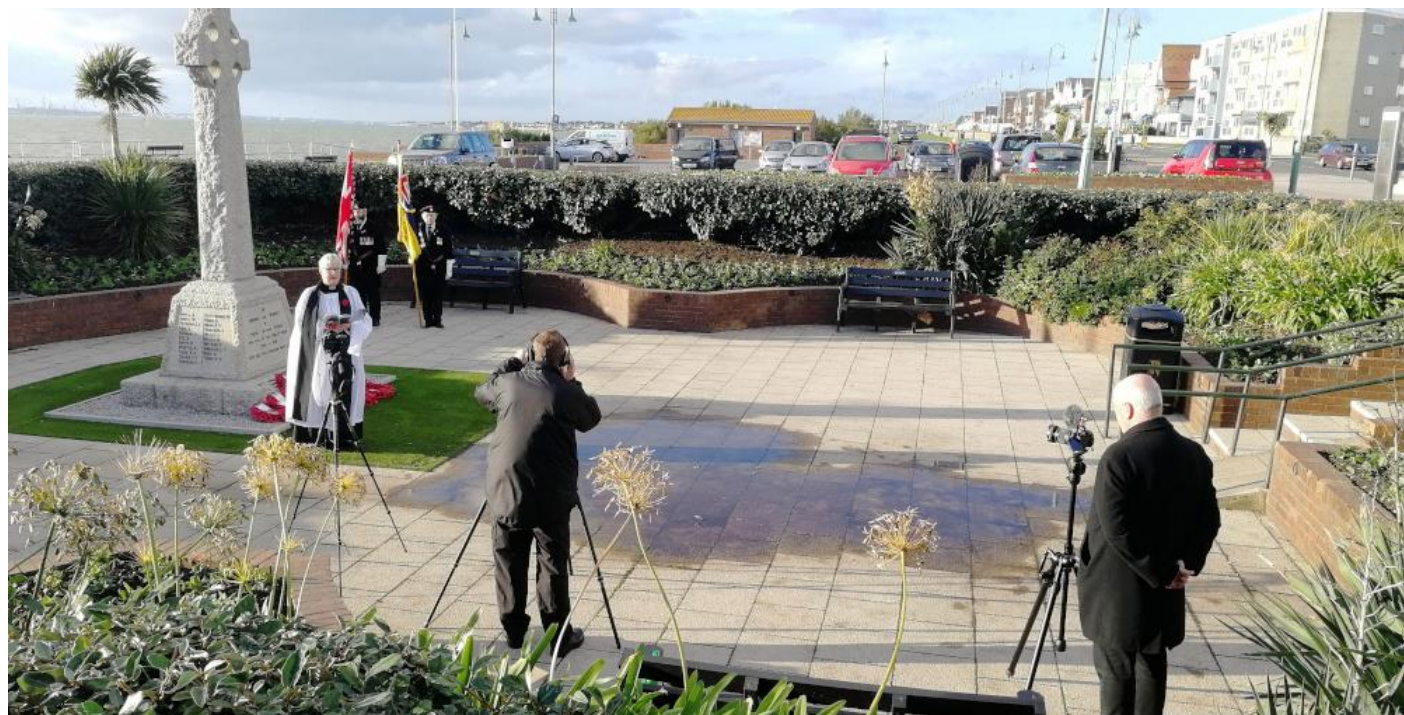
Filming for Remembrance Sunday, November 2020