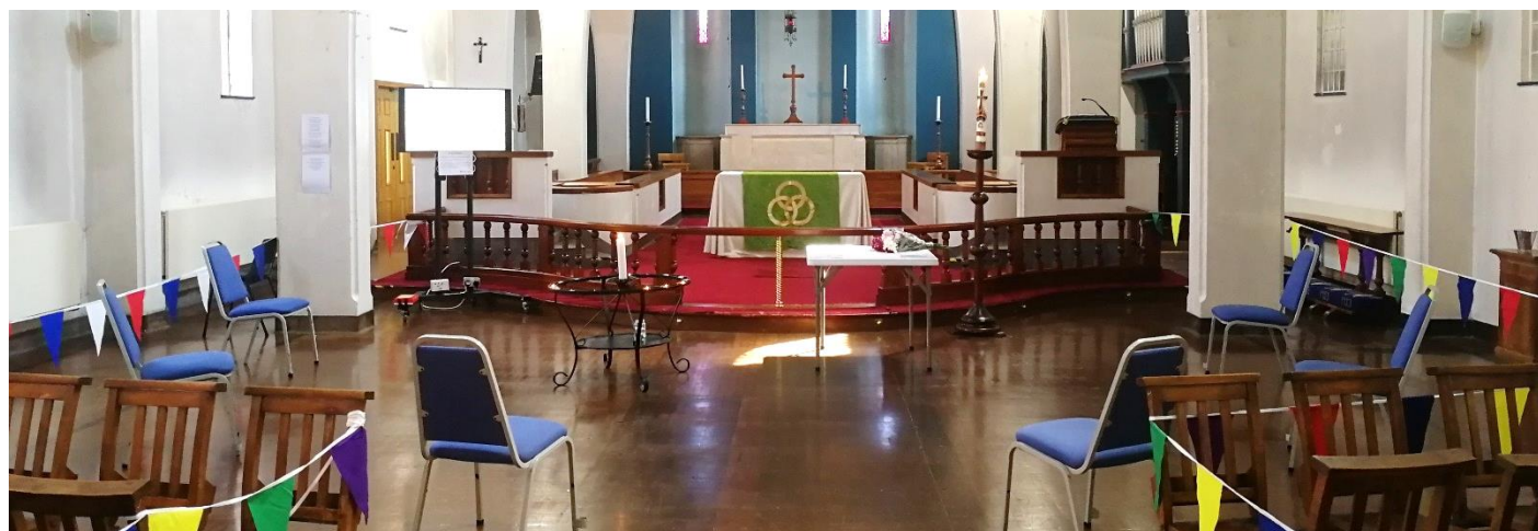
St Faith's prayer space after the church reopened in June 2020