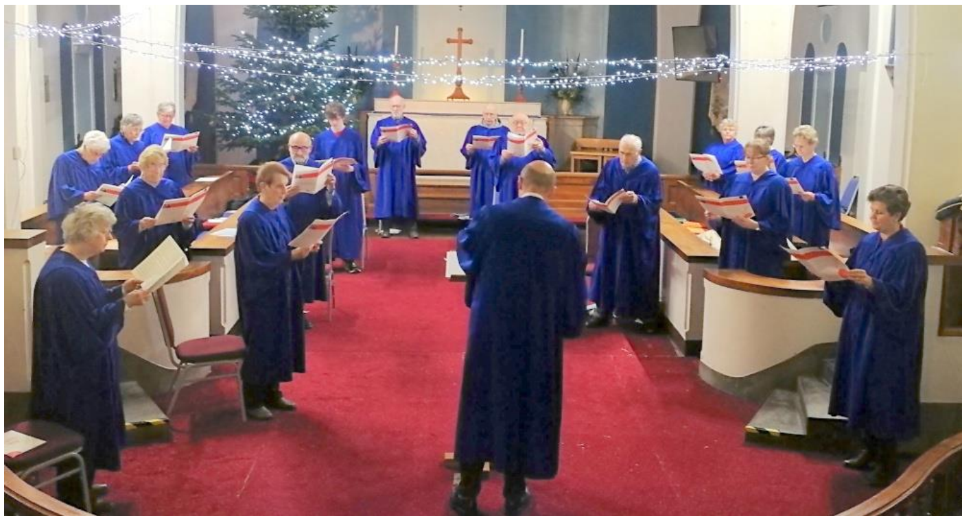
Our socially-distanced choir at the recording of the online carol service, December 2020