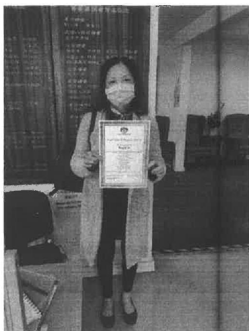
Member received the Food & Hygiene Certificate after passing the exam.