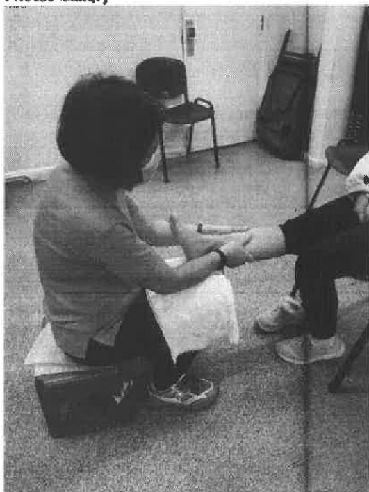
Members received Foot Massage Service

Achievements and performance (continued) Photos Gallery