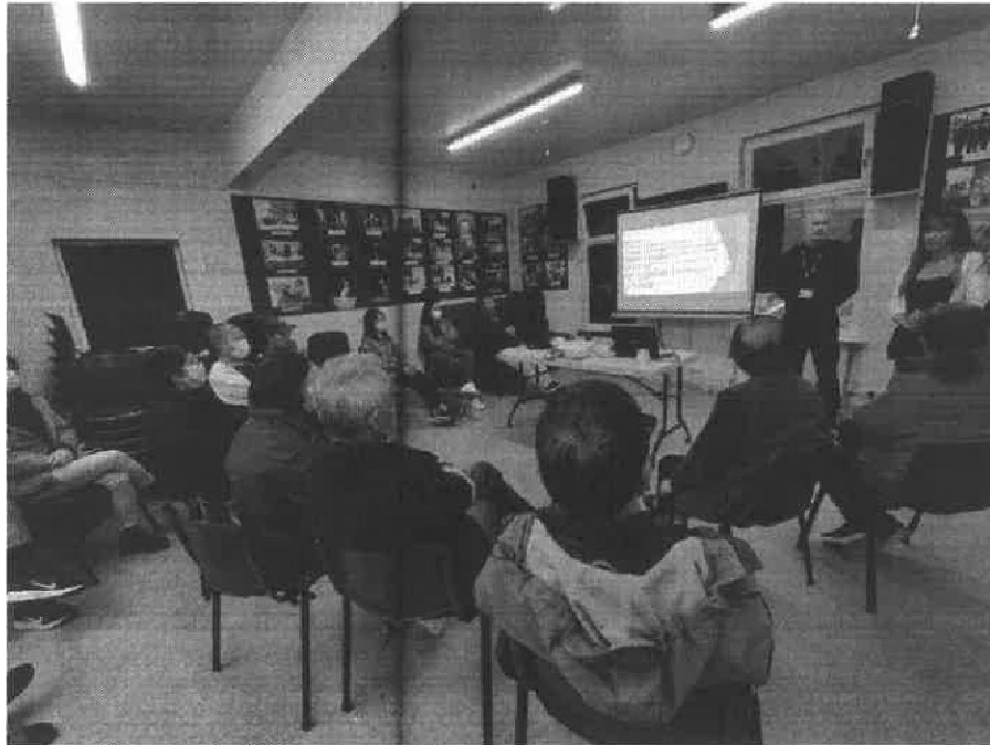
Hate Crime Awareness Workshop on 14 th October 2021

Achievements and performance (continued) Photos Gallery