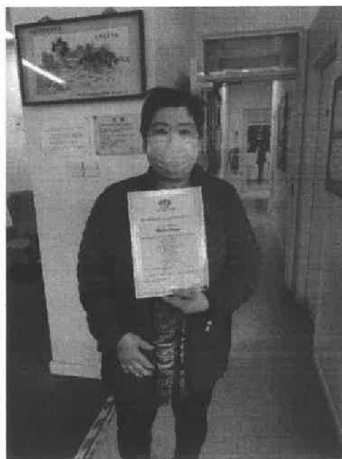
Member received the Food & Hygiene Certificate after passing the exam.