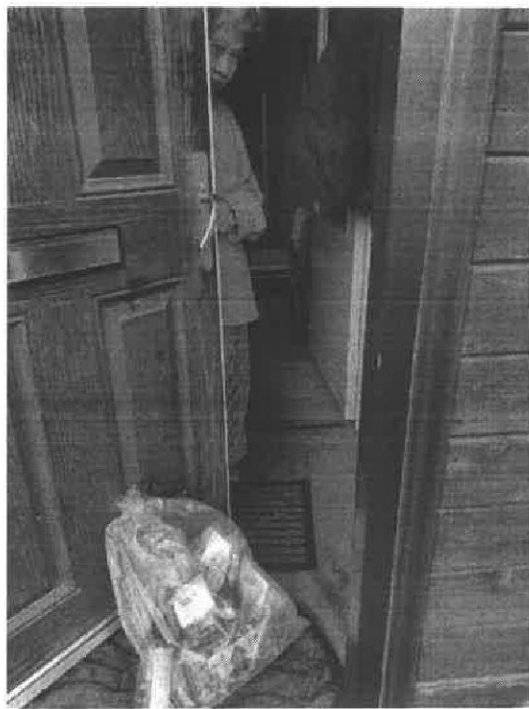
Member received gifts for Chinese New Year 2022