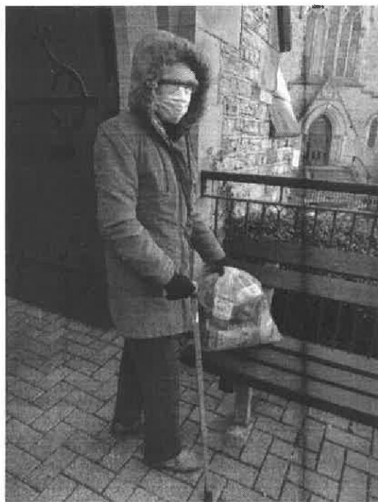
Elderly members received gifts for