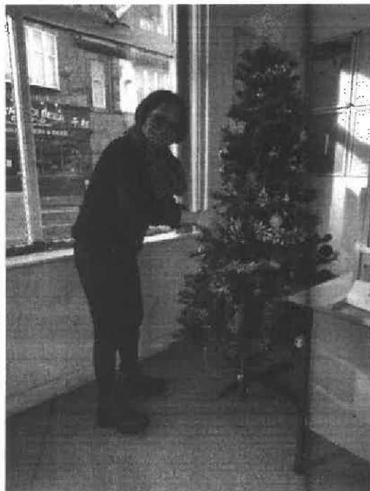
Volunteer decorated the Christmas Tree in Dec. 2021

Lord Mayor's Christmas Thank You Event for Sheffield's Lunch Club Volunteers at the Sheffield Town Hall on 10 th December 2021 and we received the Prize for winning the Henderson's Choice Award from the Lord Mayor