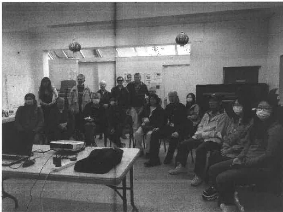
Hate Crime Awareness Worksop on 14 th October 2021