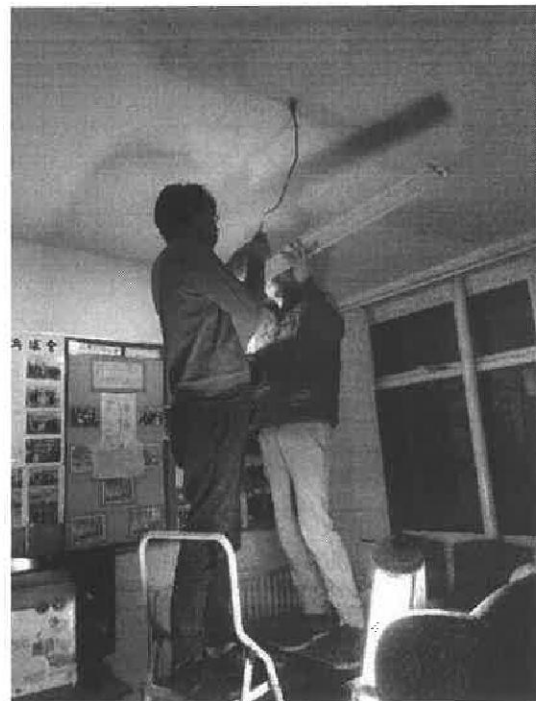
Volunteers helped to install LED lightings for the Centre