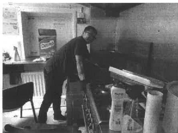
Volunteer helped to do the deep cleaning of the Centre's kitchen on 17 th August 2021