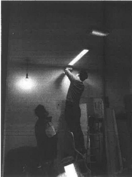
Volunteers donated the new LED lightings to the Centre and helped to install all the lightings for the Centre in Dec. 2021