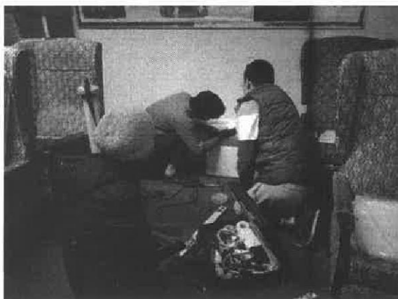
Volunteers donated some heaters and helped to install them for the Centre in Dec. 2021