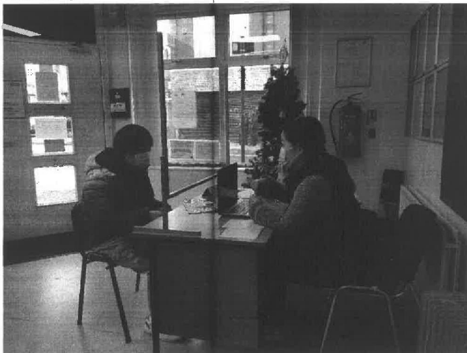
Member received health information and support provided by the Centre staff

Achievements and performance (continued) Photos Gallery